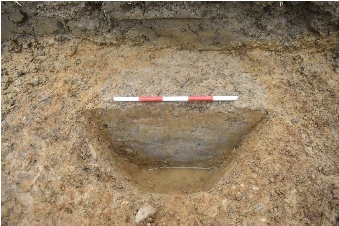
Plate 1.16 Trench 121. Southwest-facing section of pit [12104], looking northeast.