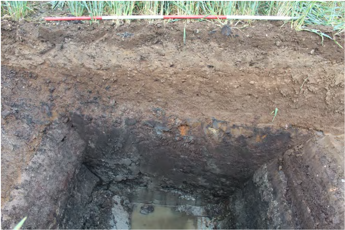
Plate 5.1 Trench 267. East-facing section of test pit, looking west.