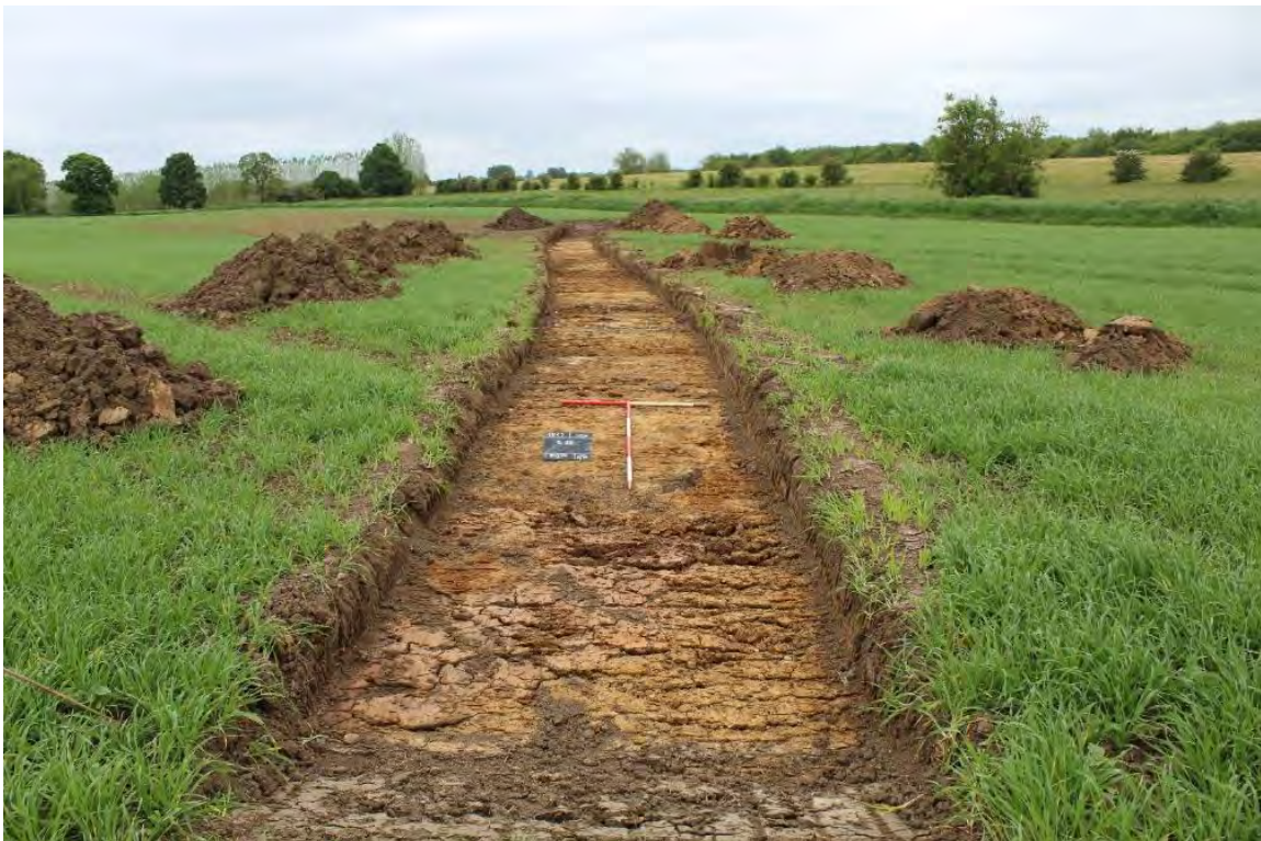
Plate 2.6 Trench 174. Overall shot showing natural stripped surface (17402), looking south-west.