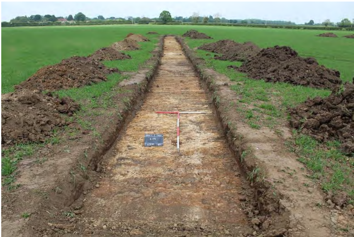
Plate 2.16 Trench 178. Overall shot showing stripped natural surface (17801), looking north-east.