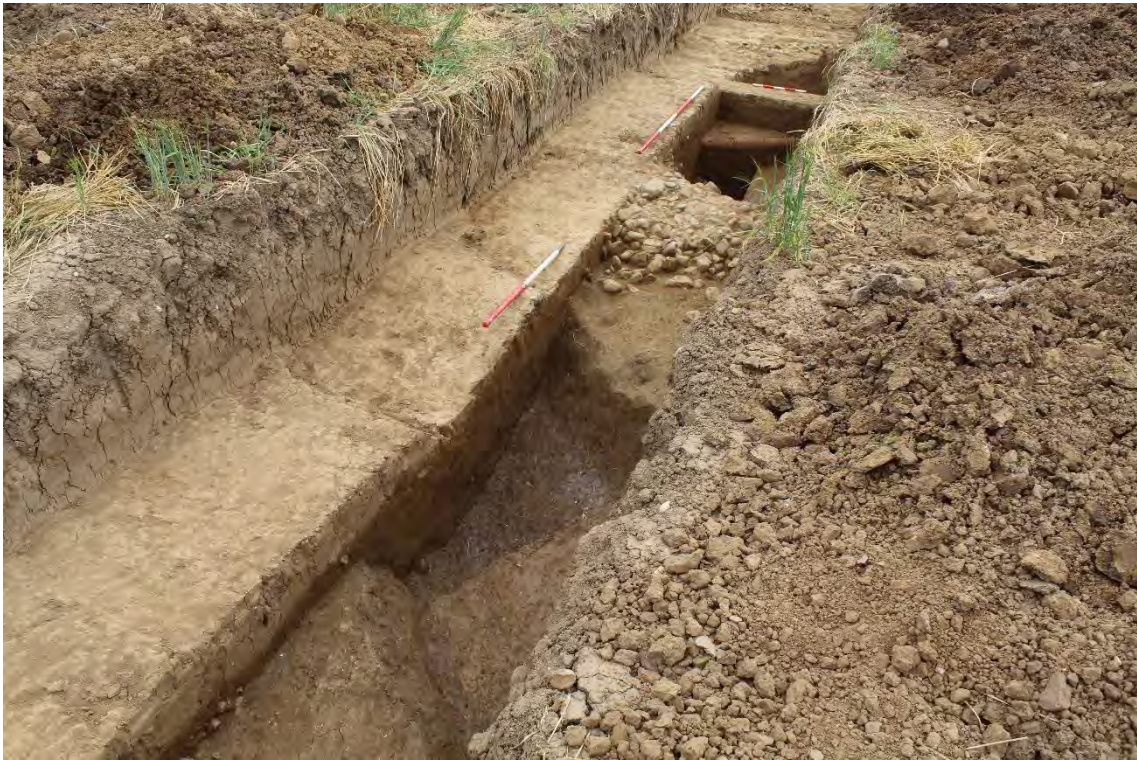
Plate 6.9: Trench 284. Mid-excavation view of watering hole [28405], stone revetment {28407}, and ditch sequence [28406], [28408], and [28443]. Looking southeast.