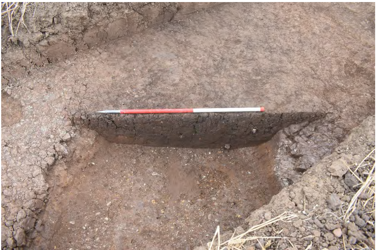
Plate 4.21: Trench 233. Ditch [23325], looking northwest.