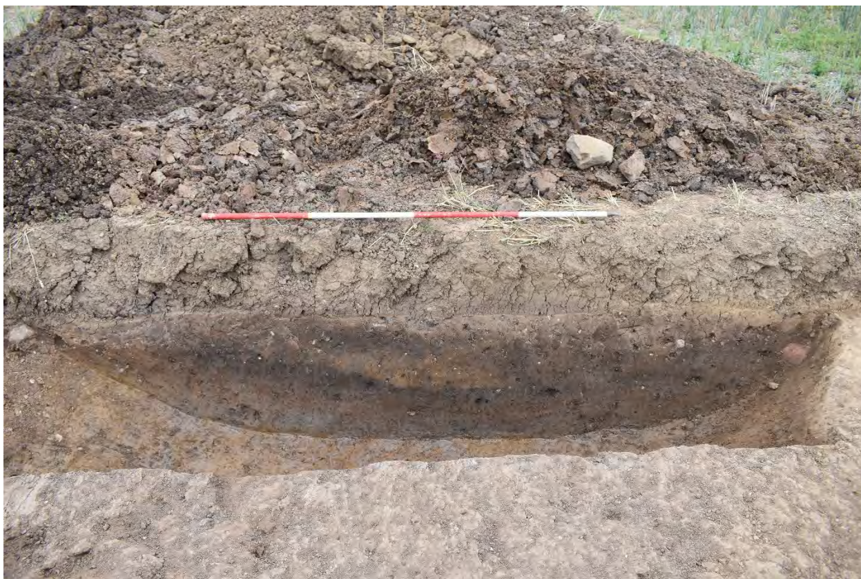
Plate 4.23: Trench 234. Ditch [23409], looking north-northeast.