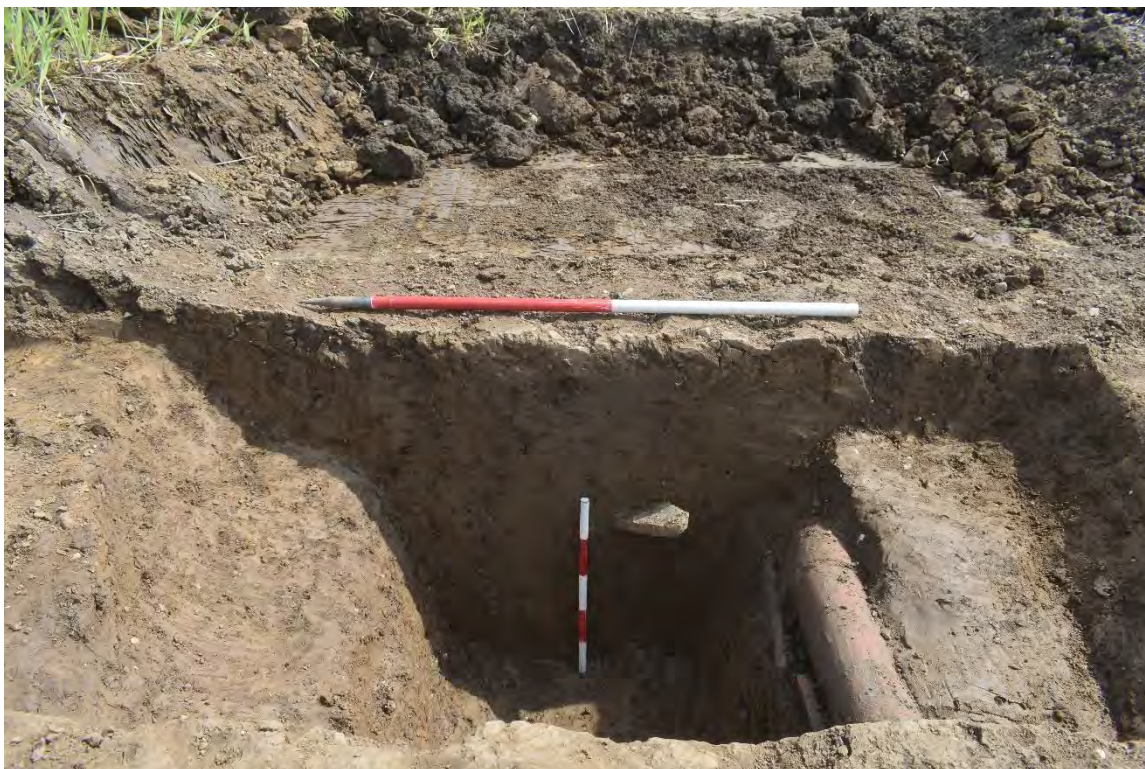
Plate 1.7 Trench 106. West-facing section of ditch [10607], recut [10611] and field drain [10613], looking east.