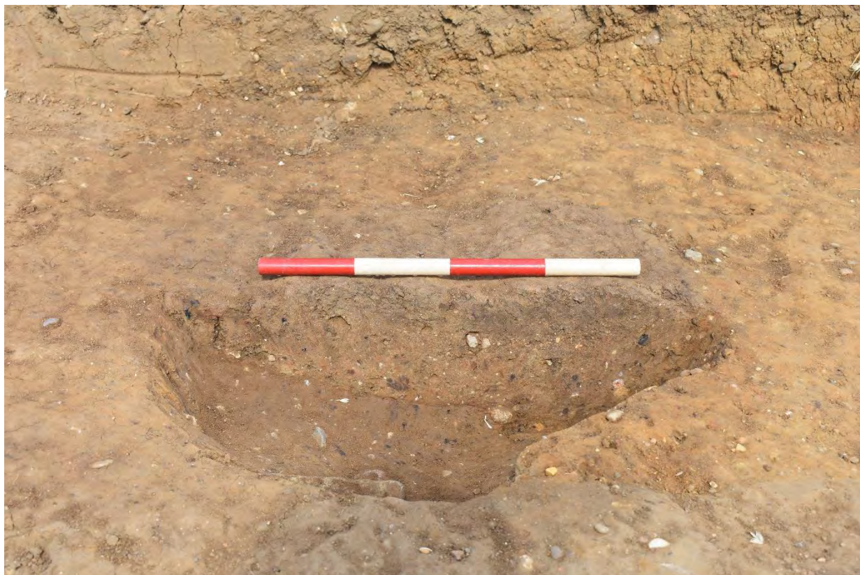
Plate 4.16: Trench 230. Pit [23089], looking northeast.