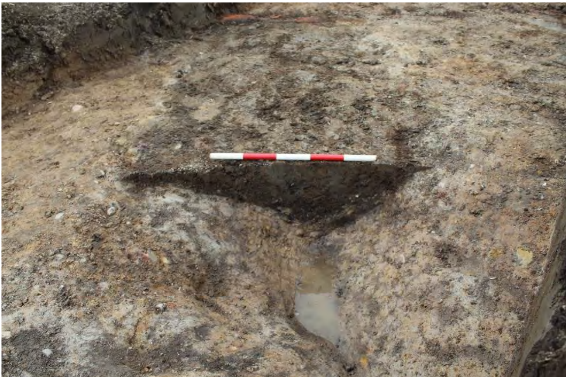
Plate 2.4 Trench 173. Gully segment [17303], looking south-west.