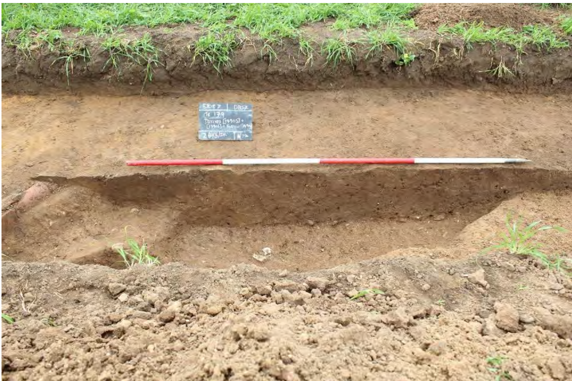
Plate 2.20 Trench 179. Intersection of ditch and gully [17905] [17906] and furrow [17907], looking west.