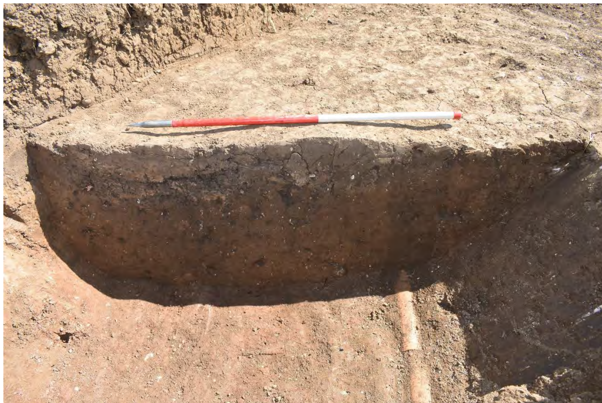
Plate 4.26: Trench 235. Ditch [23503], looking southeast.