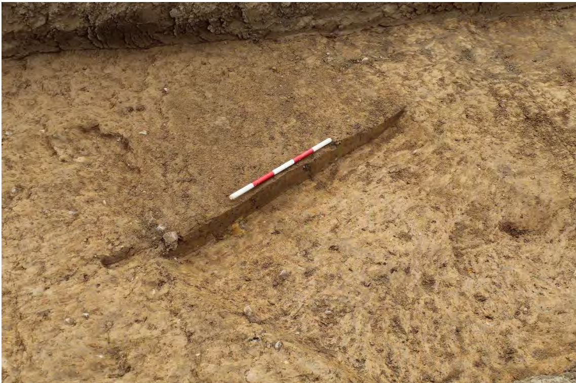
Plate 6.6: Trench 295. Furrow [29505]. Looking east.