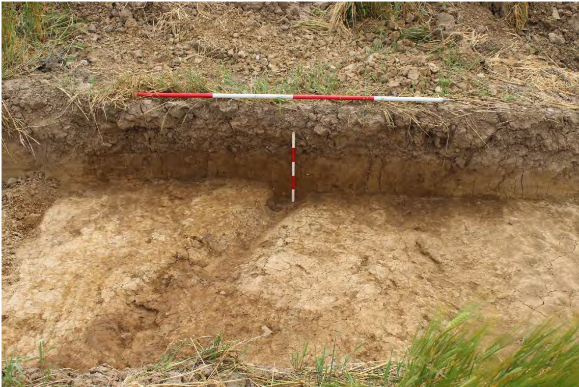
Plate 6.19: Trench 293. Gully [29309] truncated by furrow [29310]. Looking west.