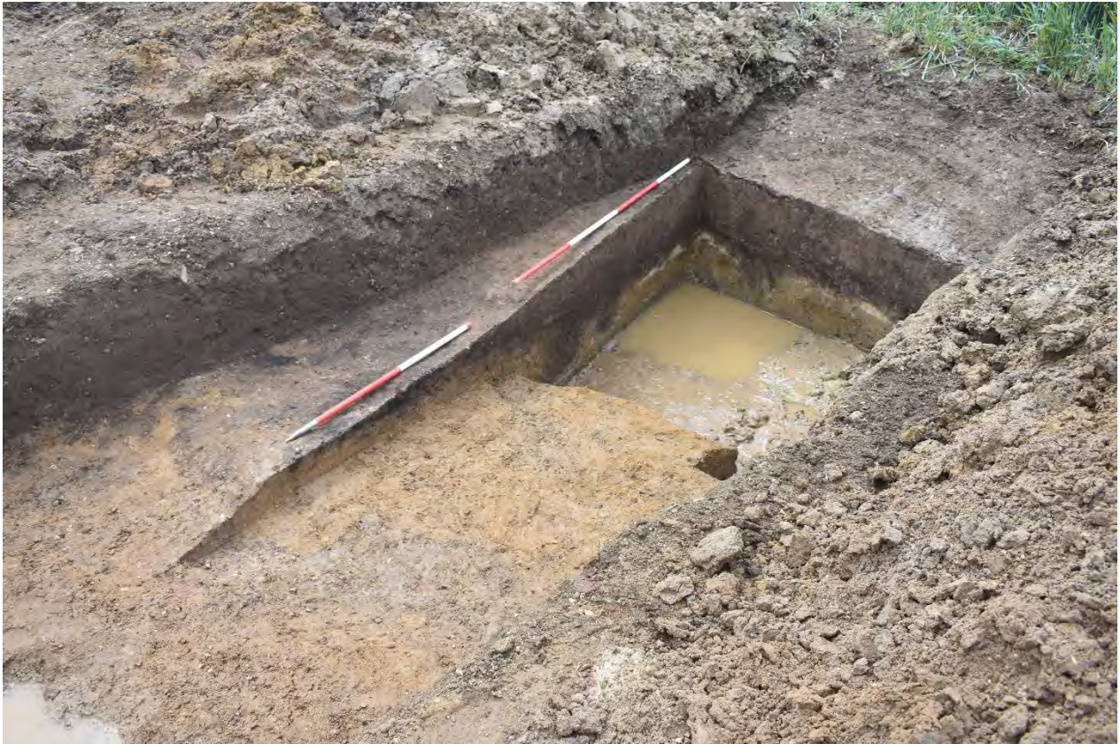
Plate 3.29: Trench 210. Drainage ditch [21009]. Looking southwest.