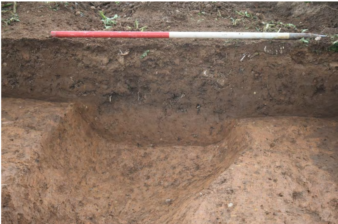
Plate 1.42 Trench 162. North-facing section of gully [16205], looking south.