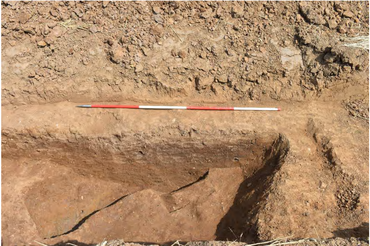
Plate 4.12: Trench 230. Ditch [23052] (centre) viewed on an oblique angle, truncated by [23003], with ditch [23039] in plan in the foreground. Looking northeast.