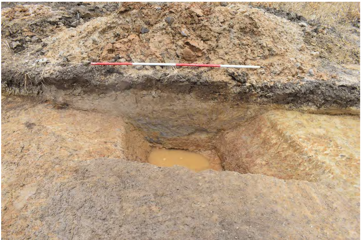
Plate 3.12: Trench 196. Ditch [19606] and pit [19604]. Looking northwest.