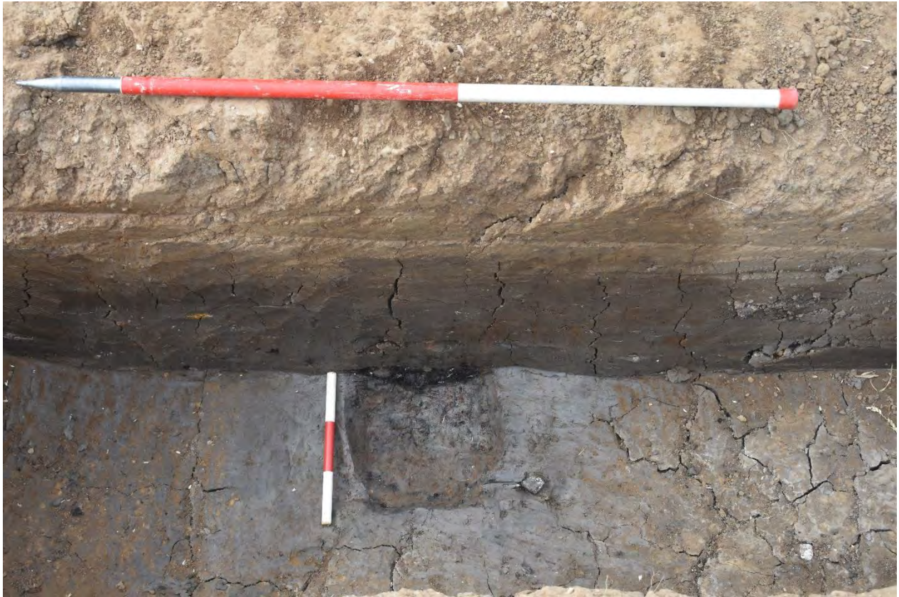
Plate 4.7: Trench 228. Pit [22810] after full excavation, looking northwest.