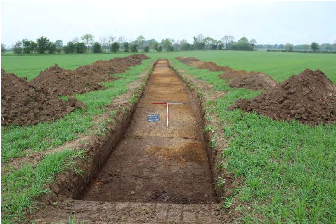
Plate 2.29 Trench 182. Overall shot showing natural stripped surface (18201), looking north-west.