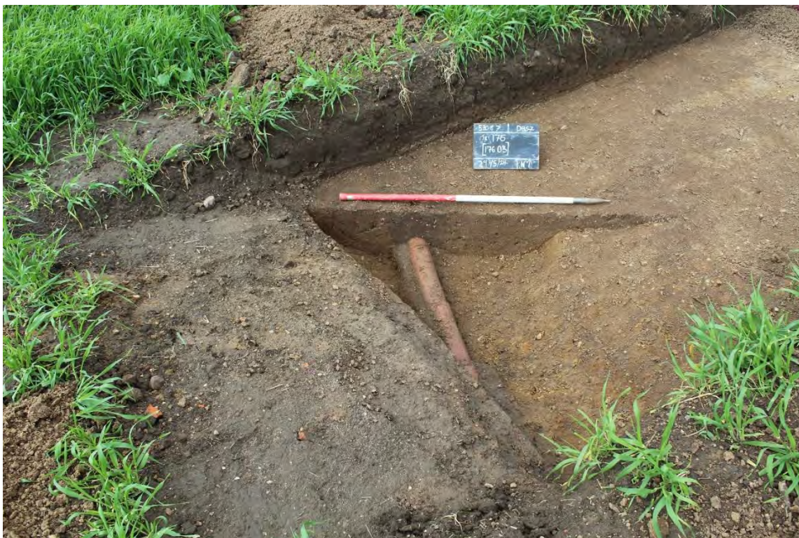
Plate 2.11 Trench 176. Ditch [17603], looking north.