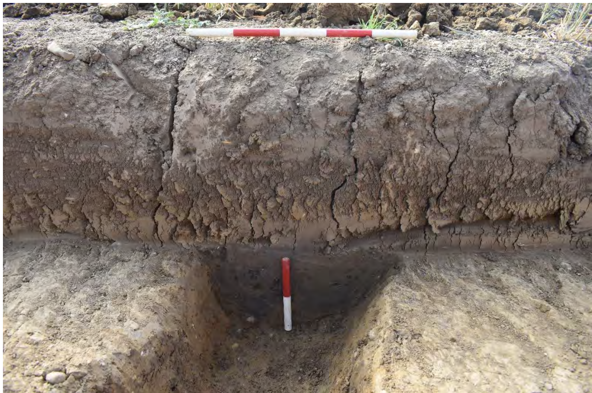
Plate 4.2: Trench 226. Ditch [22604], looking southeast.