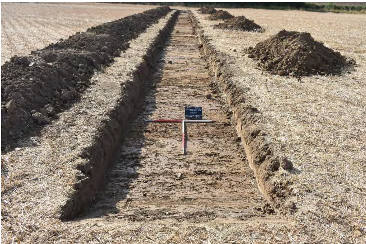
Plate 5.30 Trench 278 pre-excitation. Facing south-east.