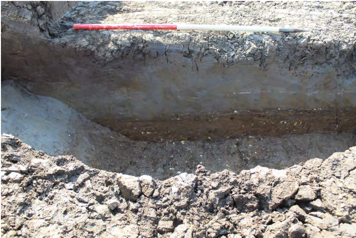
Plate 6.17: Trench 290. Ditch [29013] truncating water lain deposits (29010) and (29012). Sealed by deposit (29011) and subsequently truncated by gully [29006]. Looking west.