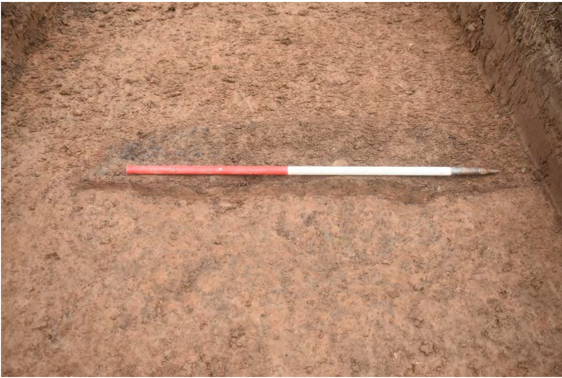
Plate 1.45 Trench 163. Southeast-facing section of pit [16305], looking northwest.