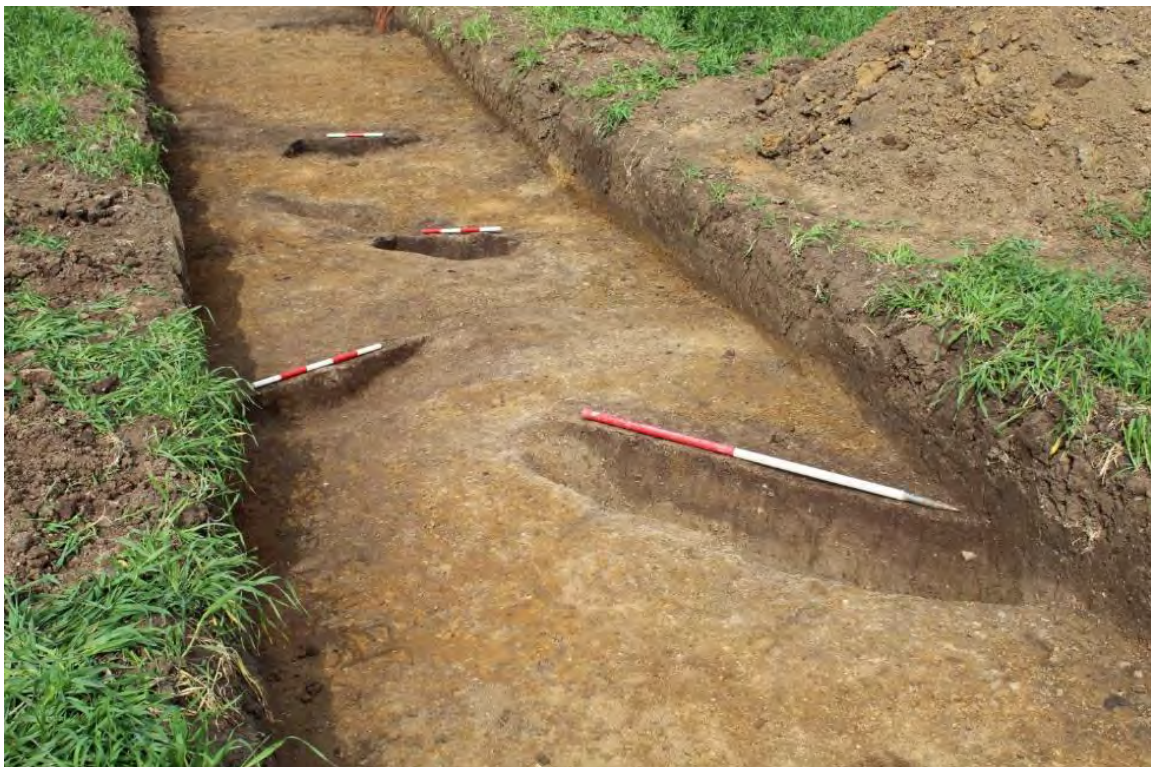
Plate 2.34 Trench 184. Gully terminals and possible pits [18407], [18408], [18409], [18411] and [18428] cutting natural (18402), looking north-east.