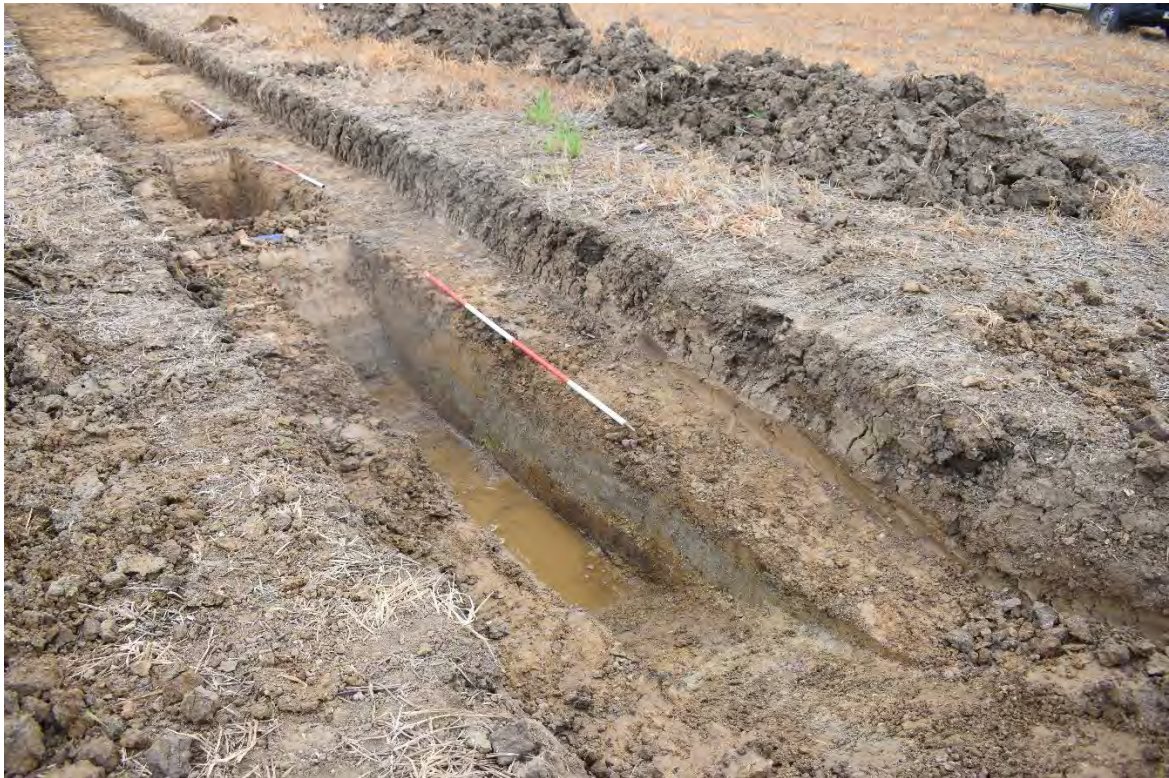
Plate 3.1: Trench 189. Sondages through pond. Looking northwest.