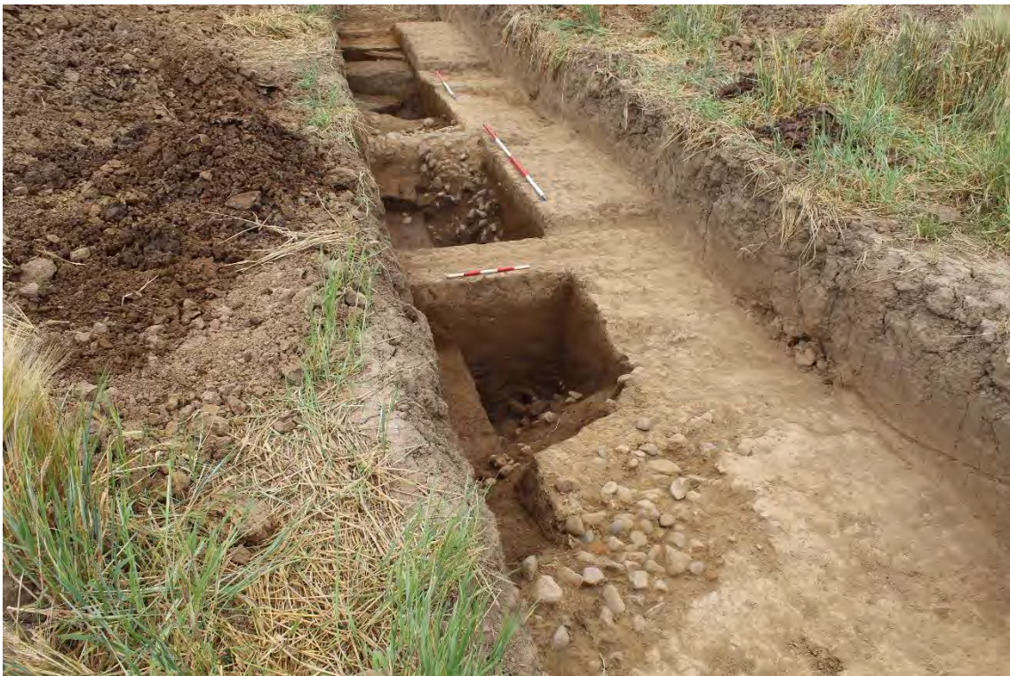
Plate 6.8: Trench 284. Mid-excavation view of watering hole [28405], stone revetment {28407}, and ditch sequence [28406], [28408], and [28443]. Looking northeast.