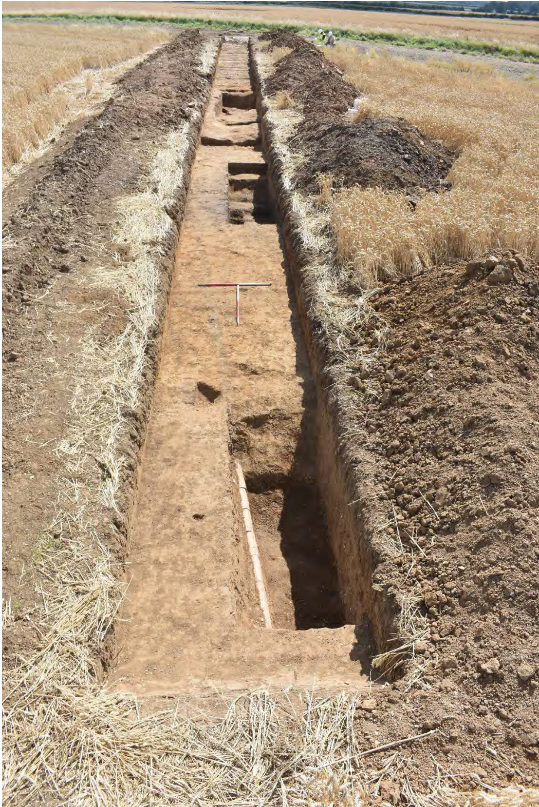
Plate 4.9: Trench 230. Plan shot of trench after excavation of features. Looking southeast.