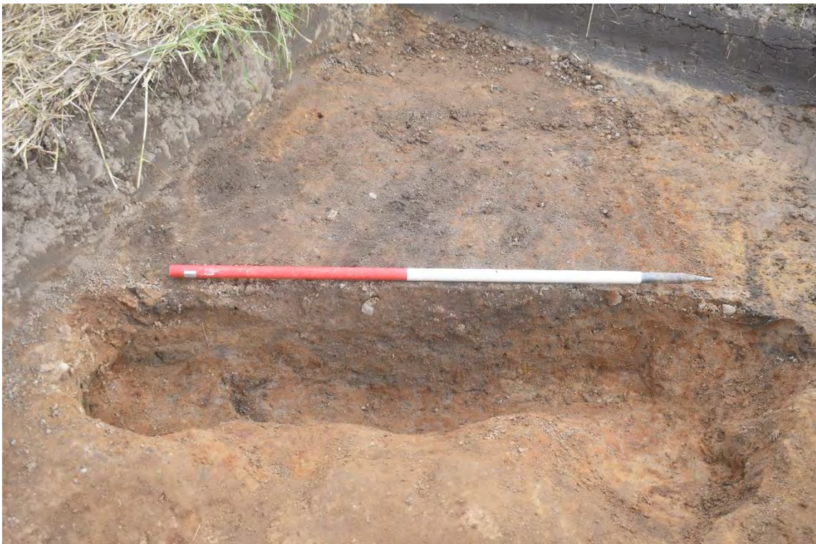
Plate 1.20 Trench 132. Southwest-facing section of pit [13202], looking northeast.