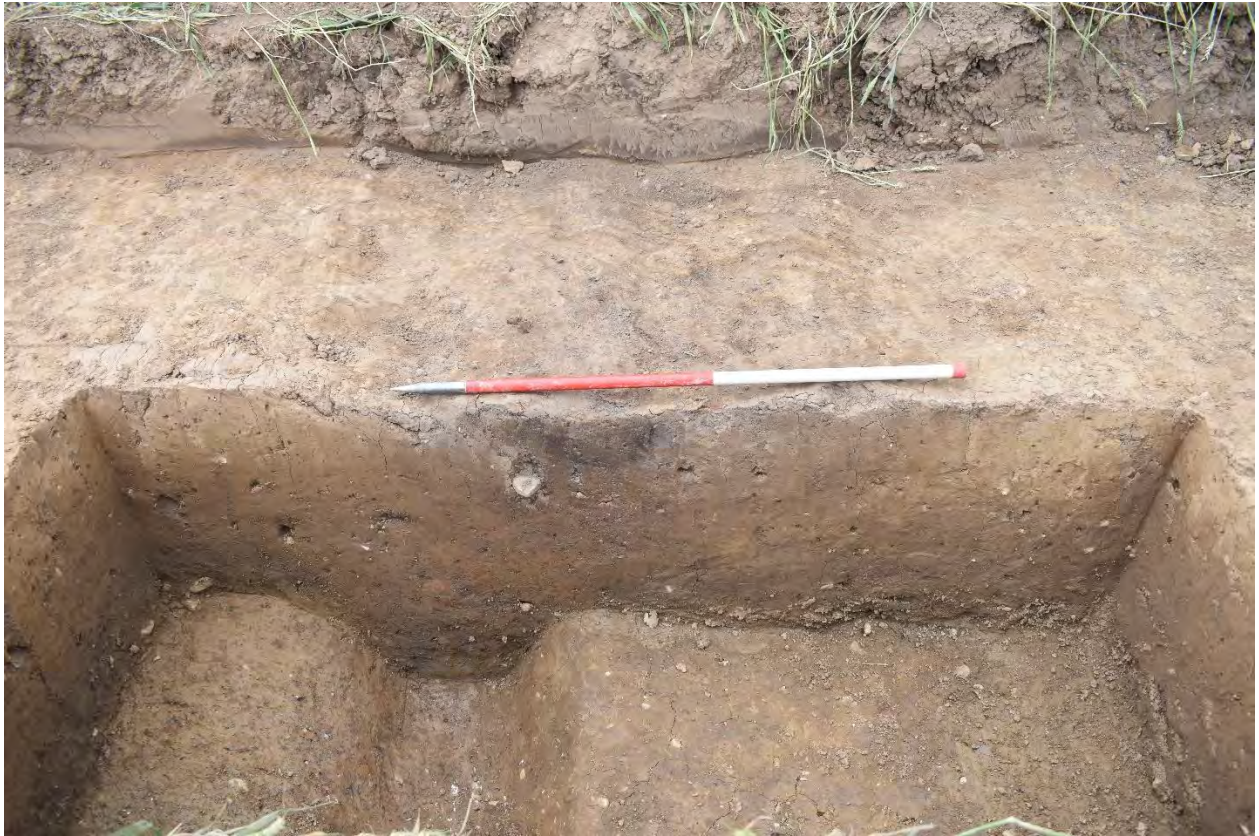
Plate 4.28: Trench 247. Ditch [24702], looking west.