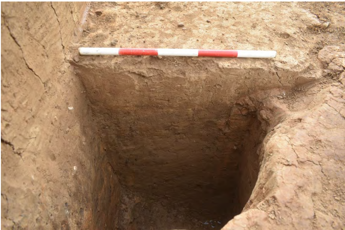
Plate 1.2 Trench 99. West-facing section of possible pit or animal burrow [9908], looking east.