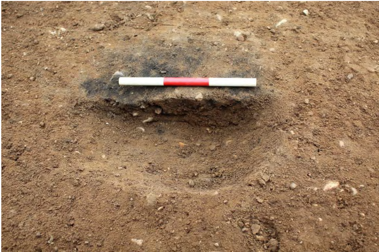
Plate 5.21 Trench 272. Pit [27206], looking west.