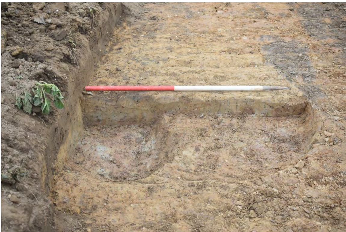
Plate 1.33 Trench 154. East-facing section of pit [15403], looking west.