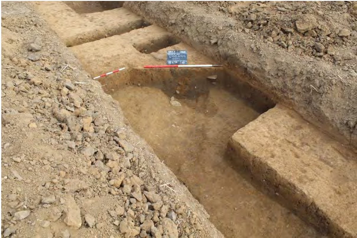
Plate 5.27 Trench 275. Gully [27505], ditch [27509] and furrow [27510]. Looking northeast.