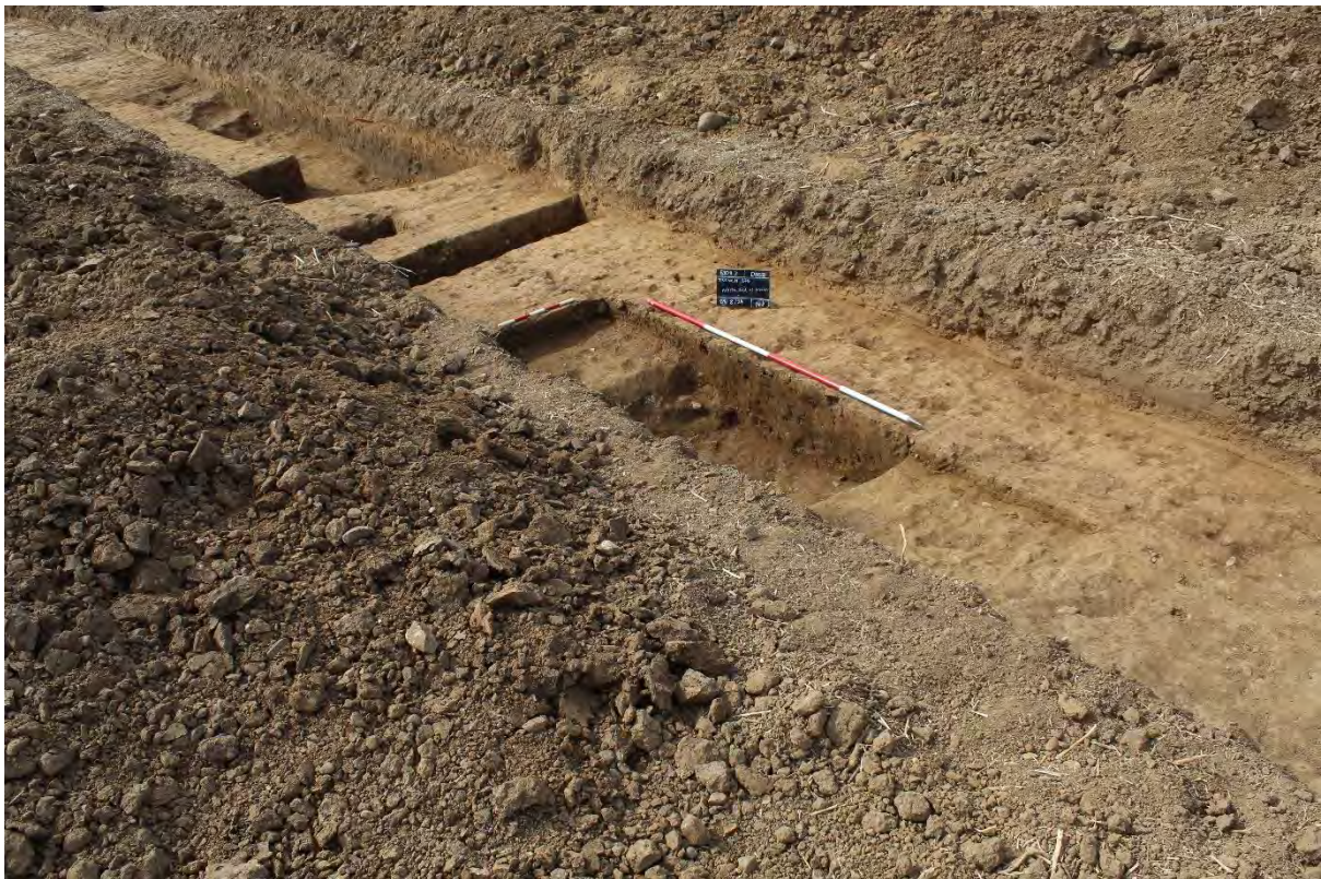
Plate 5.28 Trench 275. Area view of gullies [27506 – 27508]. Looking south.