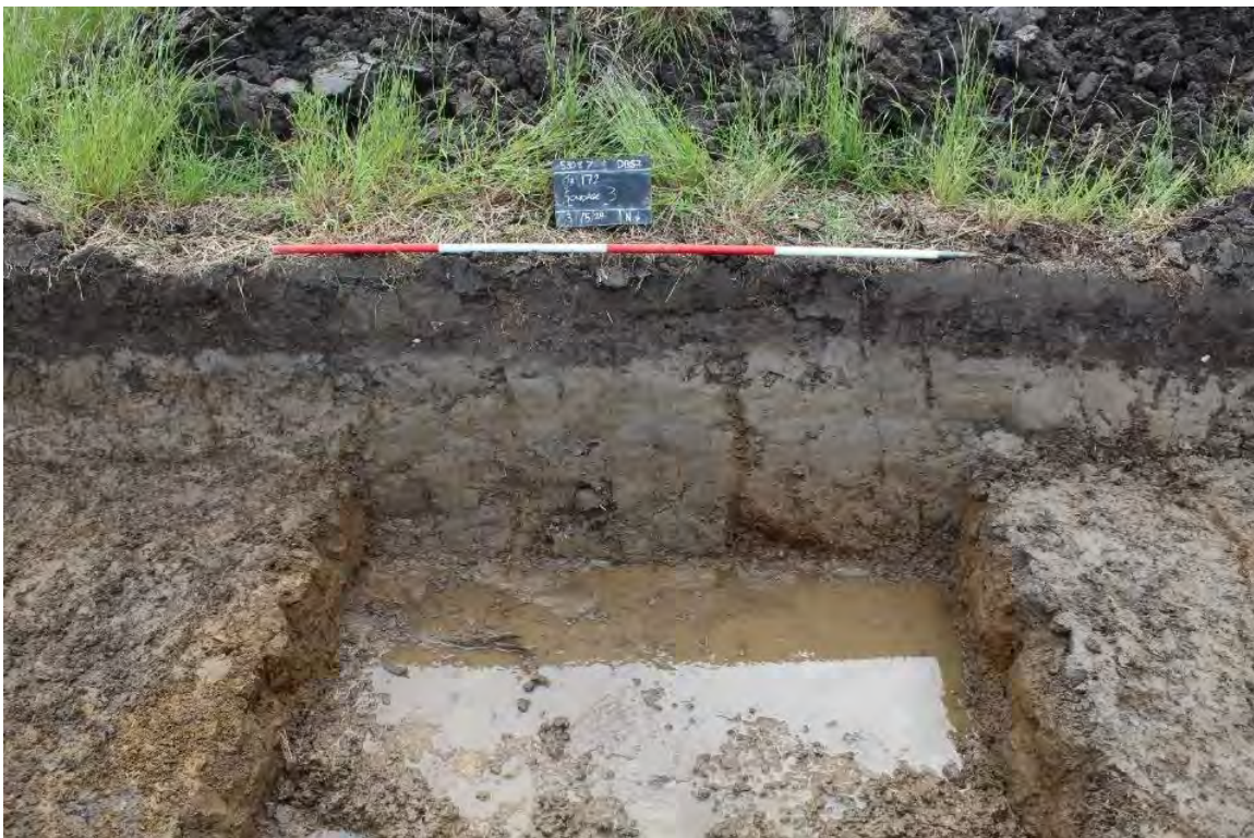
Plate 2.2 Trench 172. Sondage showing alluvial deposits (17208), (17204/7), (17203/6), (17205), subsoil (17201) and topsoil (17200), looking south.