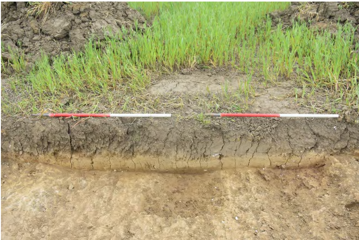
Plate 1.10 Trench 107. South-facing section of medieval furrow [10707], looking north.