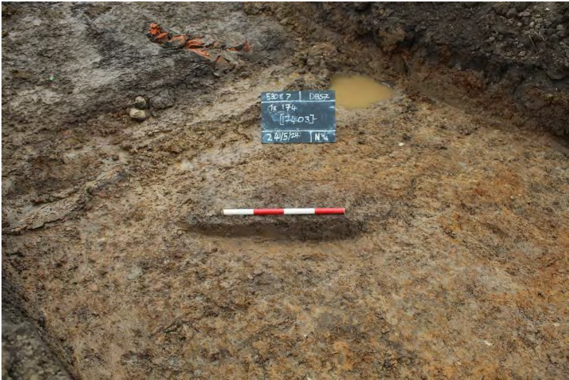
Plate 2.7 Trench 174. Pit [17403] cutting natural deposit (17402), looking south-west.