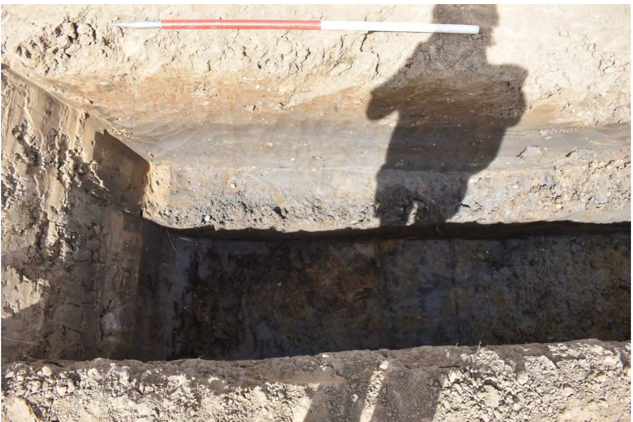
Plate 4.6: Trench 228. Sondage through alluvial deposit sequence. Looking northwest.