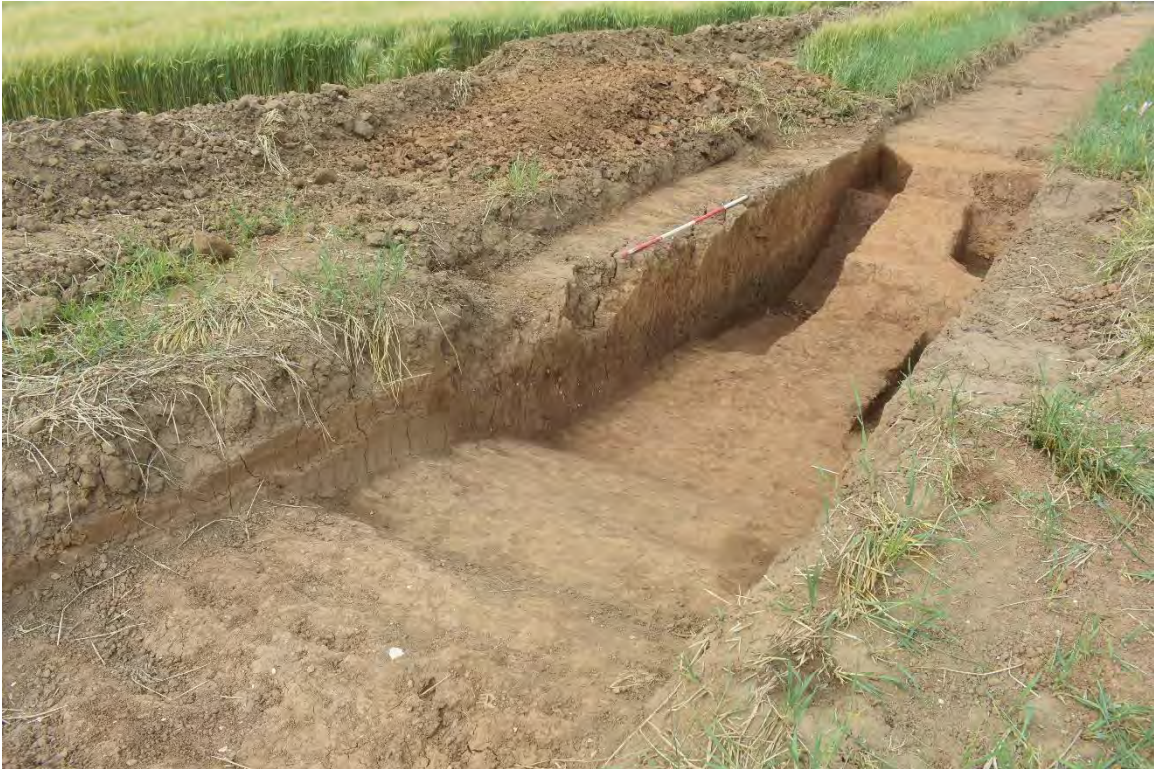
Plate 1.37 Trench 158. Southeast-facing section of hollow [15803] and modern haul road [15807], looking northwest.