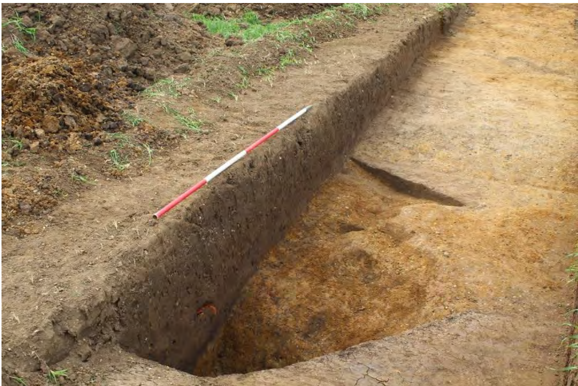
Plate 2.30 Trench 182. Ditch [18205] and furrow [18214] cutting natural (18202), looking south-west.