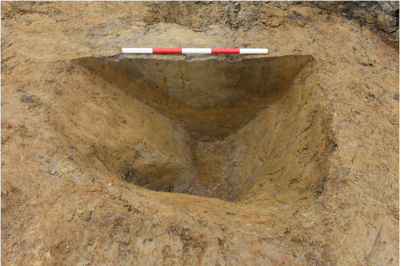
Plate 3.13: Trench 196. Pit [19618]. Looking west.