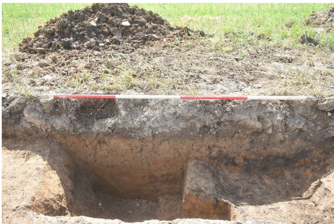
Plate 1.22 Trench 134. Northwest-facing section of ditch [13402] truncated by tree bowl [13406], looking southeast.