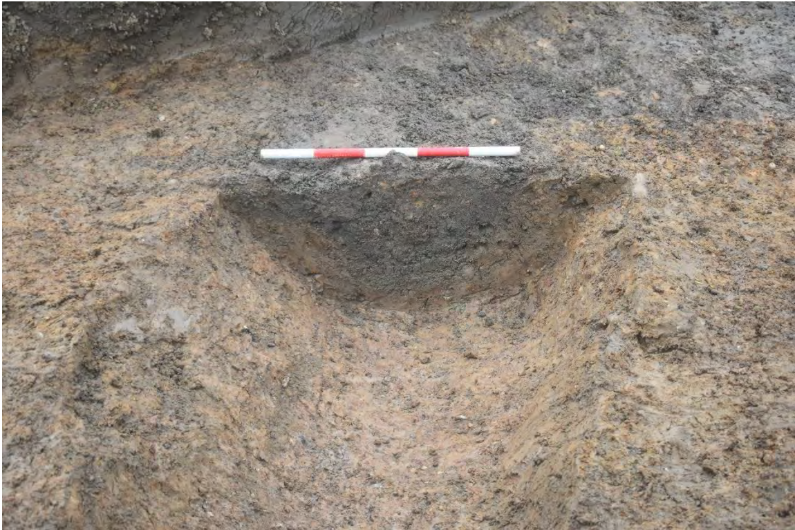
Plate 1.17 Trench 123. Southeast-facing section of modern ditch [12303], looking northwest.