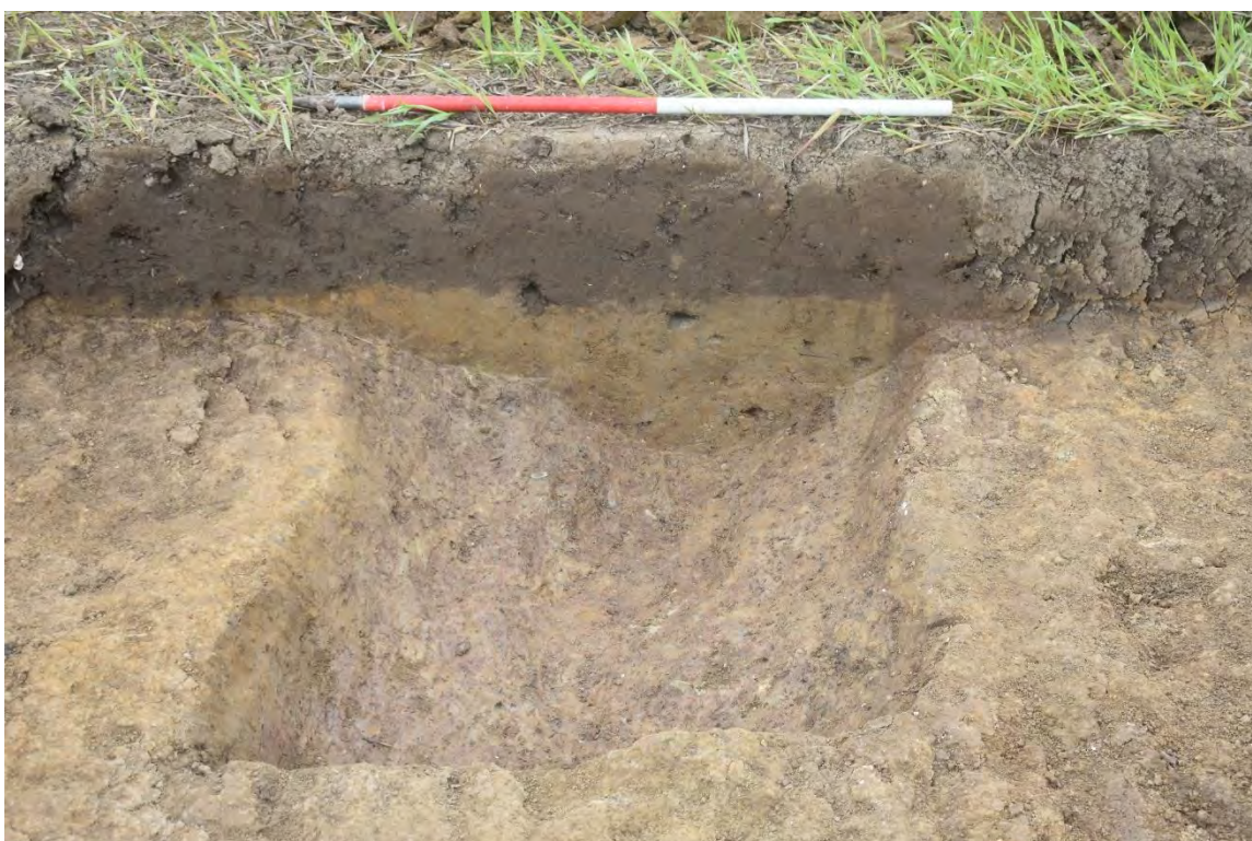
Plate 1.8 Trench 107. Northeast-facing section of natural hollow [10703], looking southwest.