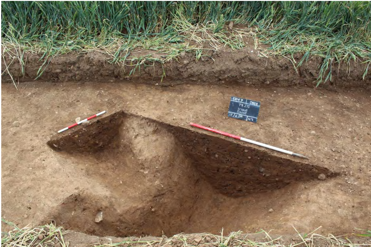
Plate 5.19 Trench 270. Ditches [27003] and [27005], looking southwest