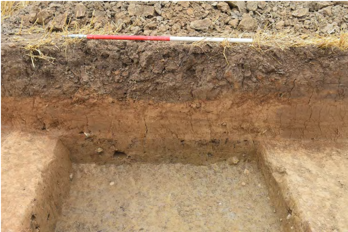
Plate 6.5: Trench 312. Sterile blue-grey water lain deposits accumulated in a natural hollow in the landscape. Looking northwest.