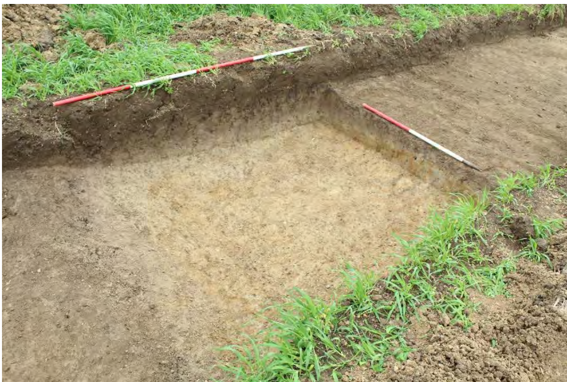
Plate 2.36 Trench 184. Natural silted up hollow [18424], looking south.