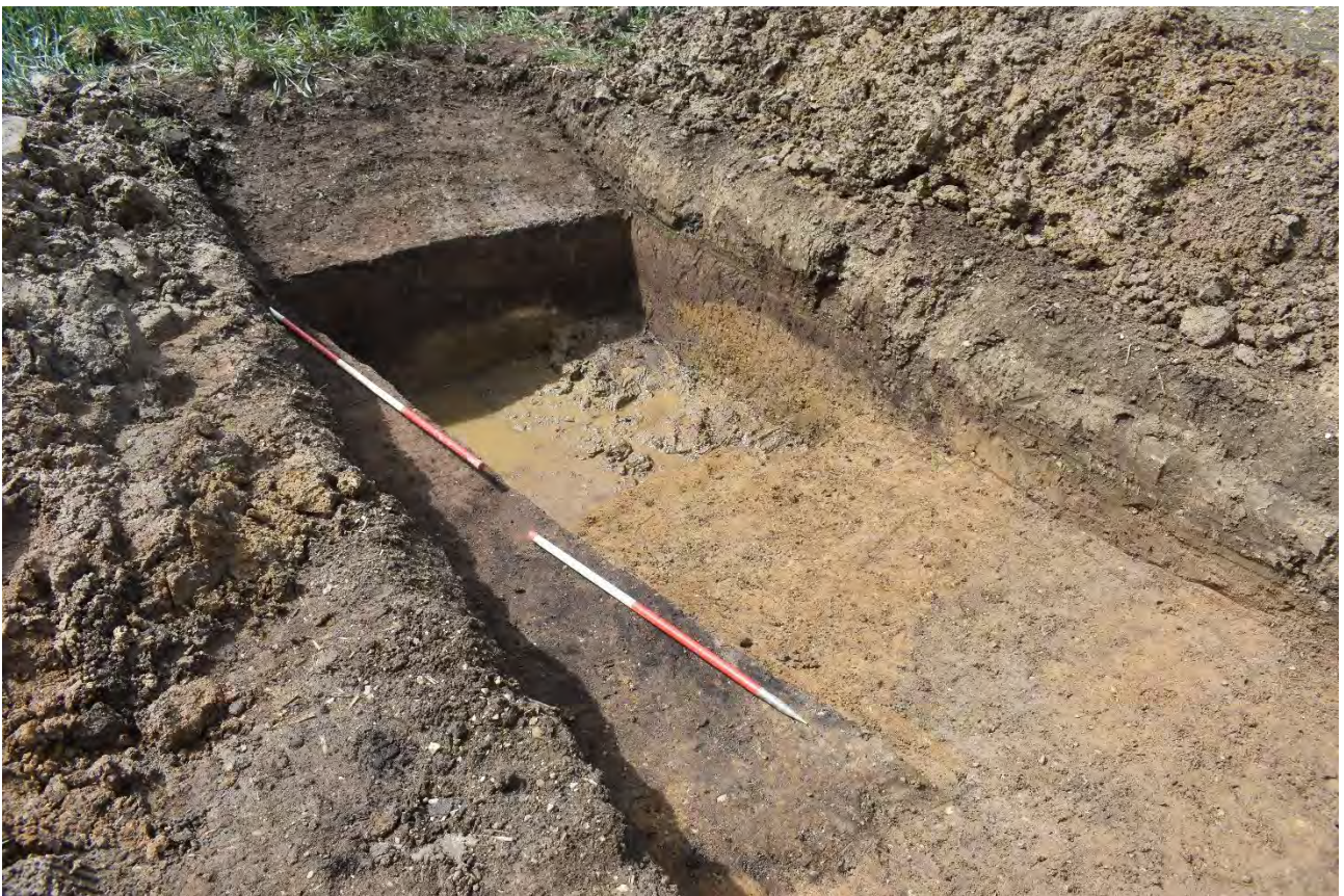
Plate 3.30: Trench 210. Drainage ditch [21009]. Looking northwest.