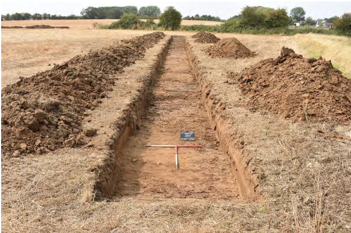
Plate 5.34 Trench 281. Trench view, facing west