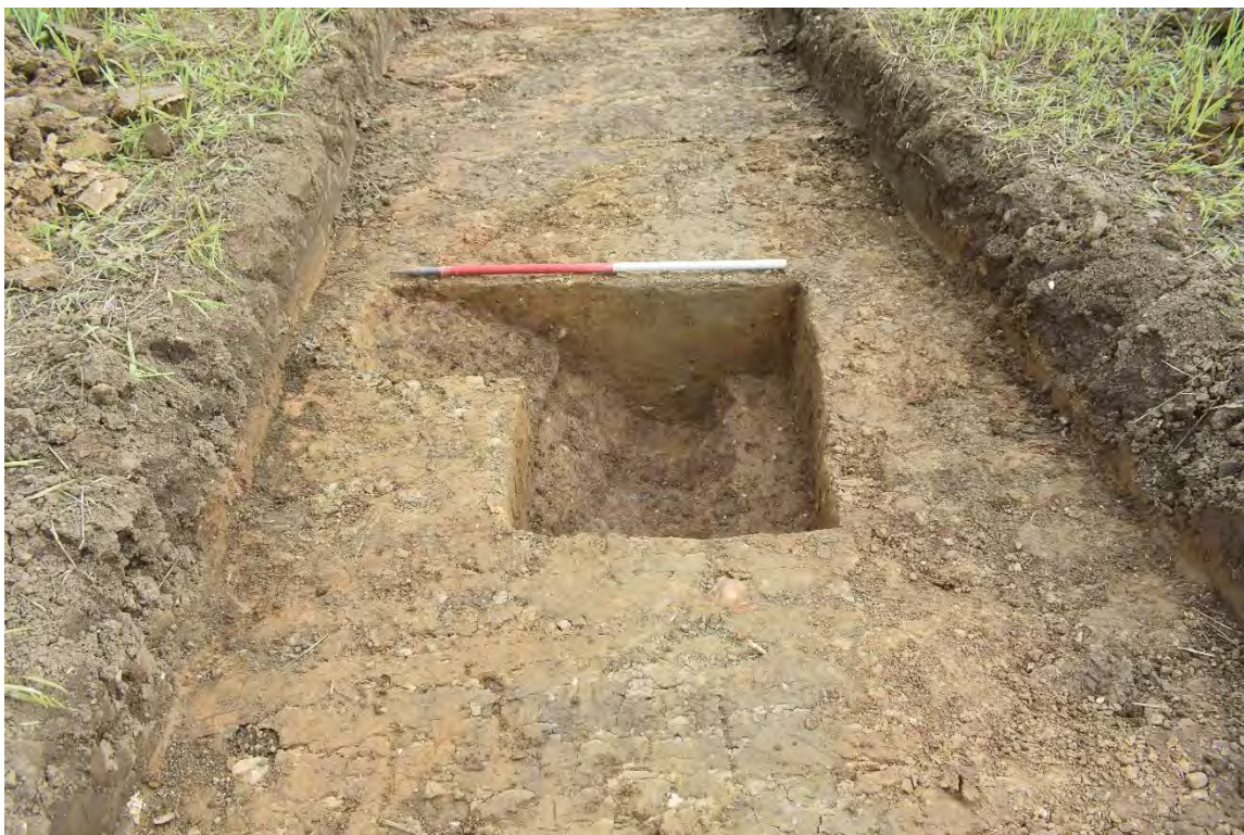
Plate 1.5 Trench 104. Northwest-facing section of gully [10403], looking southwest.