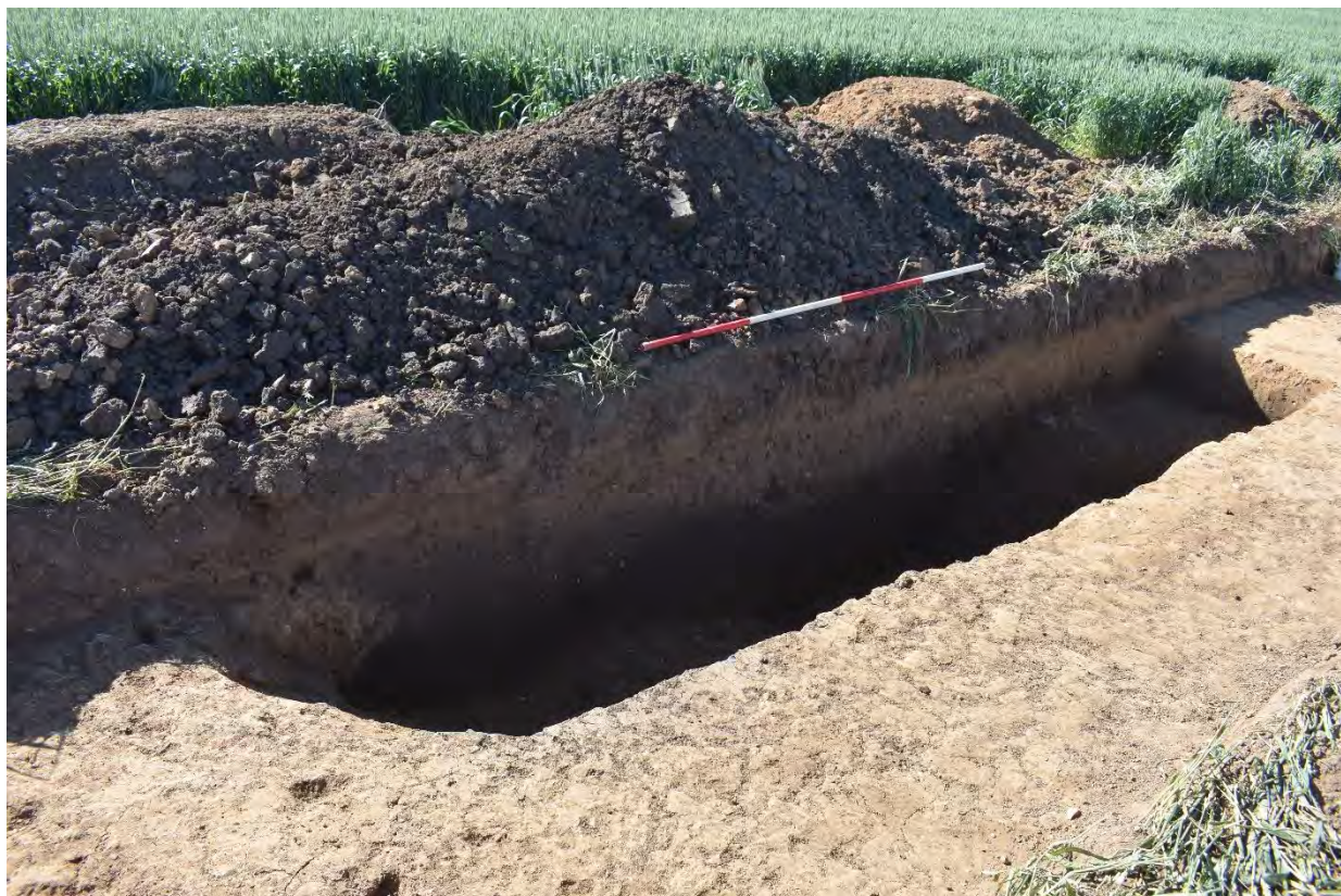
Plate 4.30: Trench 248. Oblique view of ditches [24802] and [24805], looking southeast.