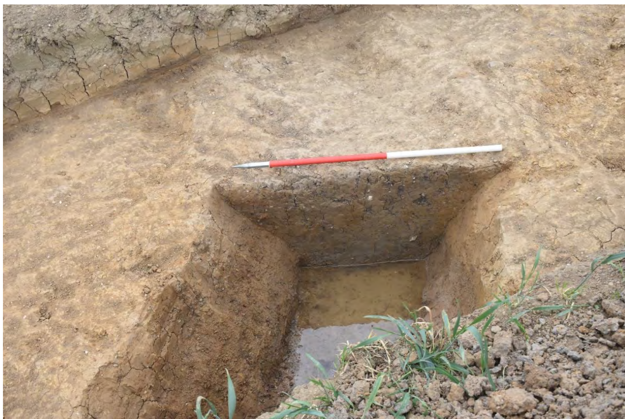
Plate 3.37: Trench 217. Ditch [21703]. Looking southwest.