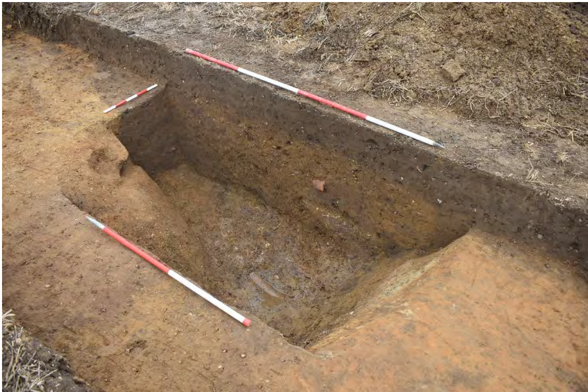
Plate 3.2: Trench 189. Ditch [18923] and [18924]. Looking north.