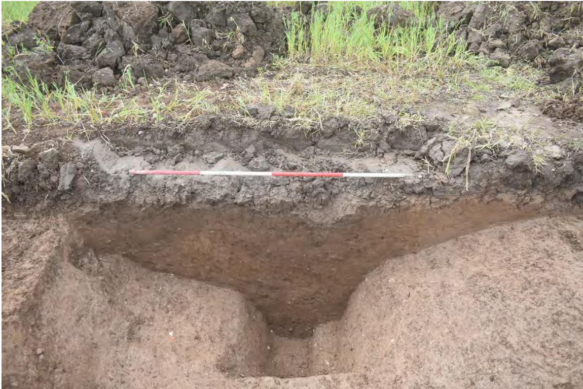
Plate 1.1 Trench 99. North-facing section of ditch [9905] with recut [9910], looking south.