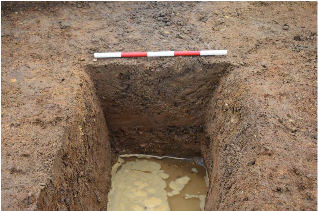
Plate 3.28: Trench 210. Gully [21003]. Looking south.