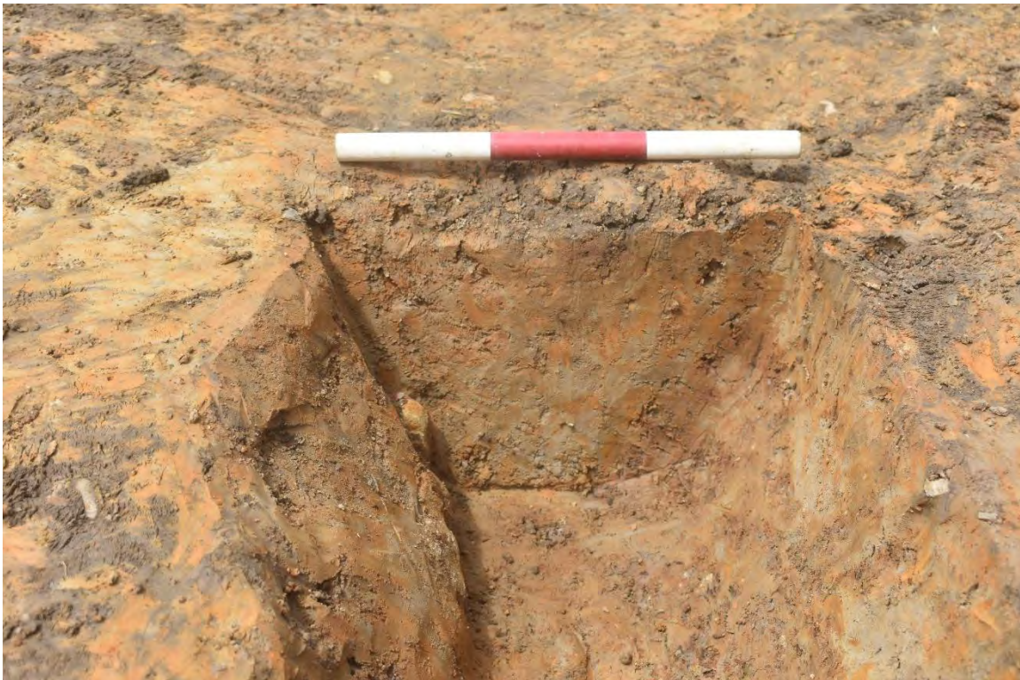
Plate 1.18 Trench 128. Southeast-facing section of gully [12802], looking northwest.