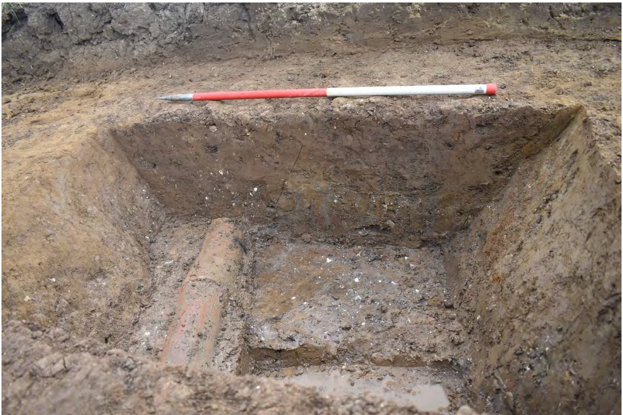
Plate 3.32: Trench 215. Ditch [21502]. Looking east.