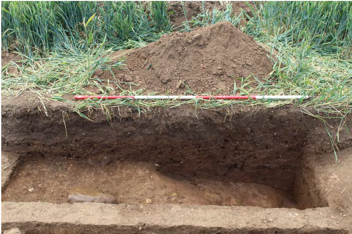
Plate 5.16 Trench 269. East-facing section of ditch [26932] sealed by deposit (26940).