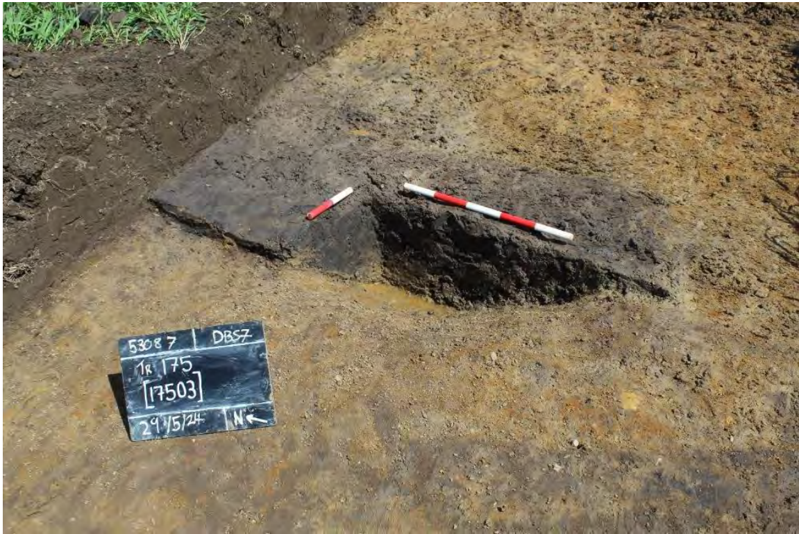
Plate 2.9 Trench 175. Ditch terminal [17503] cutting natural sandy clay (17501), looking east.