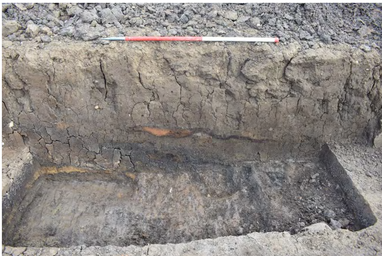
Plate 4.4: Trench 227. Section showing deposit sequence at east end with burnt deposits (22711) and (22712). Looking north.