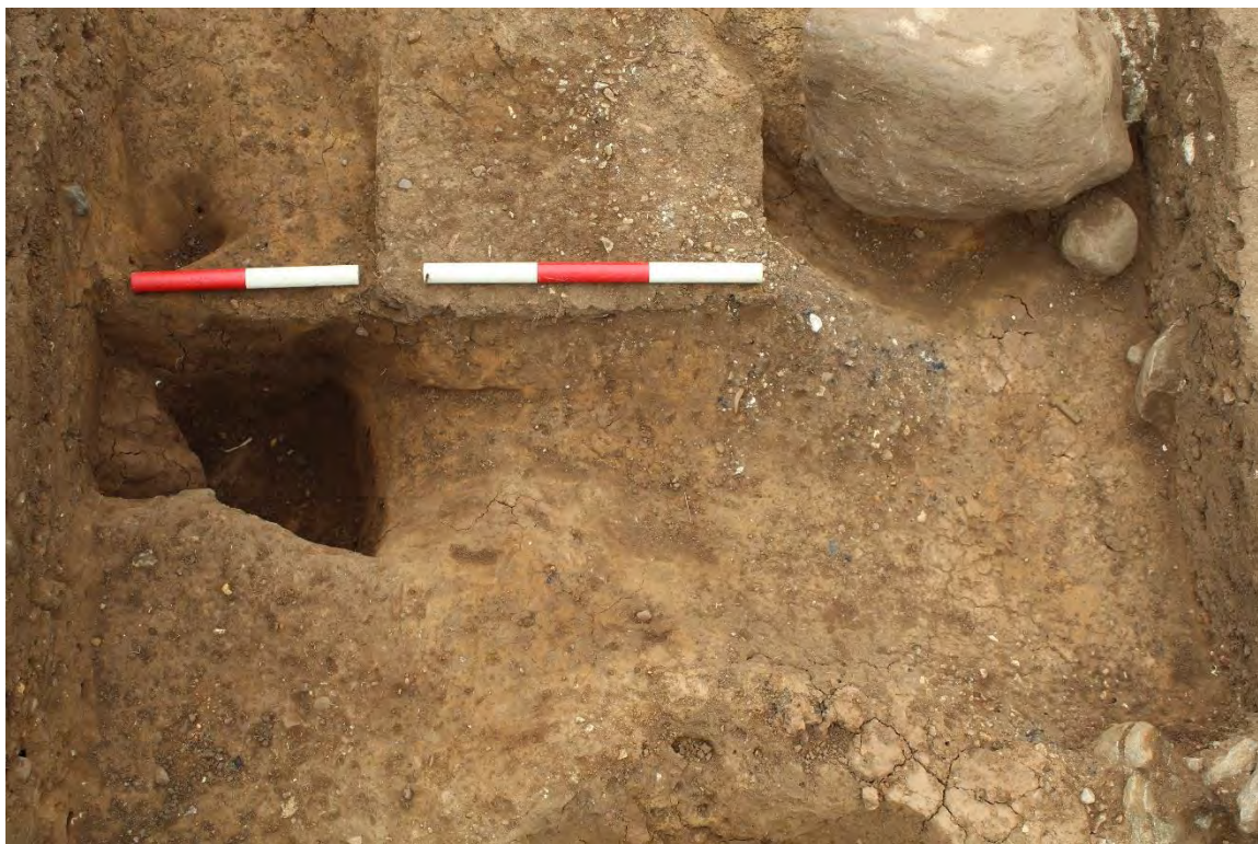
Plate 5.13 Trench 269. Intercutting posthole [26928] and gully [26930].