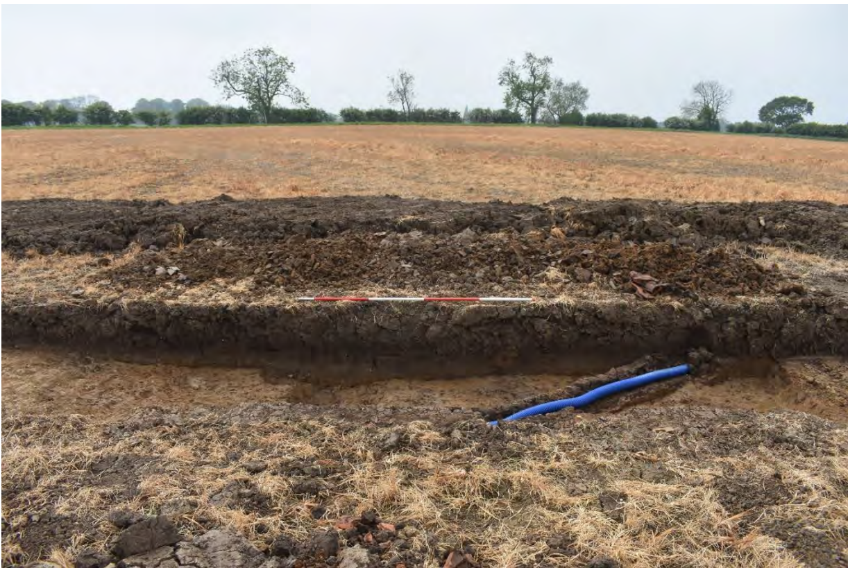
Plate 3.18: Trench 200. Waterlogged spread (20002). Looking southwest.