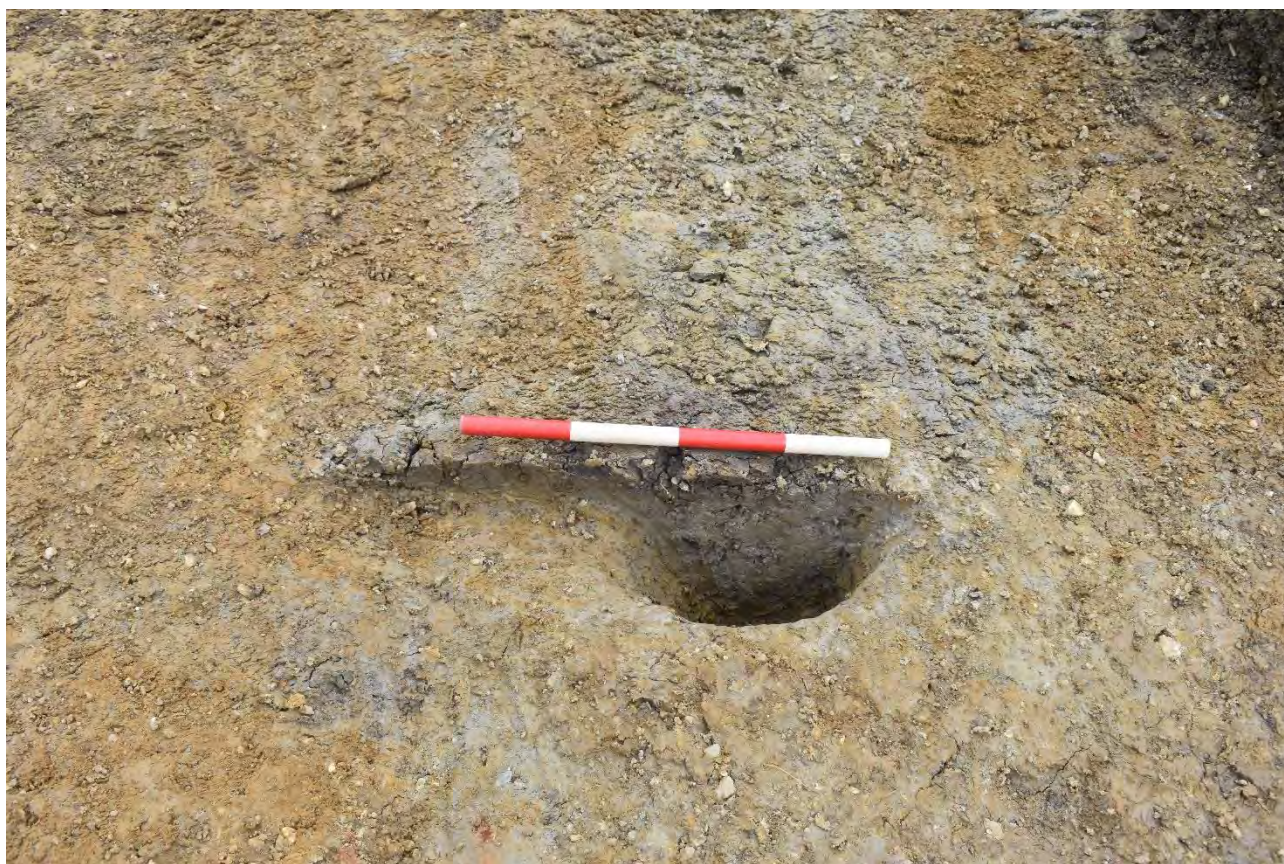
Plate 3.48: Trench 220. Pit [22005]. Looking east.