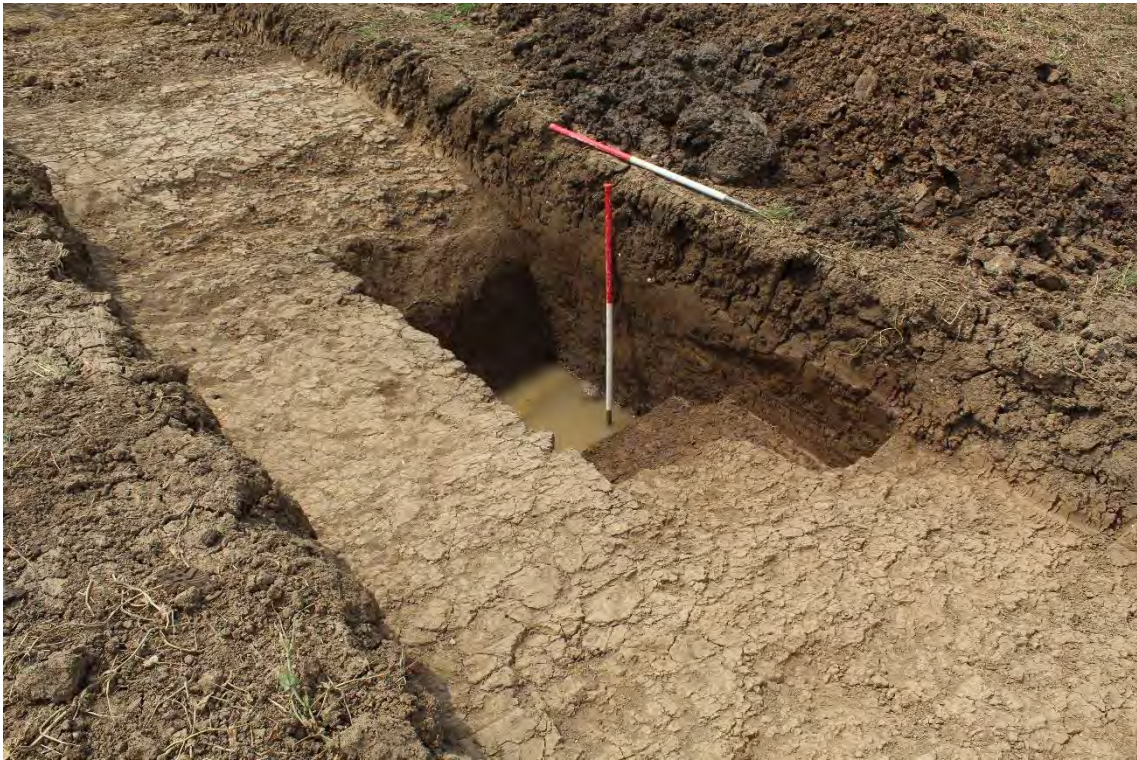
Plate 6.23: Trench 301. Field boundary [30106] truncated by modern field drain [30115]. Looking southwest.