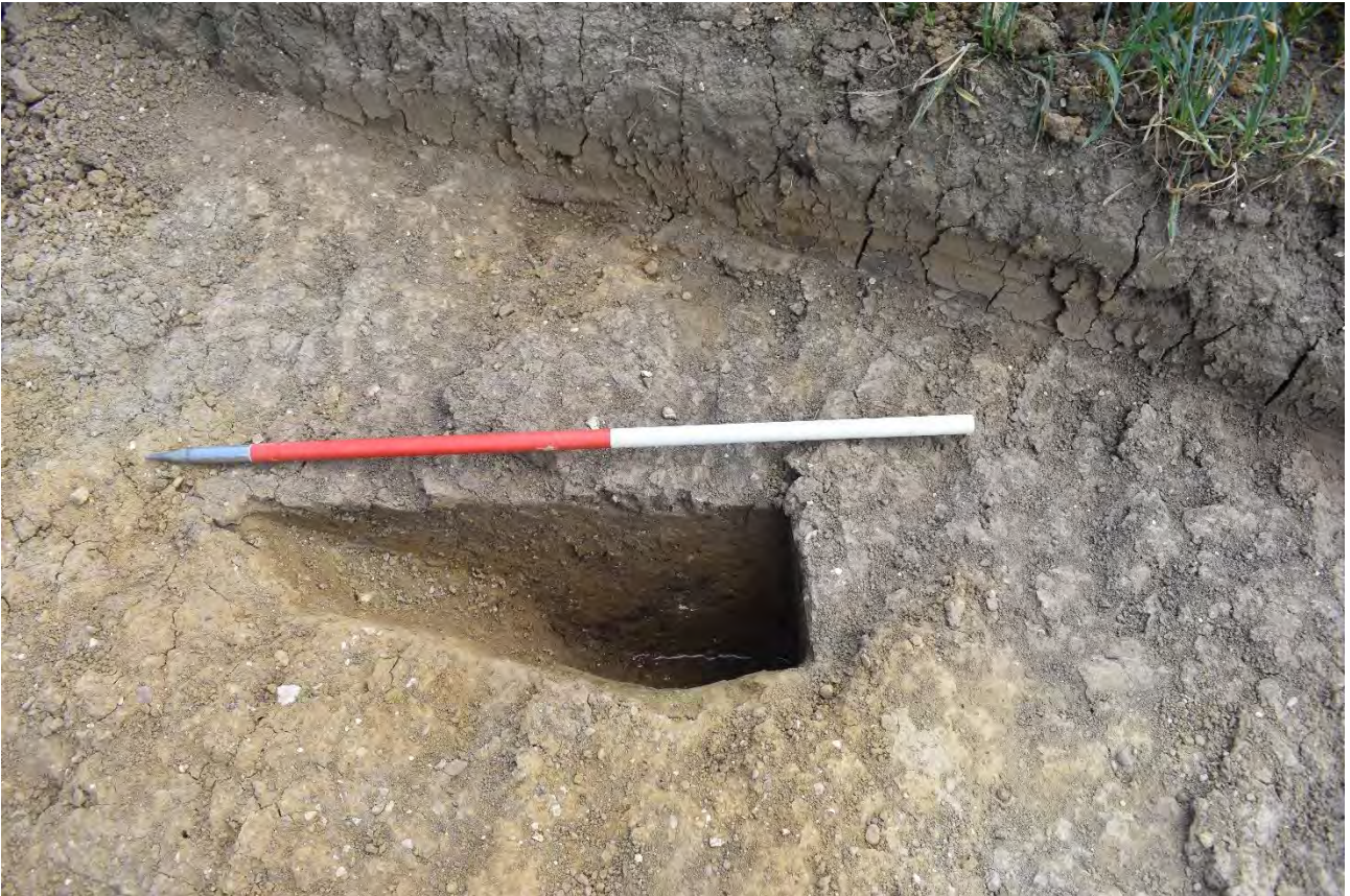
Plate 3.41: Trench 219. Terminus [21902]. Looking southeast