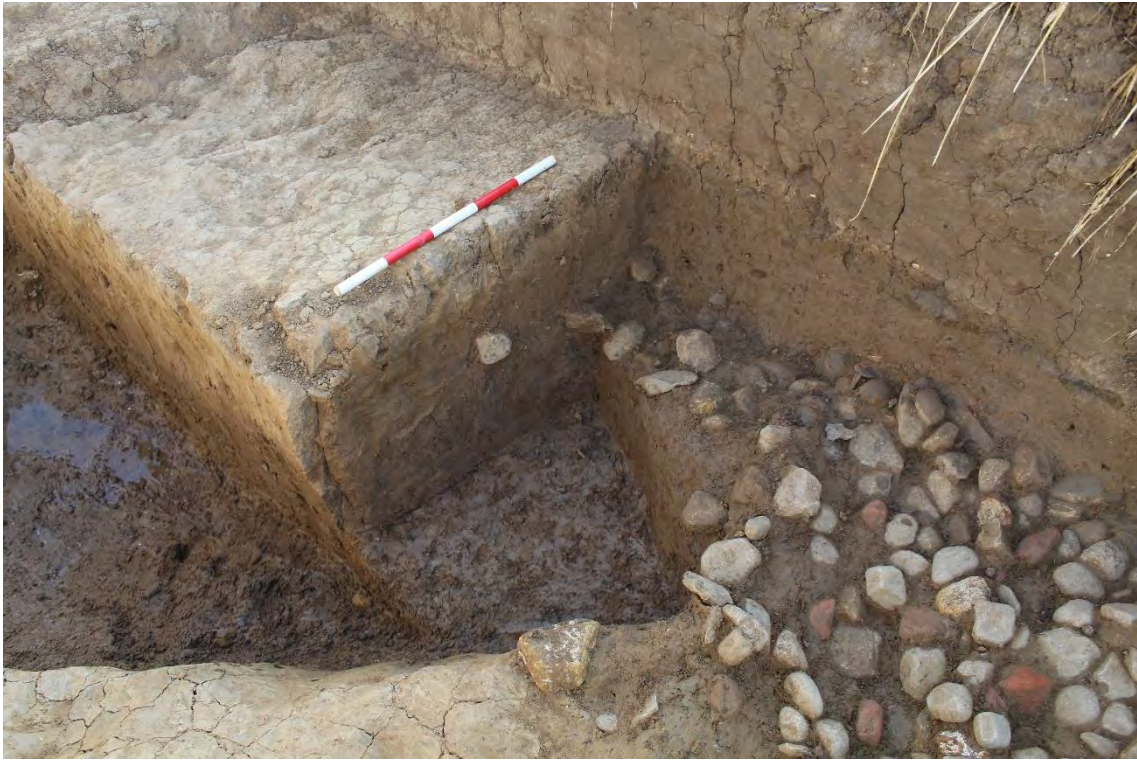
Plate 6.13: Trench 284. Detailed view of stone revetment {28407} truncated by second ditch recut [28408]. Looking East.