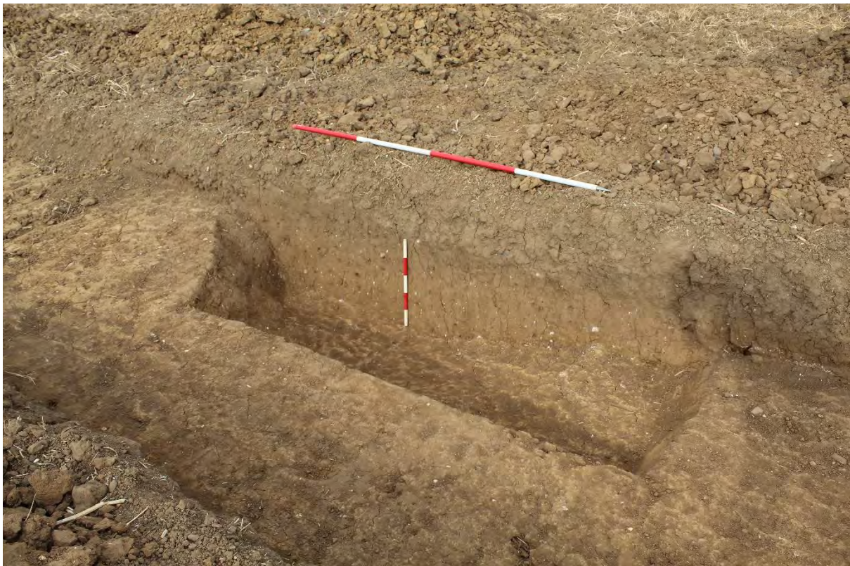
Plate 5.24 Trench 274. Ditch [27403], facing southwest.