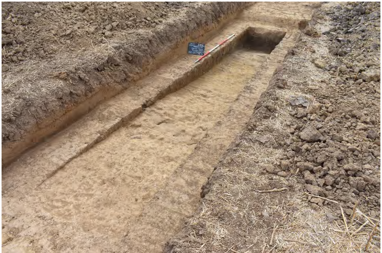
Plate 5.32 Trench 279. Section through hillwash and alluvial deposits (27902, 27903, 27906, 27907). Facing south-west.