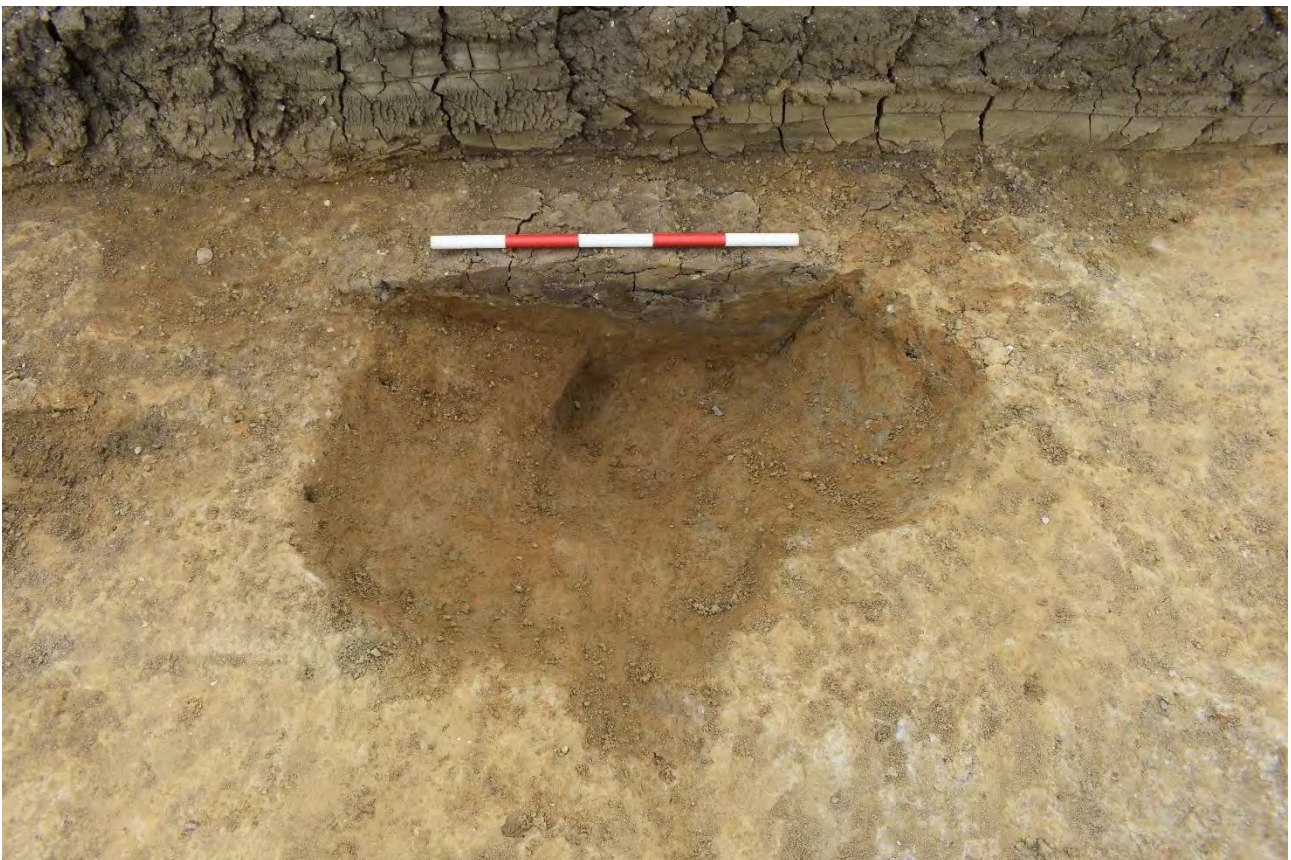
Plate 3.34: Trench 215. Pit [21514]. Looking northwest.