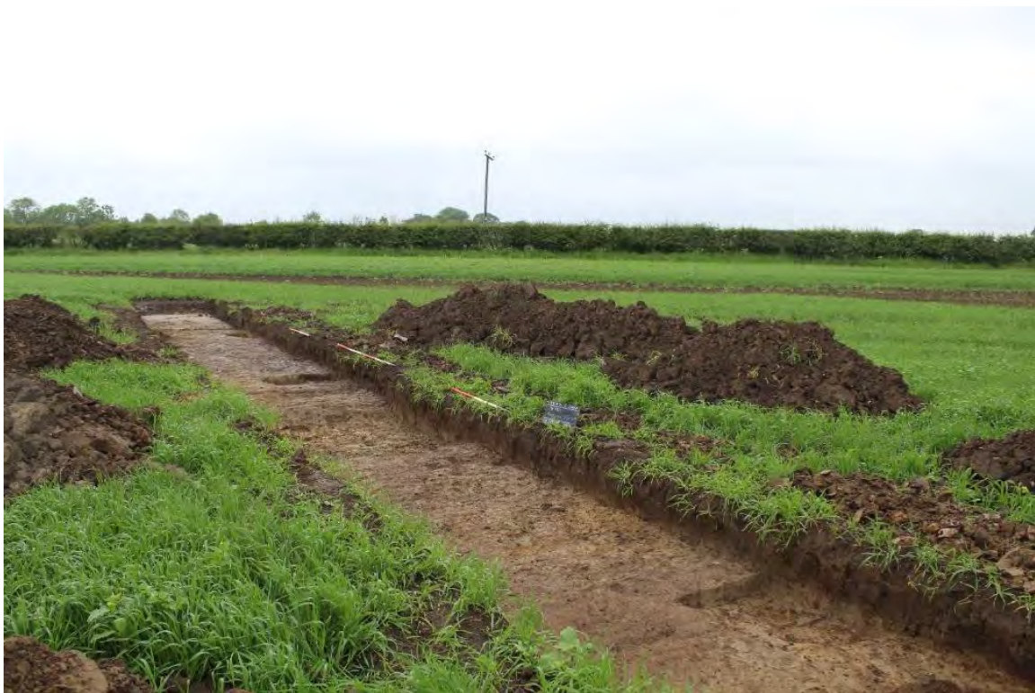
Plate 2.24 Trench 180. Silting up deposit (18005) within natural hollow, looking north-east.