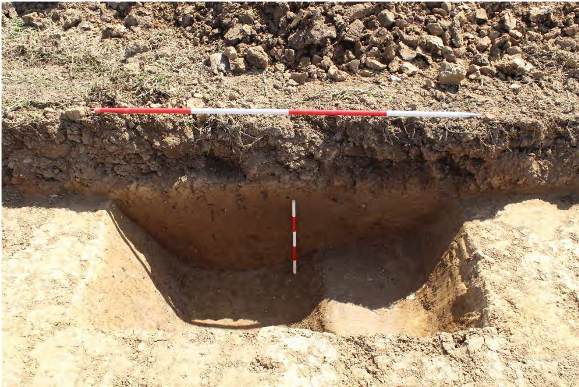
Plate 6.25: Trench 302. Field Boundary ditch [30204] with two recuts [30203] and [30221]. Looking south.