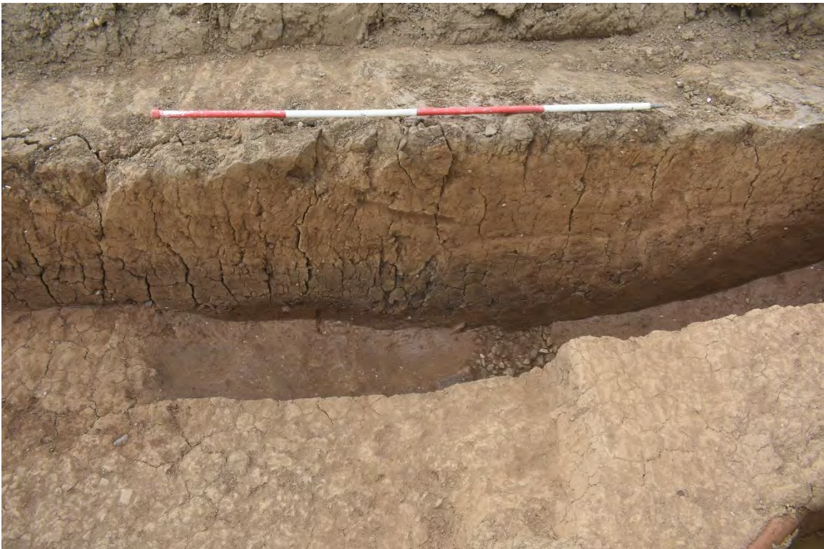
Plate 1.38 Trench 158. Close up of southeast-facing hollow [15803] with line of subrounded stones (15818) as well as modern haul road [15807], looking northwest.