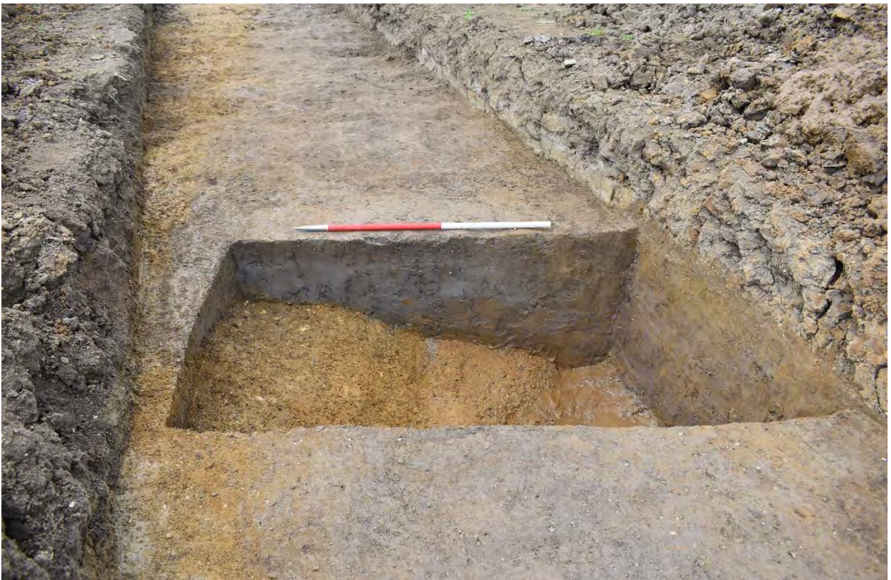
Plate 3.50: Trench 221. Group 3- Ditch [22103]. Looking west.