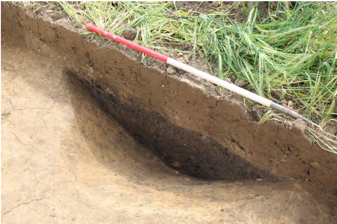
Plate 6.14: Trench 286. Refuse pit [28605] with charcoal-rich fill. Looking south.