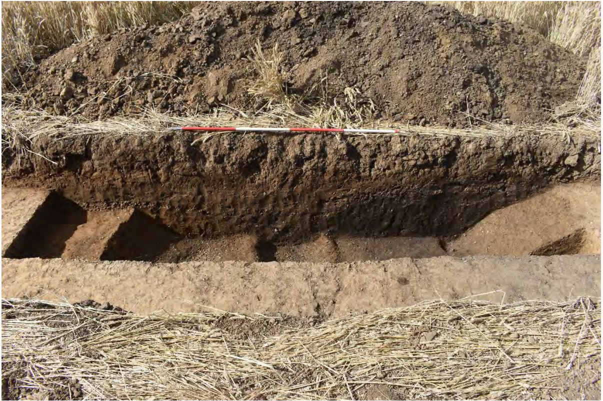
Plate 4.10: Trench 230. Section of ditch sequence [23010]/[[23006]/[23036], [23008], [23007] and [23011] with broad truncation cut [23009]. Looking southwest.