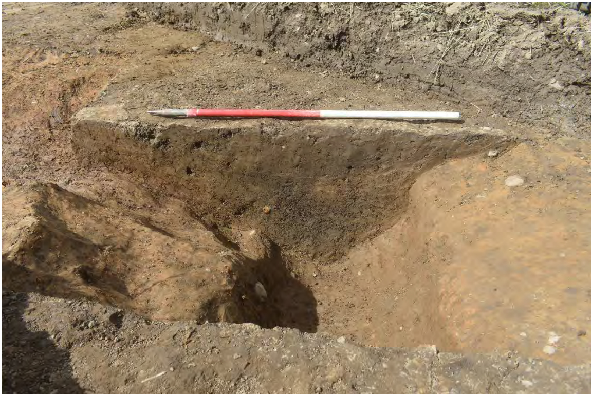
Plate 1.12 Trench 113. Southwest facing section of modern boundary ditch [11306] with recuts [11308] and [11310], looking northeast.