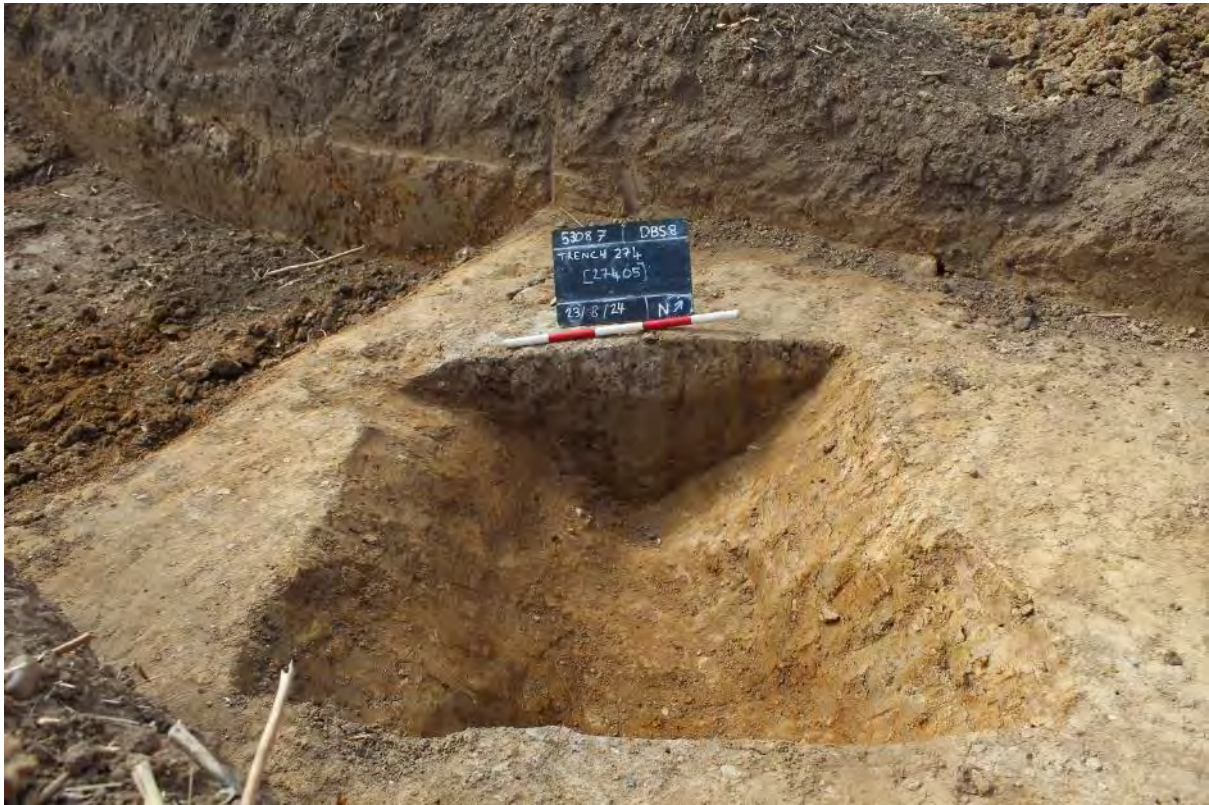
Plate 5.23 Trench 274. Ditch [27405], looking northwest