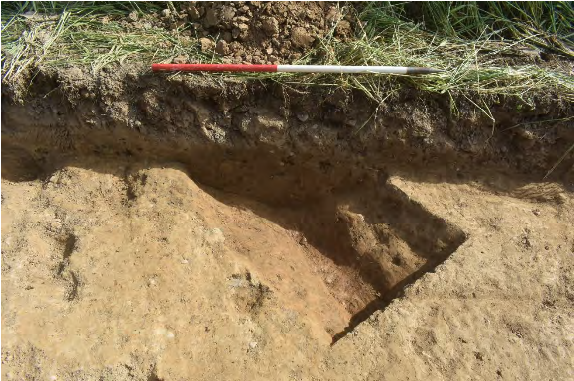
Plate 1.48 Trench 165. South-facing section of gully [16504], looking north.