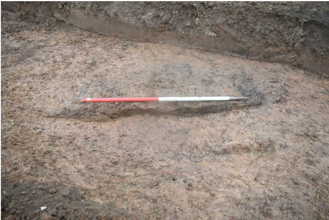
Plate 1.46 Trench 163. South-facing section of pit [16307], looking north.