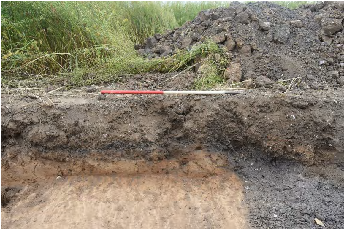
Plate 1.50 Trench 170. North-facing section of trench 170, showing modern pit [17003], looking south.