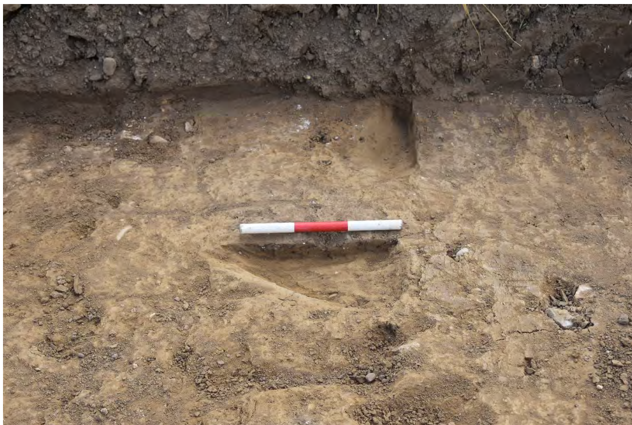
Plate 4.34: Trench 250. Pit [25004], looking northeast.