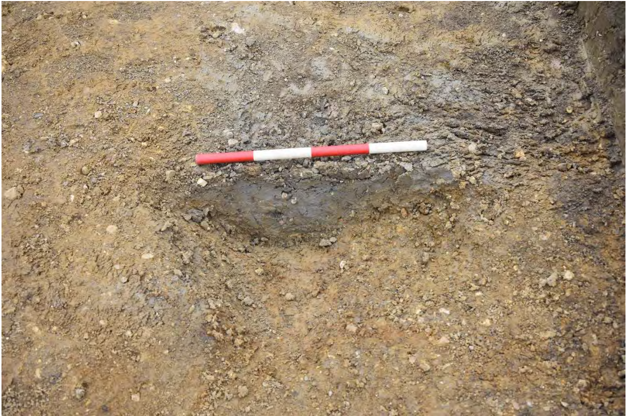
Plate 3.43: Trench 219. Pit [21918]. Looking east.