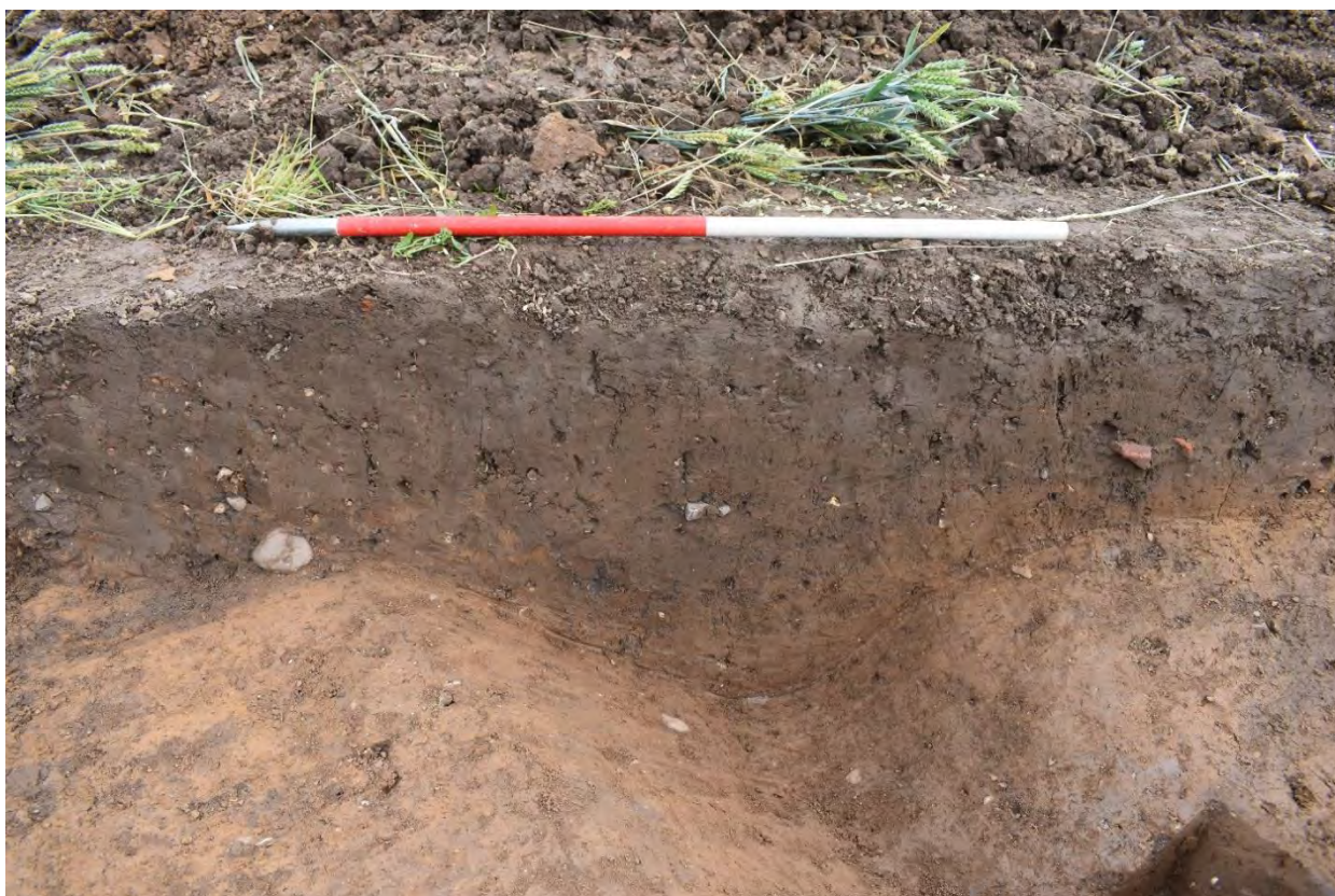
Plate 4.25: Trench 235. Ditch [23503], looking east.