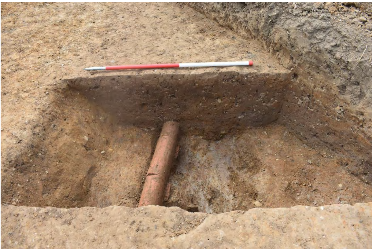
Plate 3.4: Trench 191. Ditch [19103] and [19104]. Looking southwest.