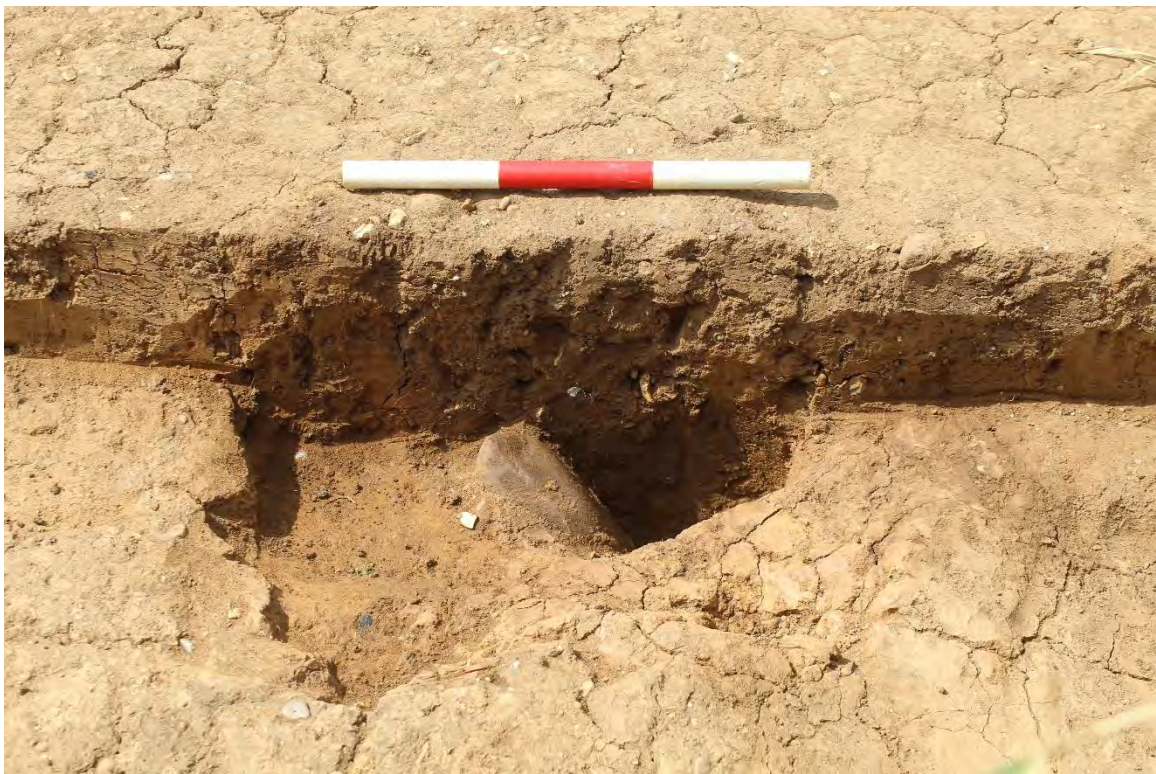
Plate 5.10 Trench 269. East-facing section of posthole [26938].