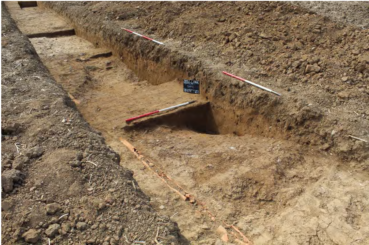
Plate 5.29 Trench 275, Pit [27503]. Facing north-east.