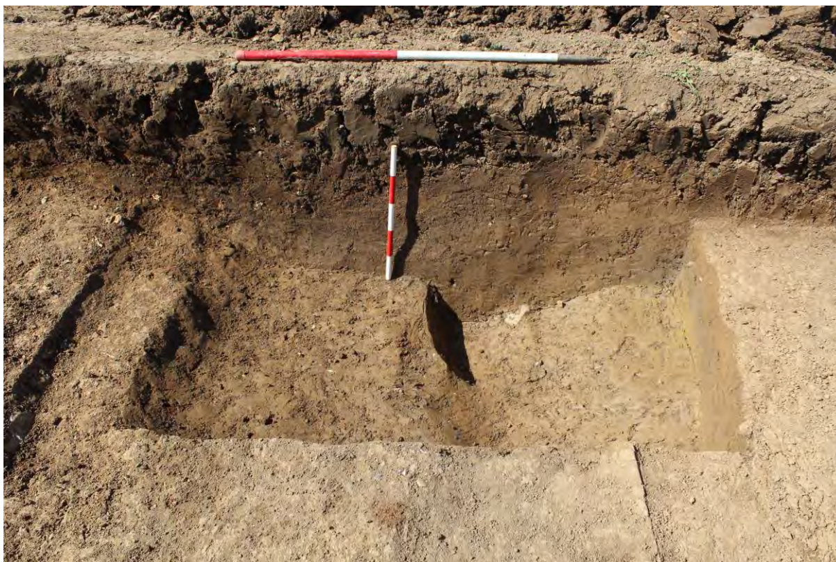
Plate 5.36 Trench 283. Ditch [28303], looking north.