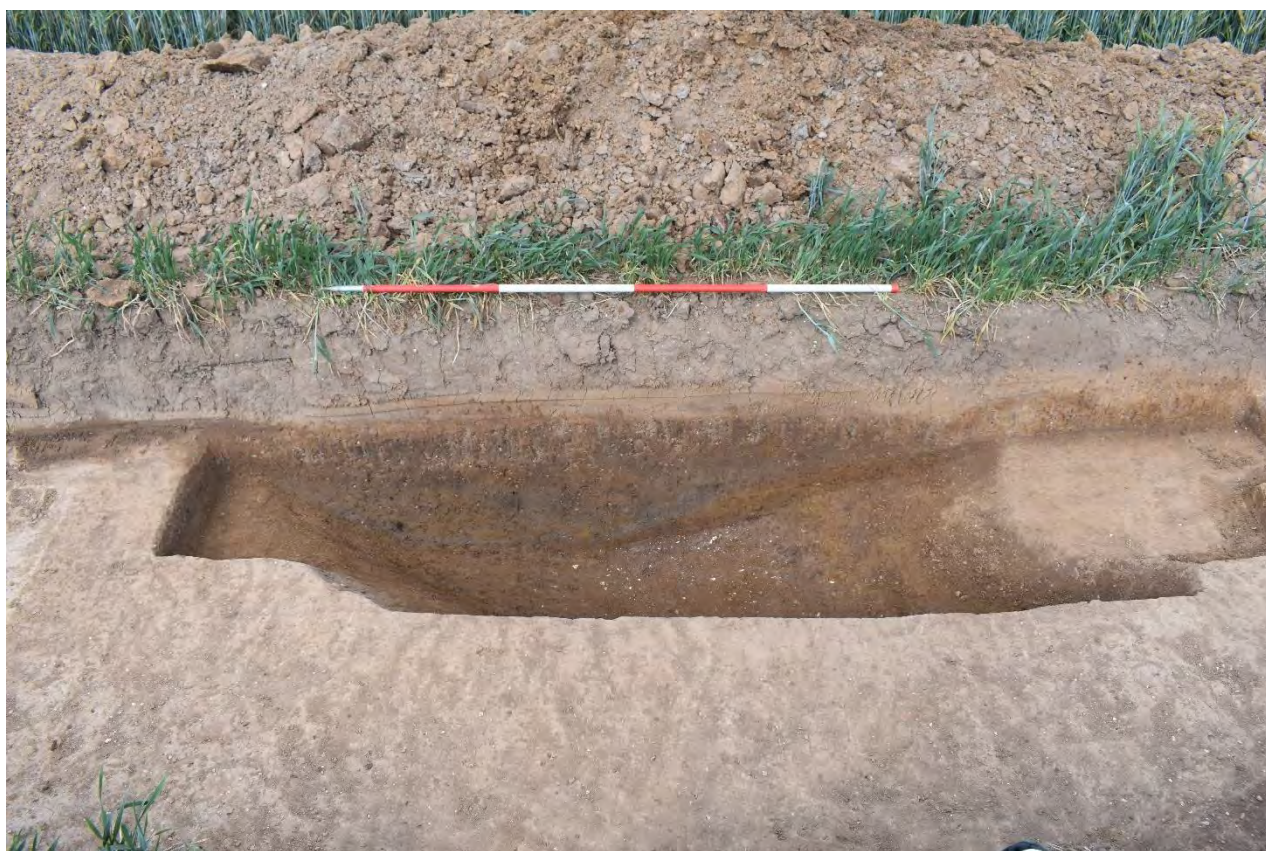
Plate 3.38: Trench 217. Ditch [21702]. Looking northeast.