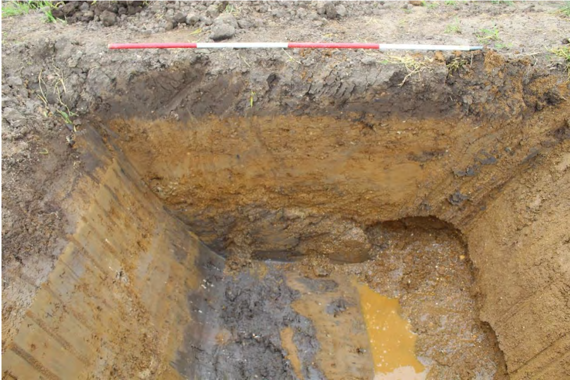
Plate 2.37 Trench 184. Sondage at south western end of trench showing natural deposits (18438), (18437), (18402) subsoil (18401) and topsoil (18400), looking south-east.