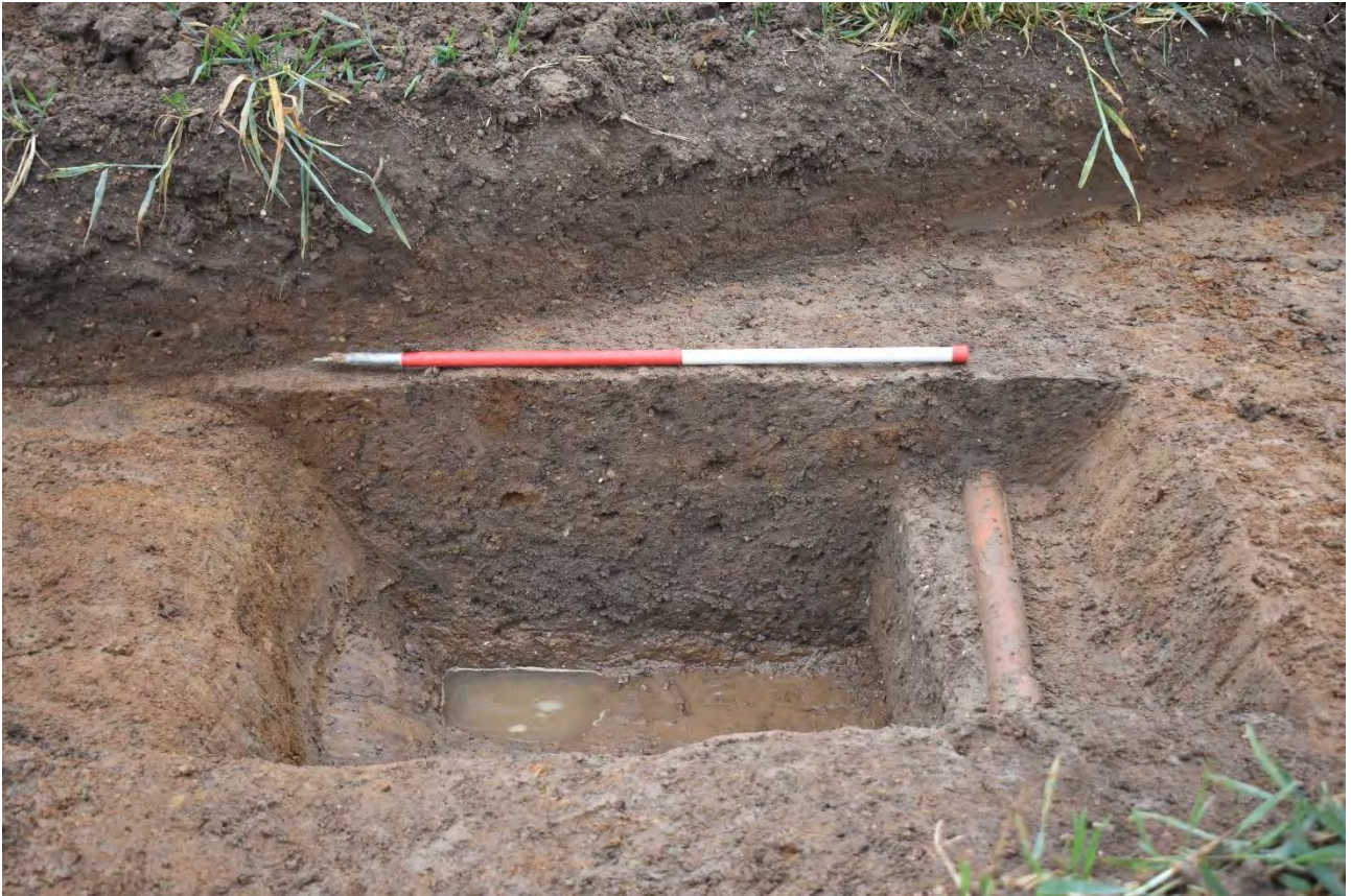
Plate 3.27: Trench 210. Ditch [21005]. Looking north.