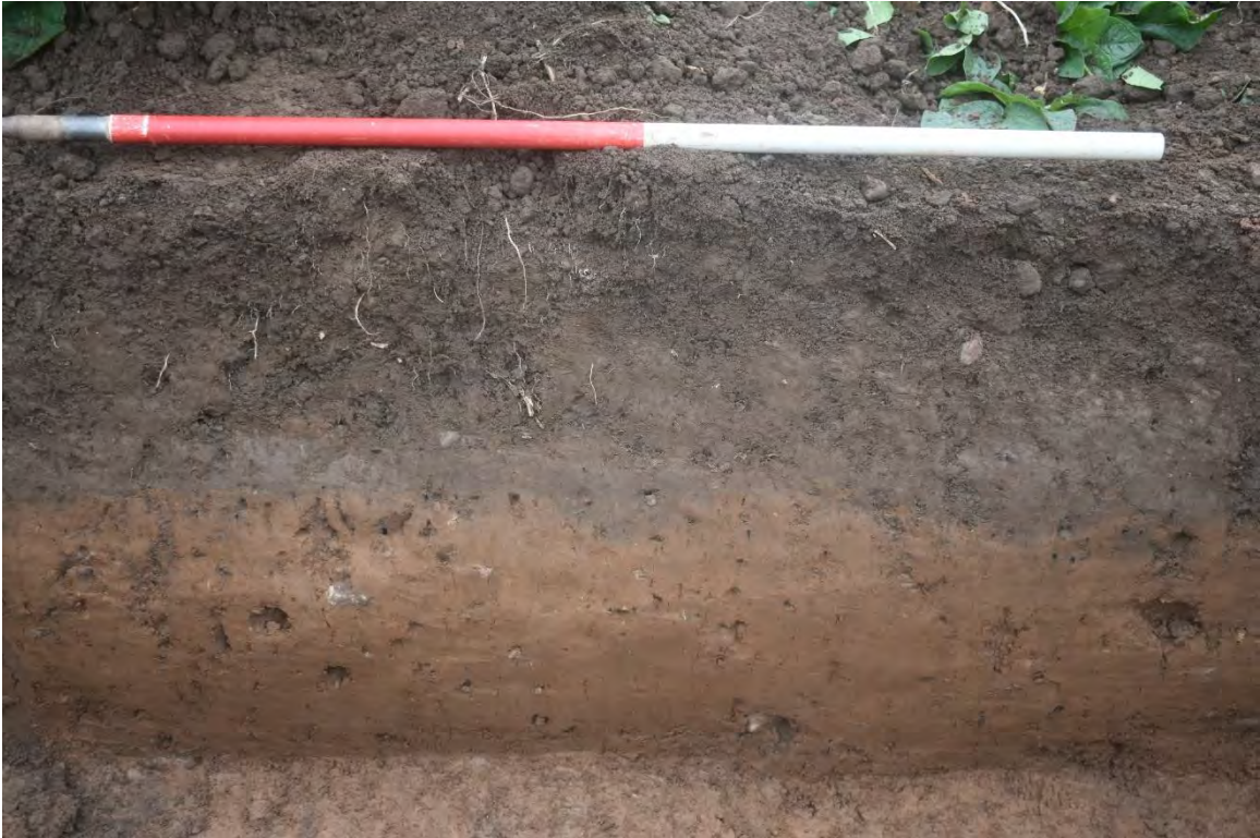
Plate 1.47 Trench 163. Northeast-facing representative section showing colluvial layer (16310), looking southwest.