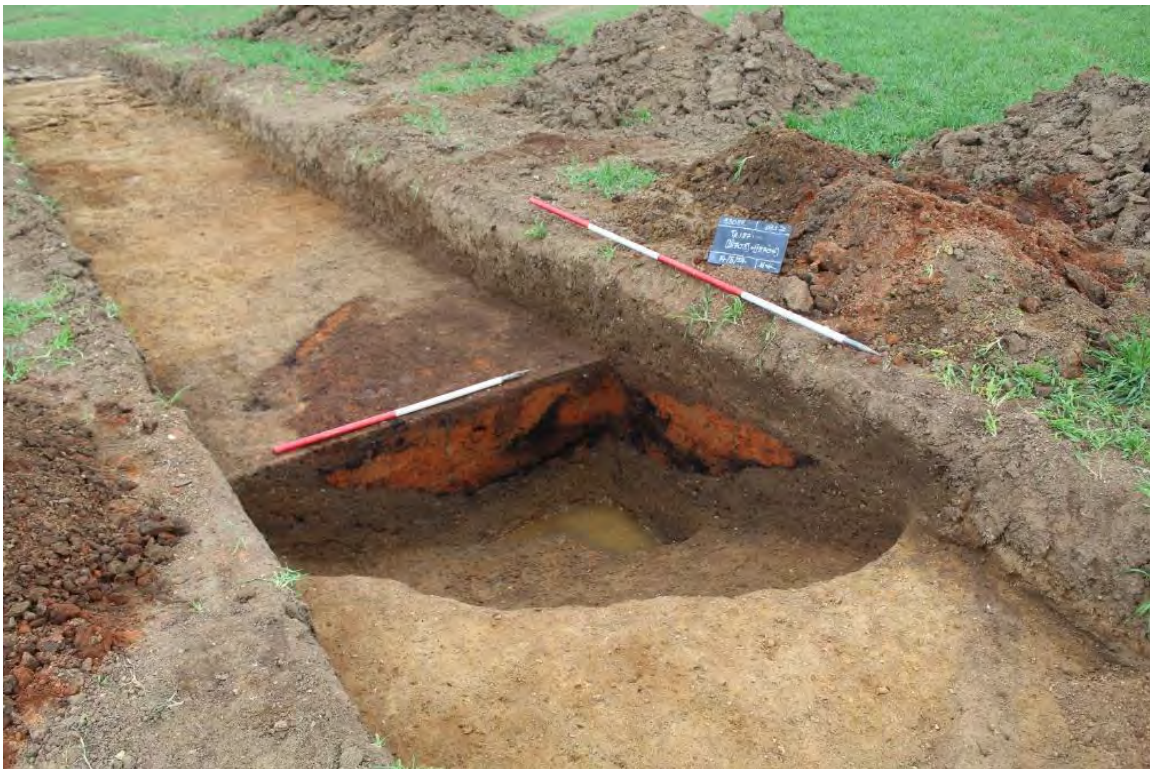
Plate 2.42 Trench 187. Pit [18703] and recut [18704] cutting natural surface (18702), looking north-east.