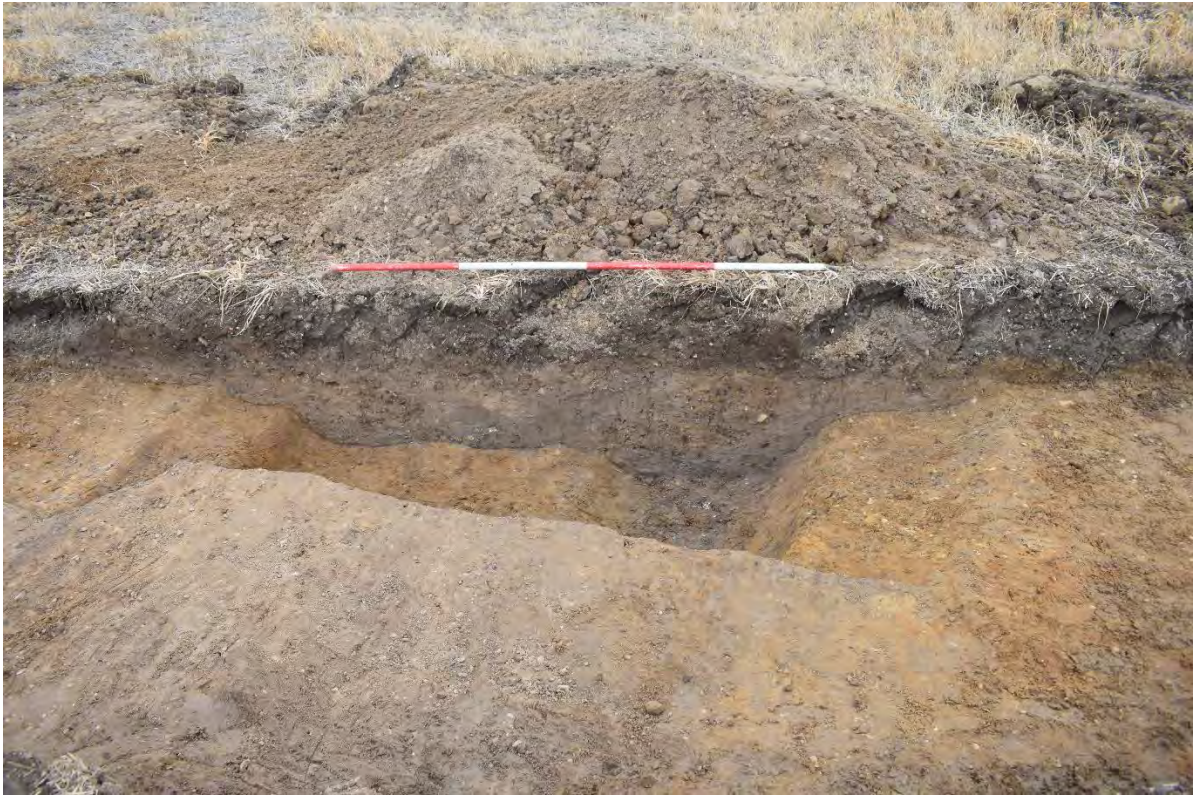
Plate 3.3: Trench 191. Ditch [19108] and recut [19109]. Looking southeast.