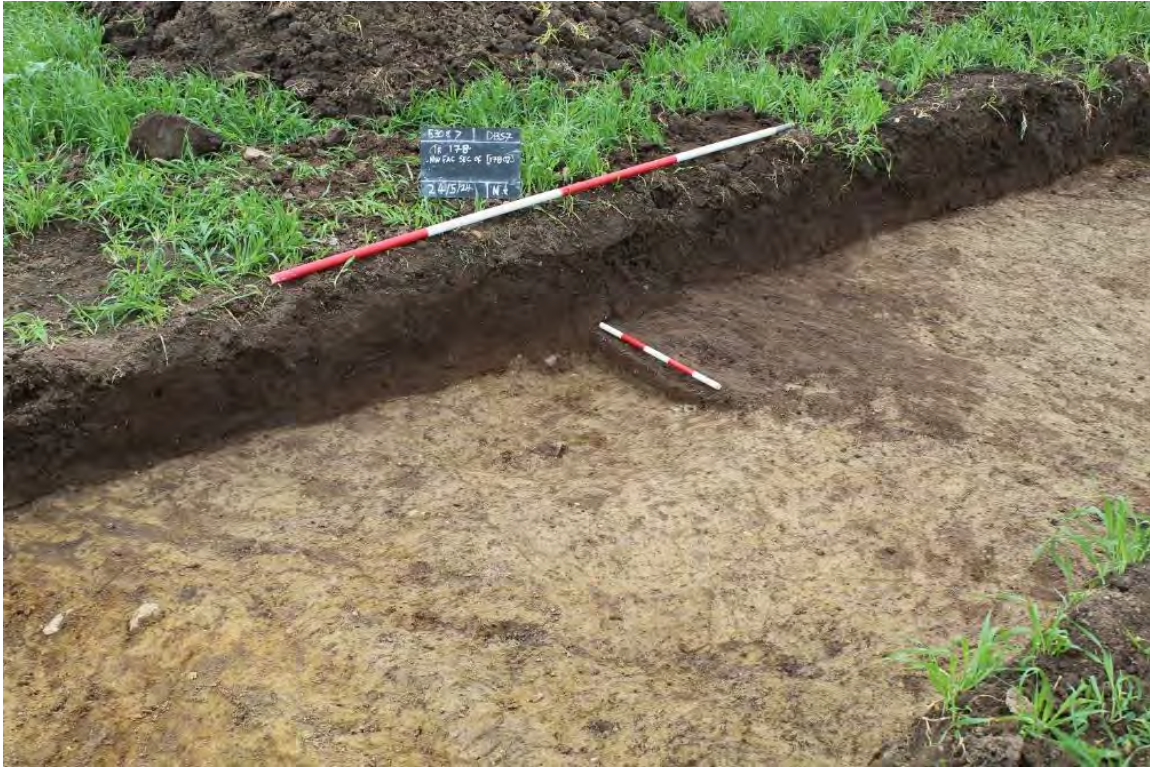
Plate 2.17 Trench 178. Truncated pit [17802] cut into natural (17801), looking south.