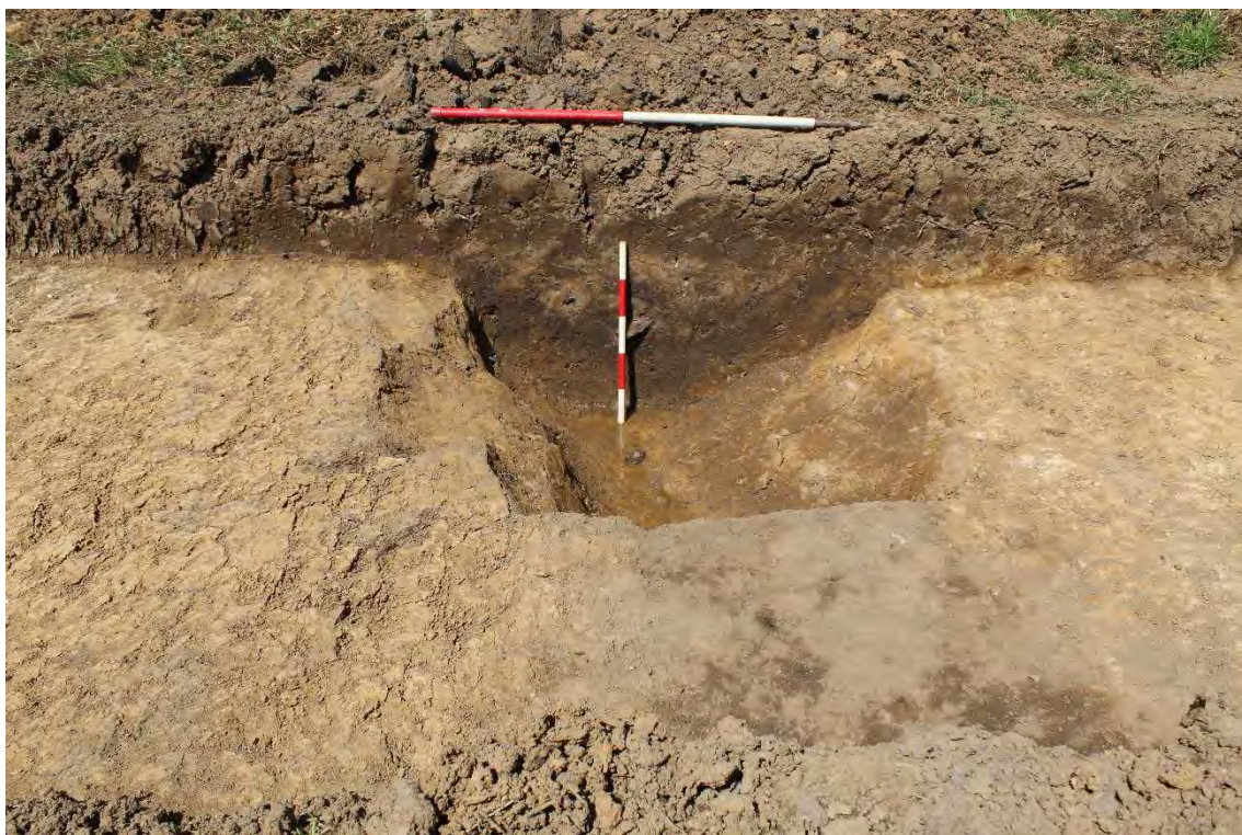
Plate 6.22: Trench 300. Gully [30004], part of Group 1, truncated by Pit [30003]. Looking north.