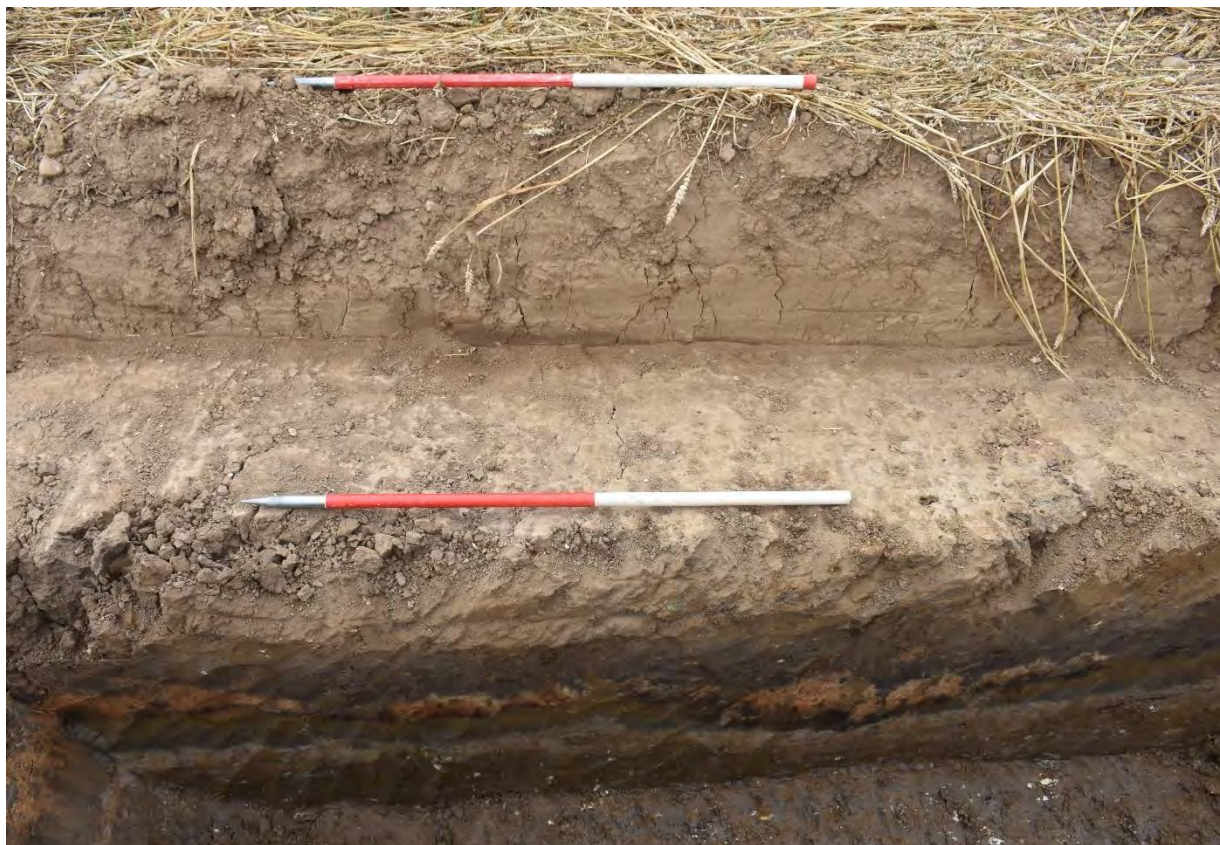
Plate 4.3: Trench 227. Section showing deposit sequence at west end. Looking south.