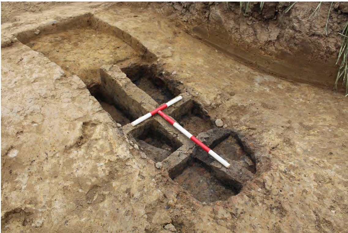
Plate 6.20: Trench 293. Potential fire pit [29303] with lining of fire-cracked stones (29313). Truncated by furrow [29307]. Looking northeast.