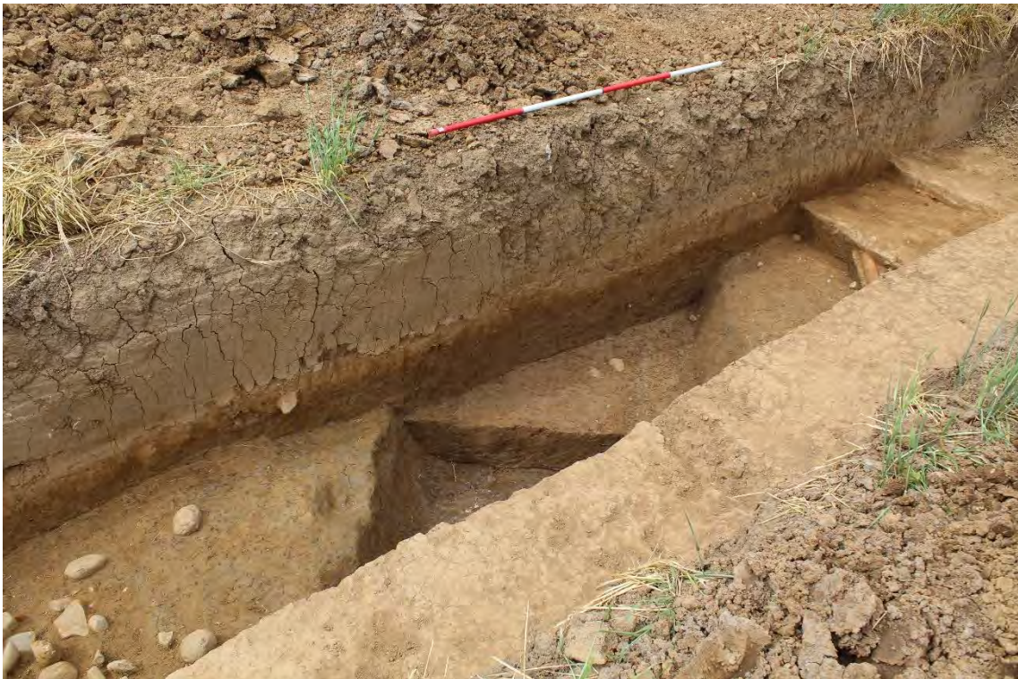
Plate 6.12: Trench 284. Detailed view of ditch sequence [28406], [28408], and [28443] which was overlain by medieval deposit (28421) and sealing deposit (28402). Looking northeast.