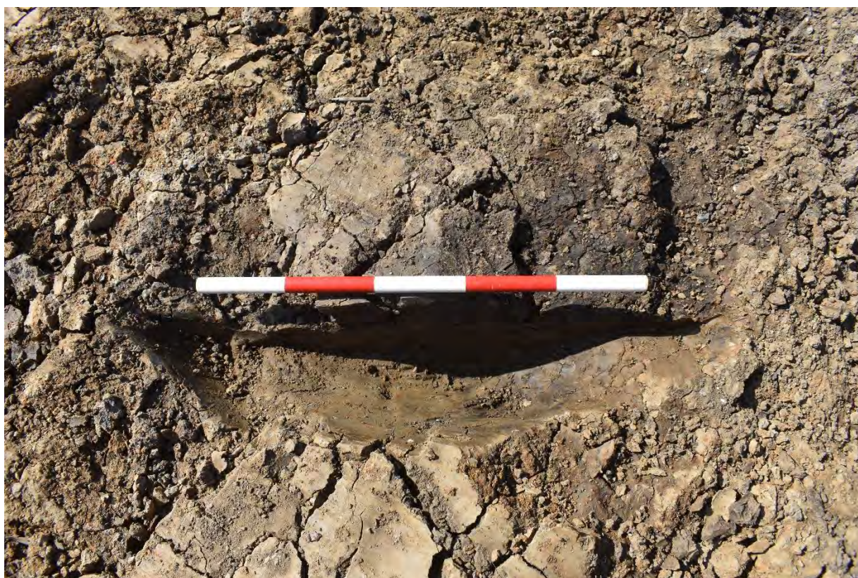
Plate 3.8: Trench 194. Possible natural pit [19405]. Looking northwest.