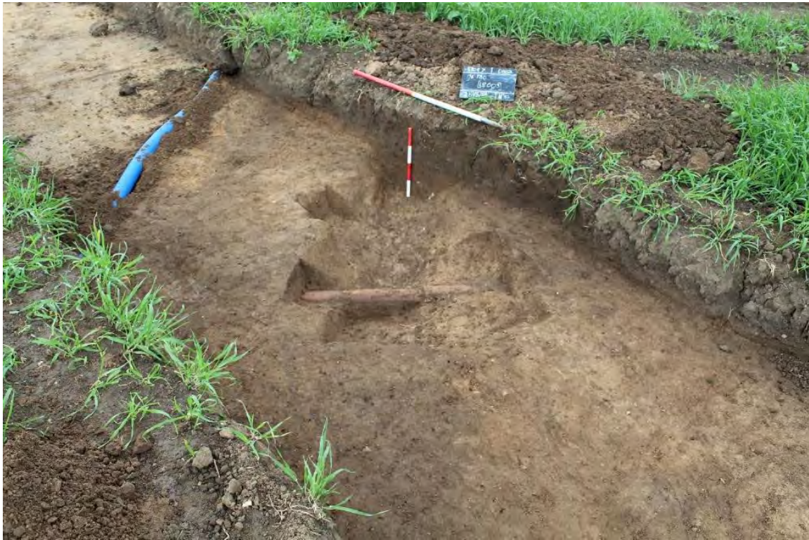
Plate 2.23 Trench 180. Ditch [18003], looking north-east.