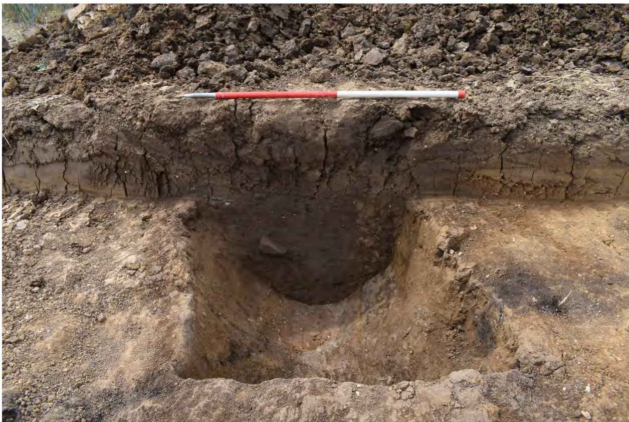
Plate 4.18: Trench 233. Ditch [23302], looking west-northwest.