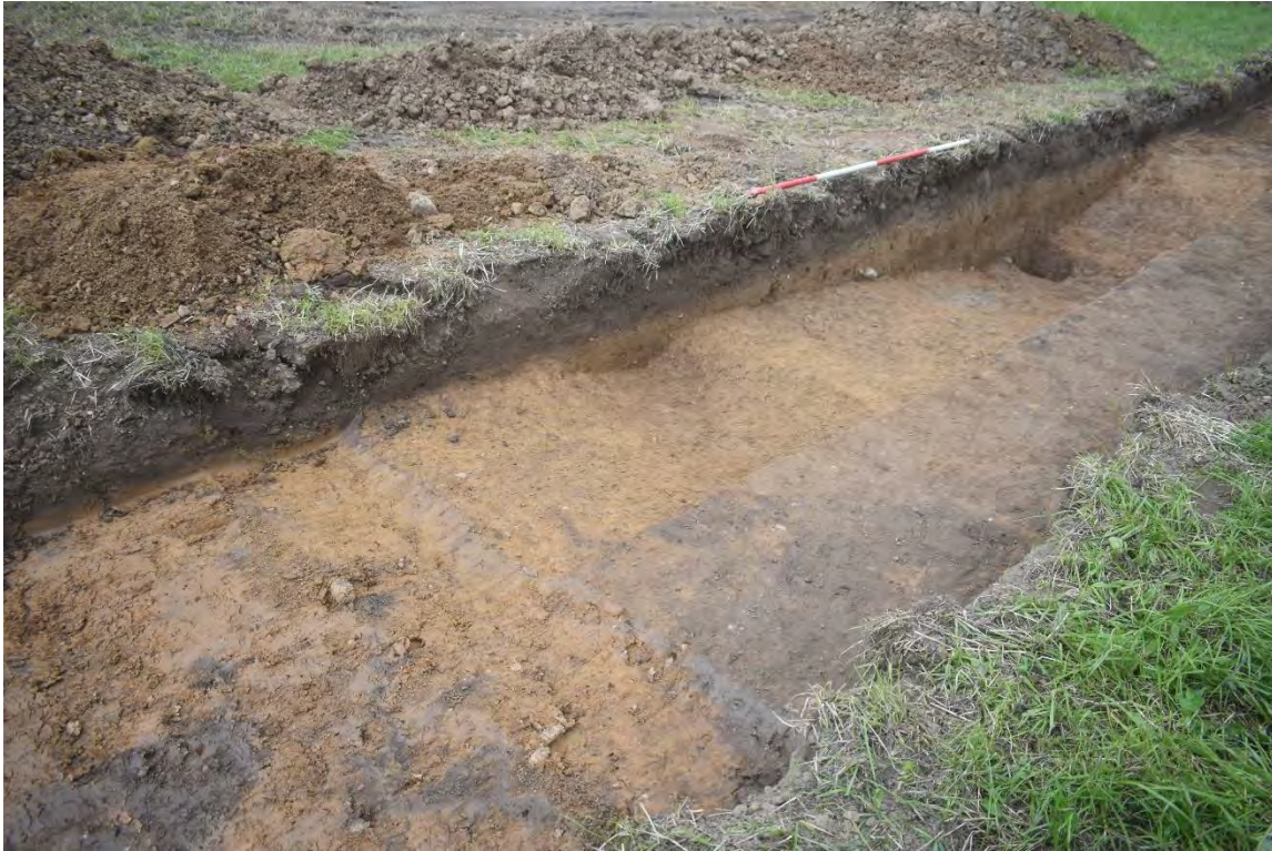
Plate 1.25 Trench 143. Oblique plan shot of furrow [14305], looking