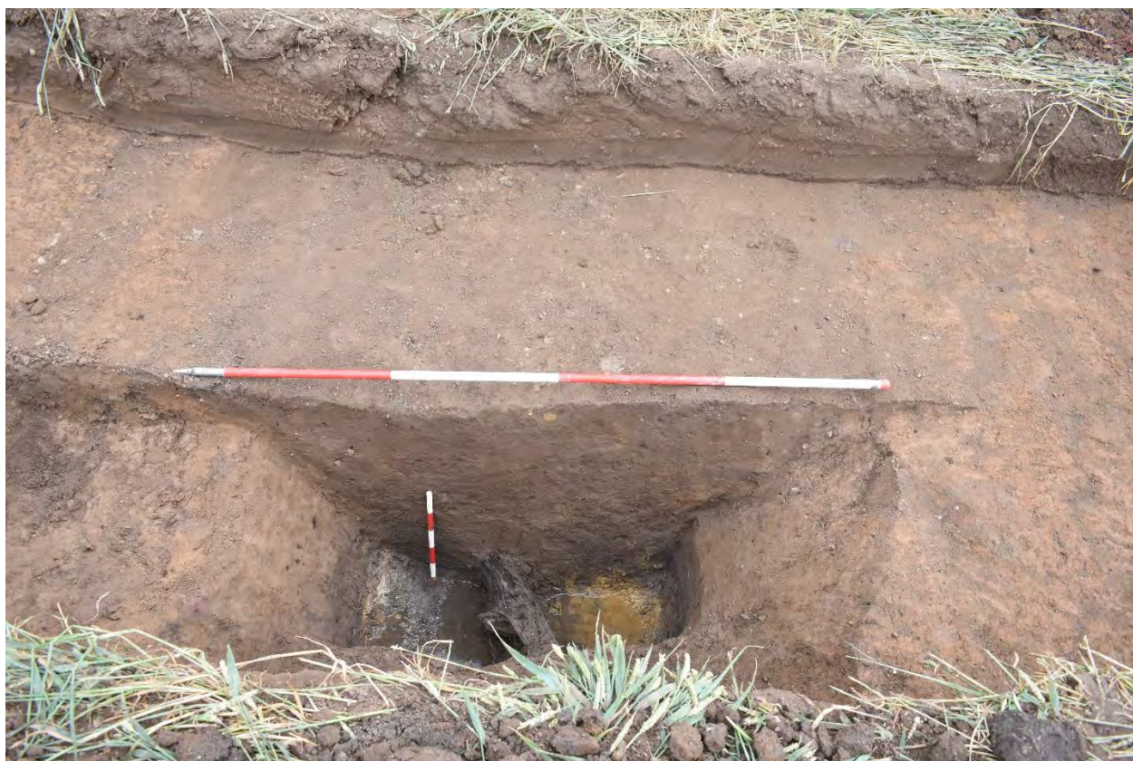
Plate 4.27: Trench 244, Ditch [24403] with wood 24419. Looking east-southeast.