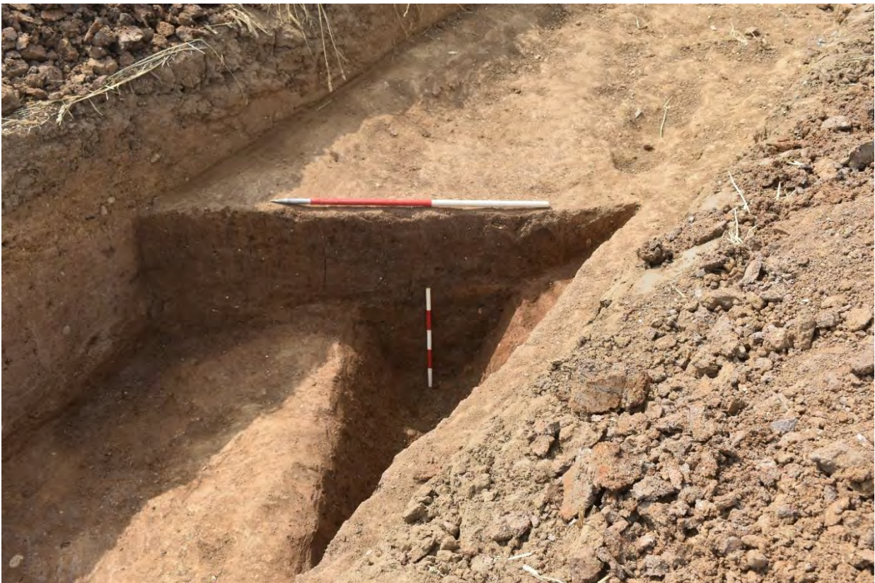
Plate 4.13: Trench 230. Ditch [23041] truncated by [23072] and [23074]. Ditch [23052] is visible to the left (unexcavated, in plan) with truncation [23003] above, in section. Looking west.