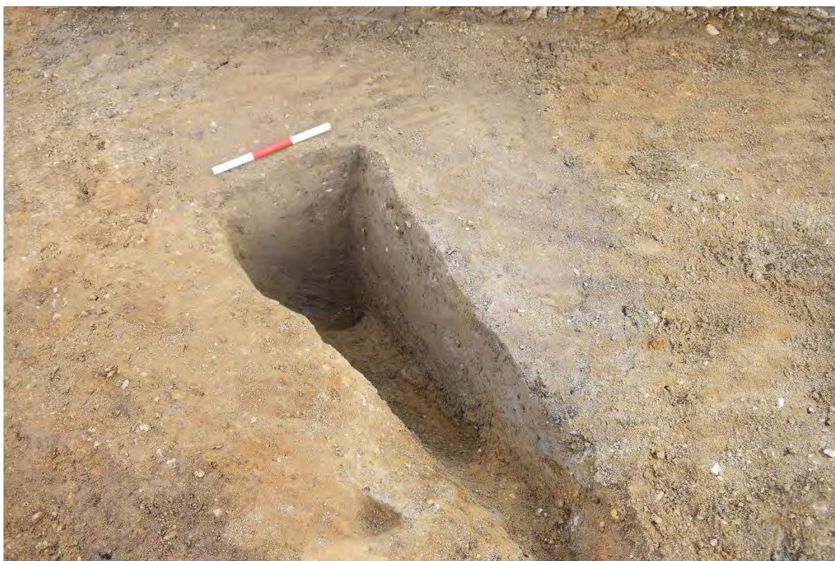
Plate 3.5: Trench 191. Terminus or pit [19105]. Looking southeast.