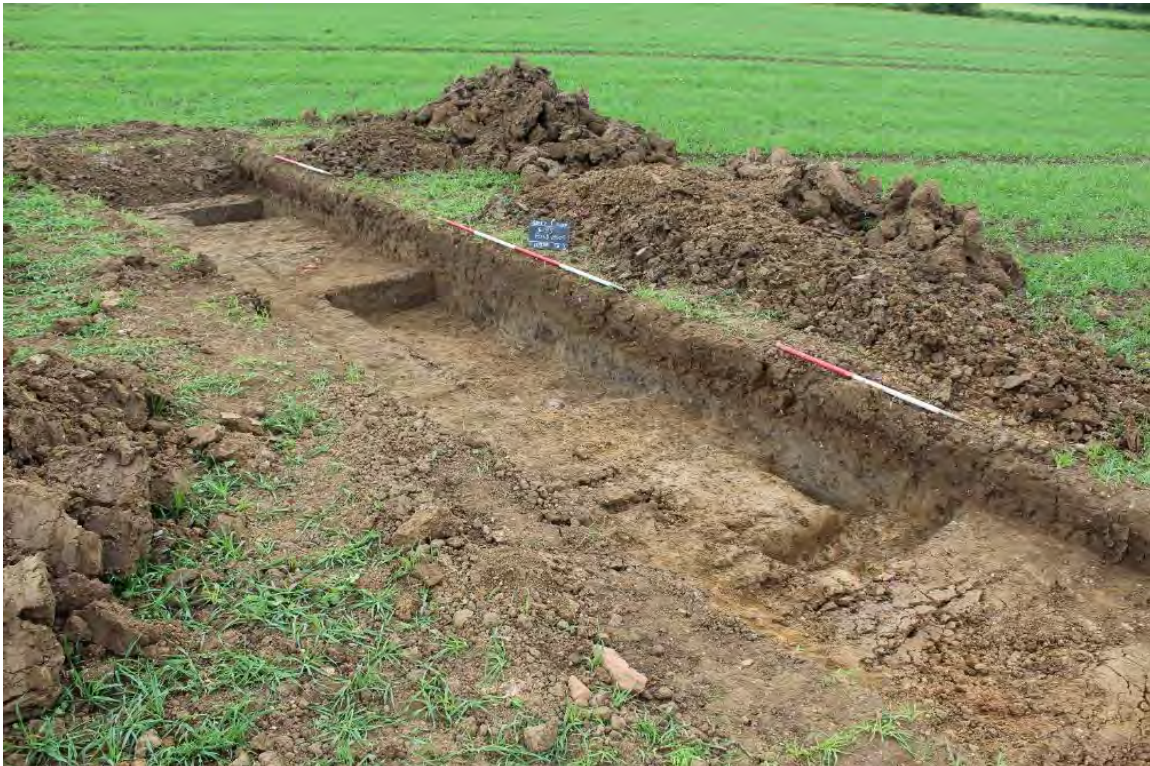
Plate 2.38 Trench 185. Silted up hollow [18505], looking south.