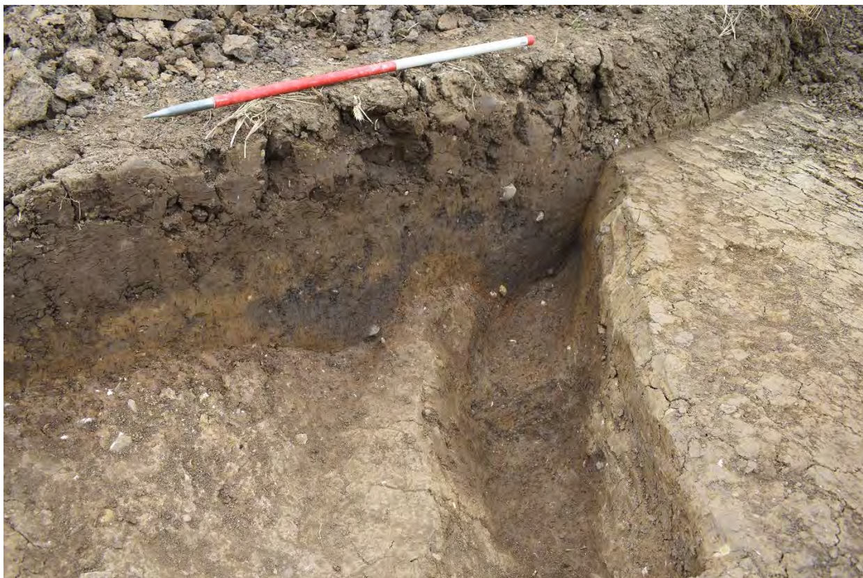
Plate 4.22: Trench 234. Ditches [23403] and [23406], looking southwest.