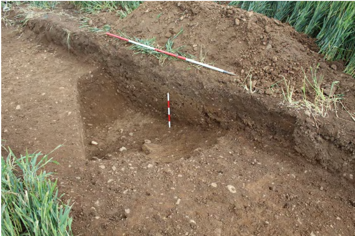
Plate 5.22 Trench 272. Ditch [27203], looking northeast.