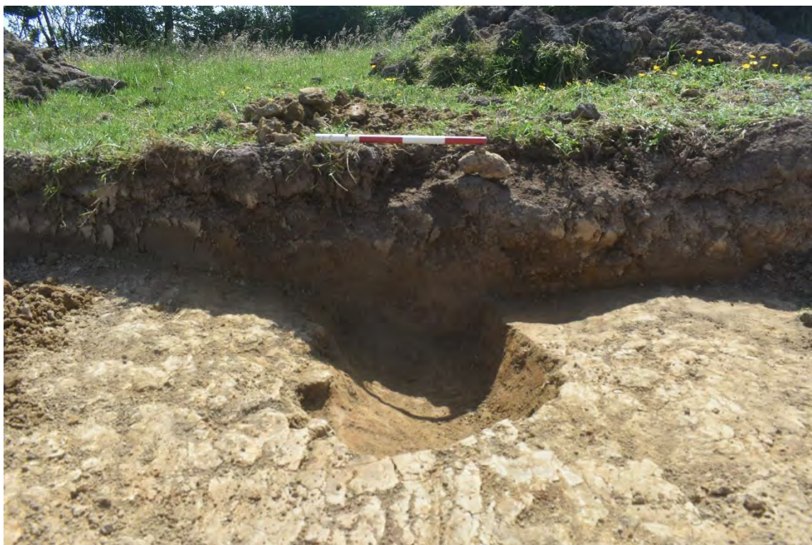
Plate 1.29 Trench 145. Northeast-facing section of gully [14506], looking southwest.