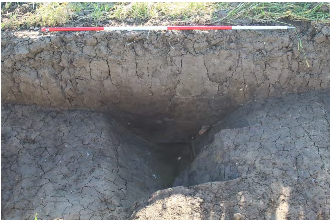
Plate 6.16: Trench 288. Field boundary [28810] and its recuts [28804] and [28806] truncating water lain deposits (28808) and (28809). Looking east.