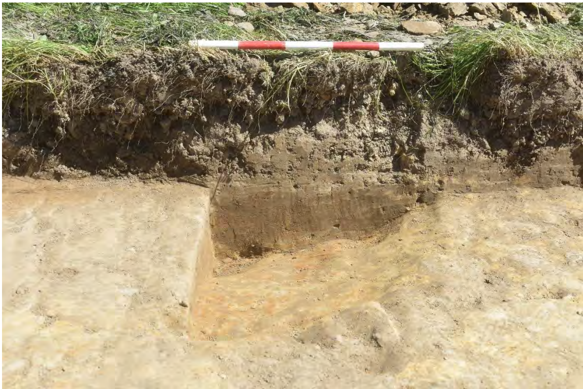
Plate 1.32 Trench 150. Southwest-facing section of pit [15002], looking northeast.