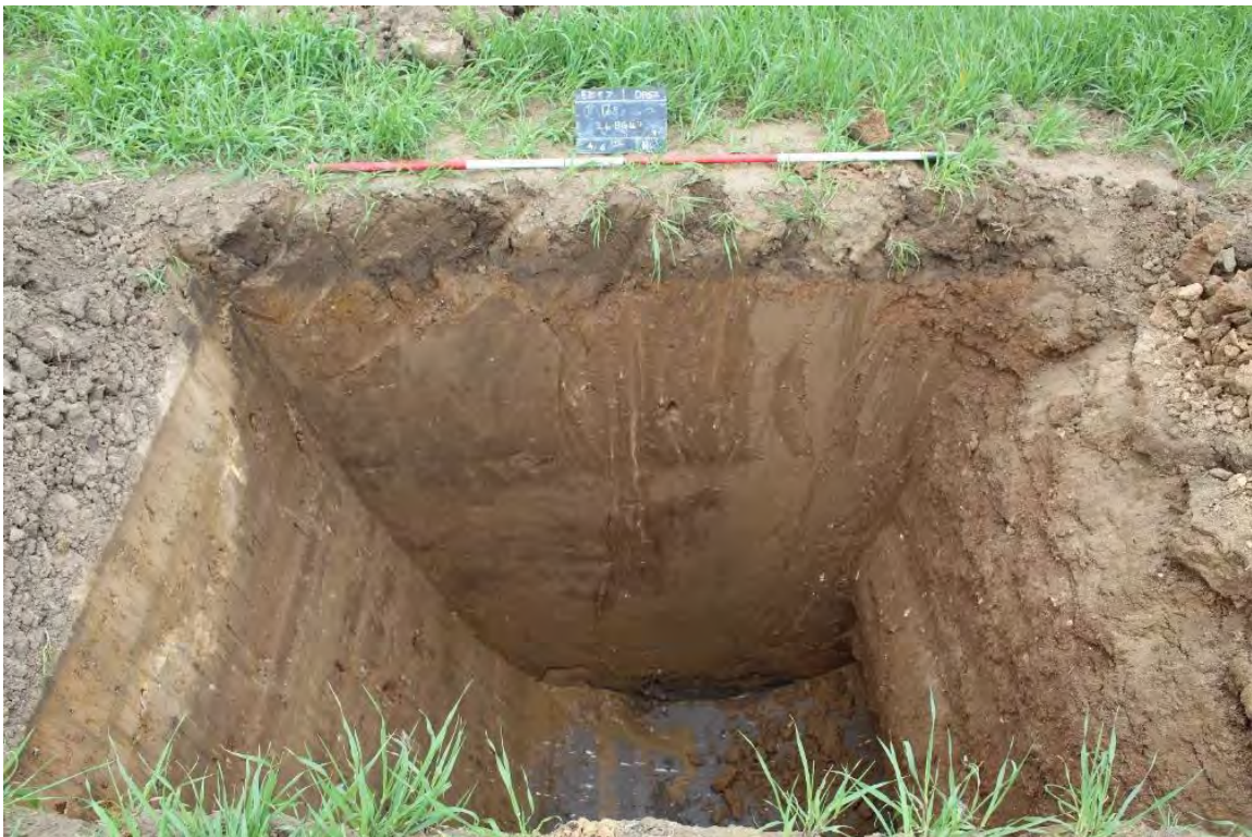
Plate 2.18 Trench 178. Sondage at south-western end of trench showing natural deposits (17802, 17805 - 17807) and topsoil (17800), looking south-east.