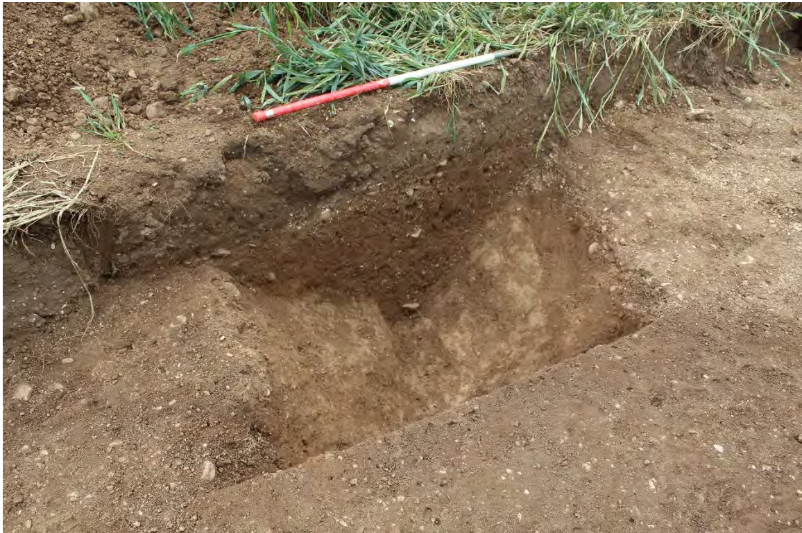
Plate 5.4 Trench 269. Northwest-facing section of ditch [26905], looking southeast.