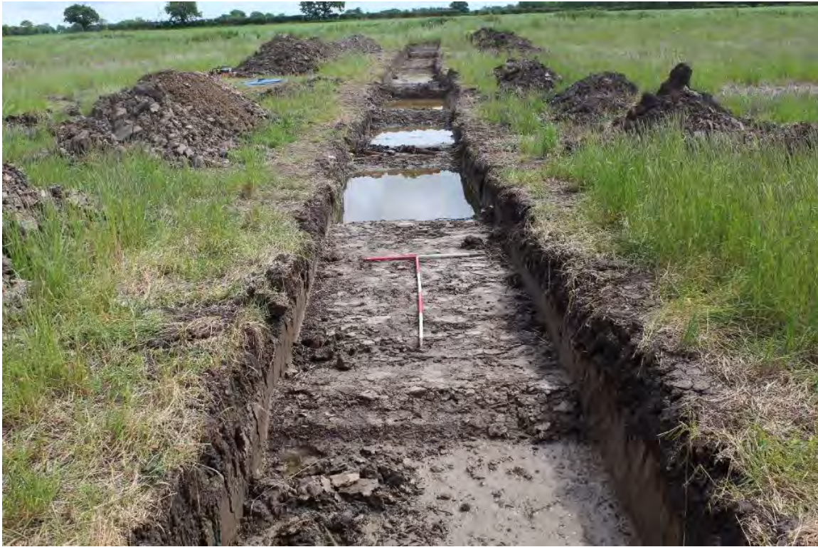
Plate 2.1 Trench 172. Overall shot, looking east.