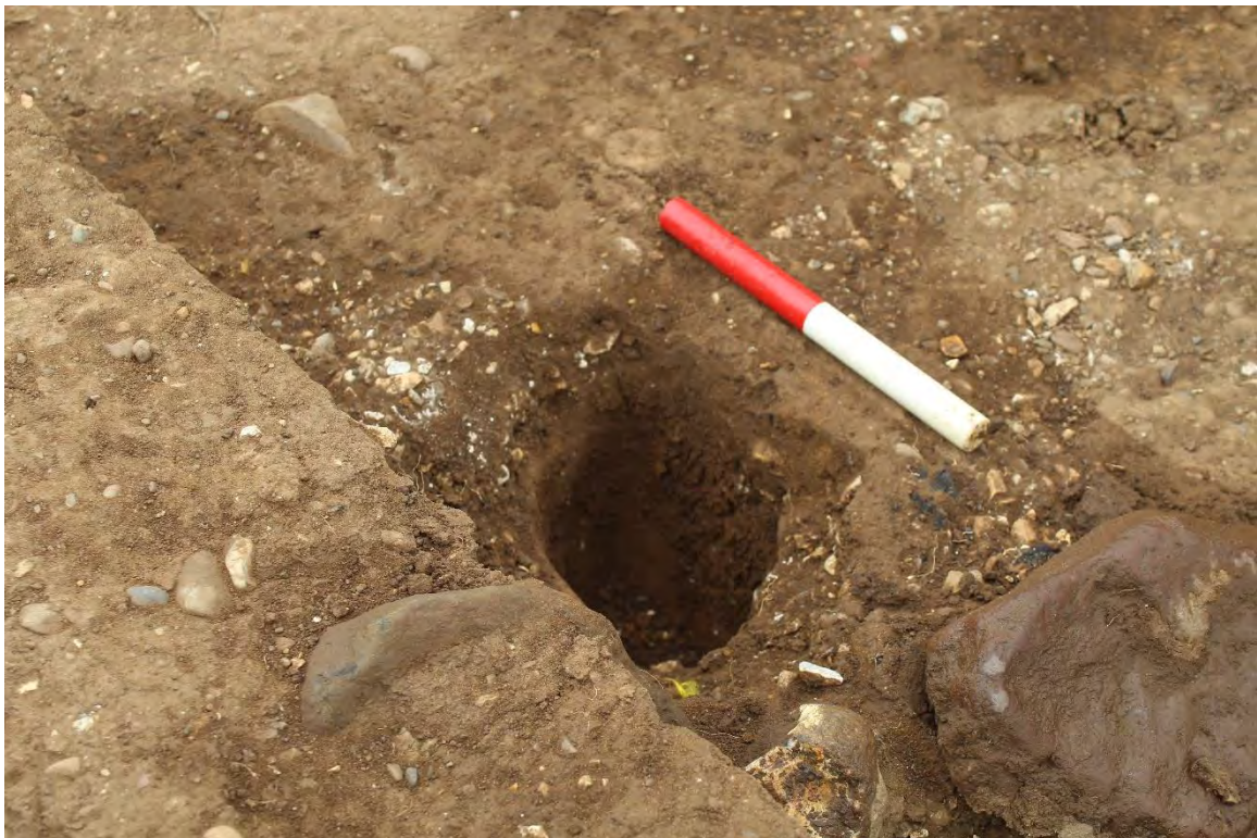
Plate 5.12 Trench 269. Stakehole [26943].