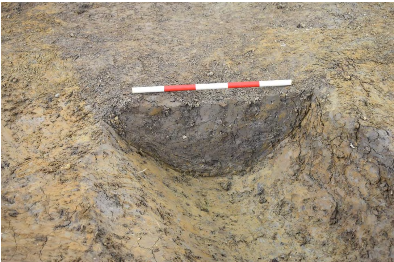
Plate 3.46: Trench 220. Gully [22002]. Looking north