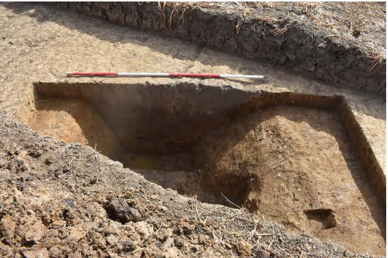
Plate 3.14: Trench 197. Ditch [19705]. Looking southwest.