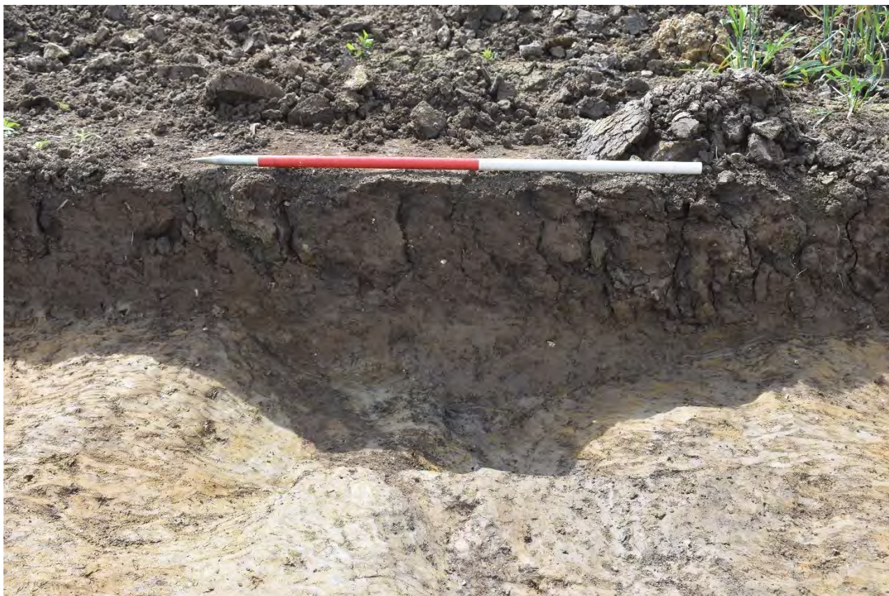
Plate 3.47: Trench 220. Ditch [22007]. Looking south.