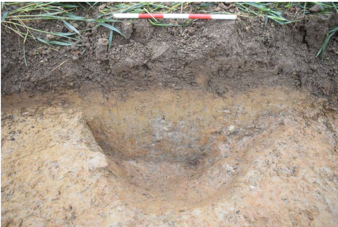
Plate 1.24 Trench 136. Southeast-facing section of pit [13604], looking northwest.