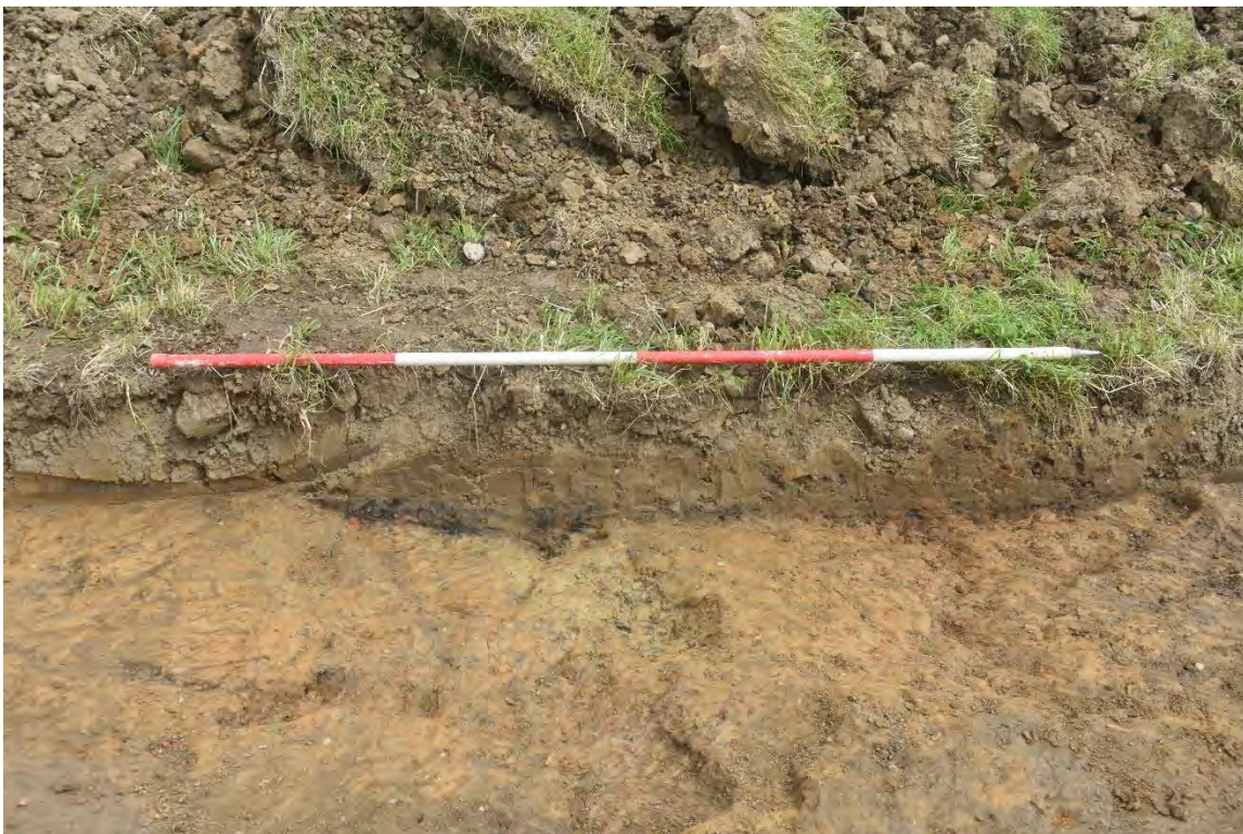
Plate 1.26 Trench 143. South-facing section of modern pit [14303], looking north.