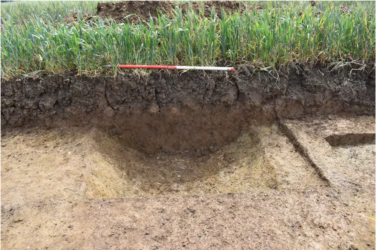
Plate 3.49: Trench 221. Ditch [22108]. Looking southeast.