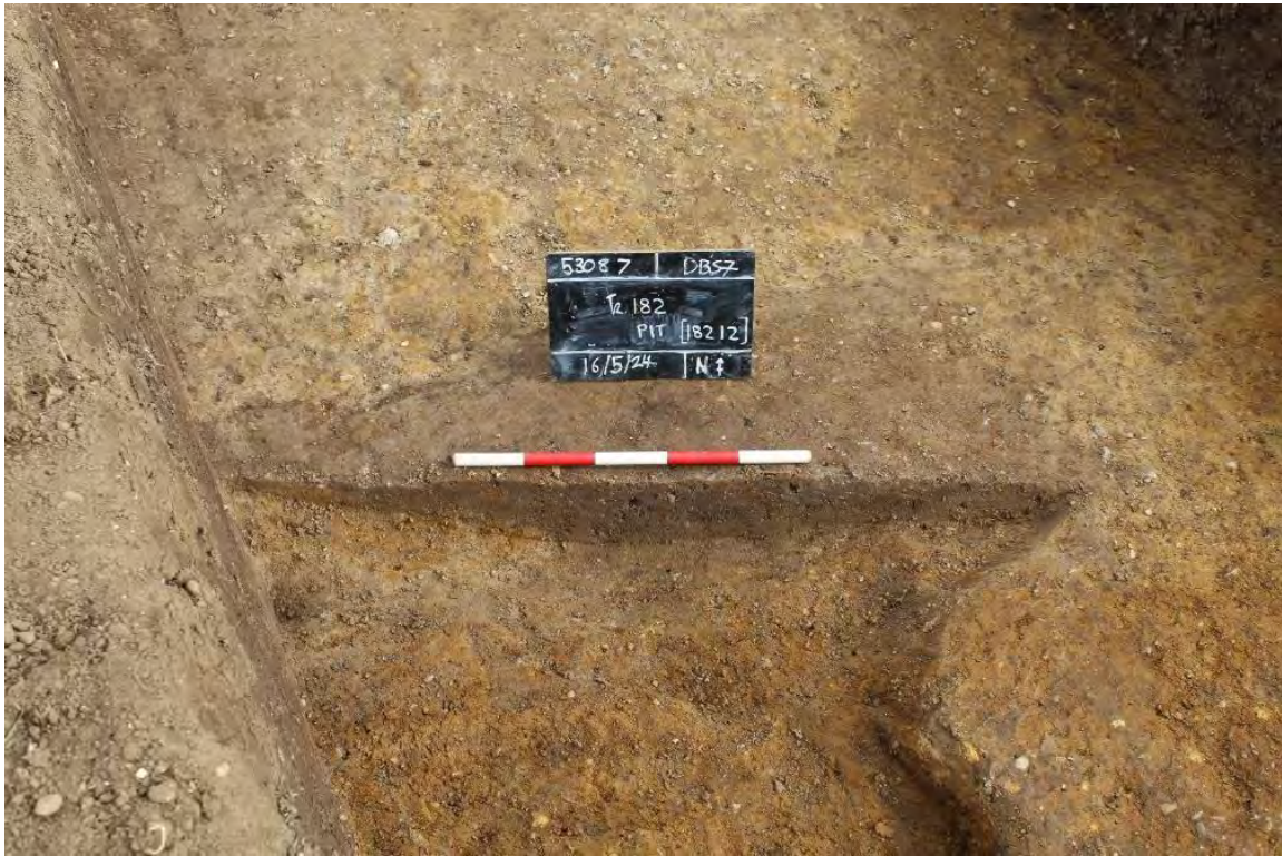
Plate 2.31 Trench 182. Pit [18212] cutting natural (18202), looking north.