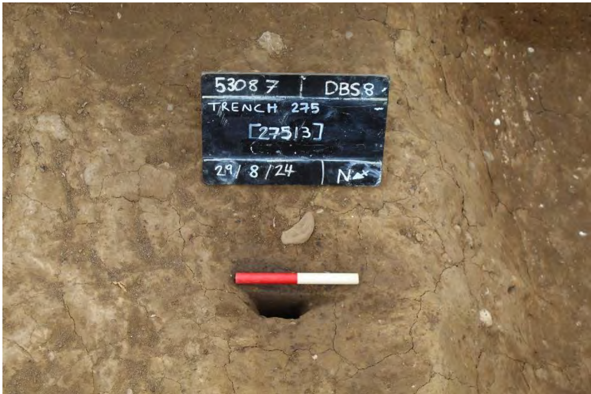
Plate 5.26 Trench 275. Stakehole [27513]. Facing south-east.