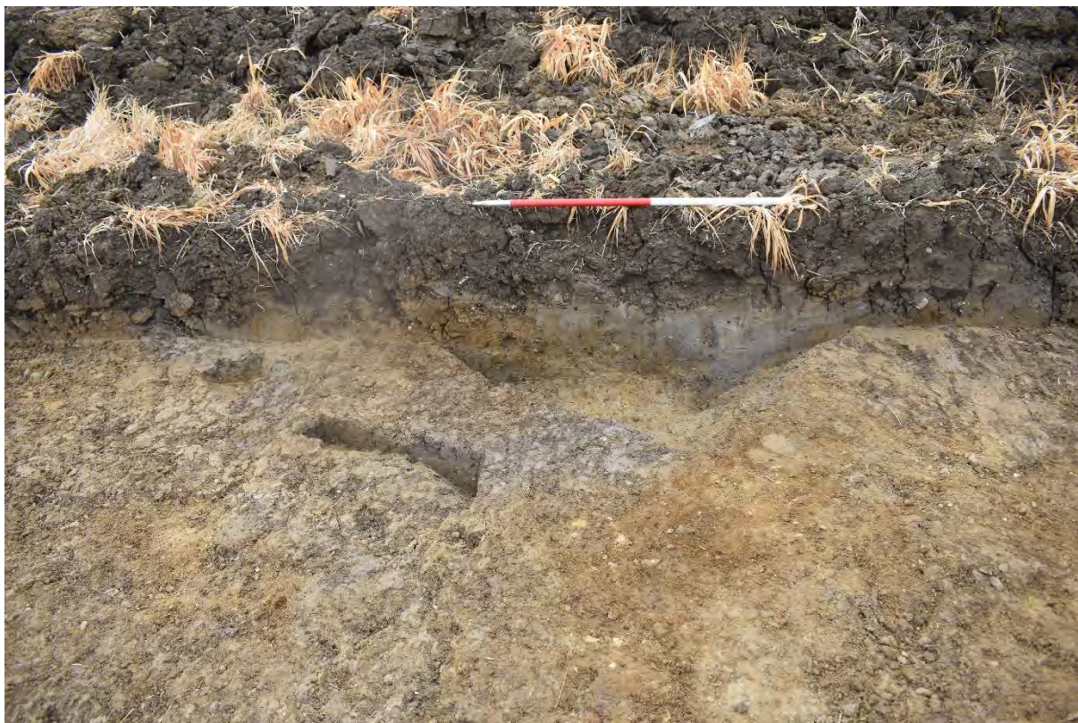
Plate 3.7: Trench 192. Plan shot of waterlogged natural hollow (contexts [19202], [19203] and [19204]). Looking southeast.