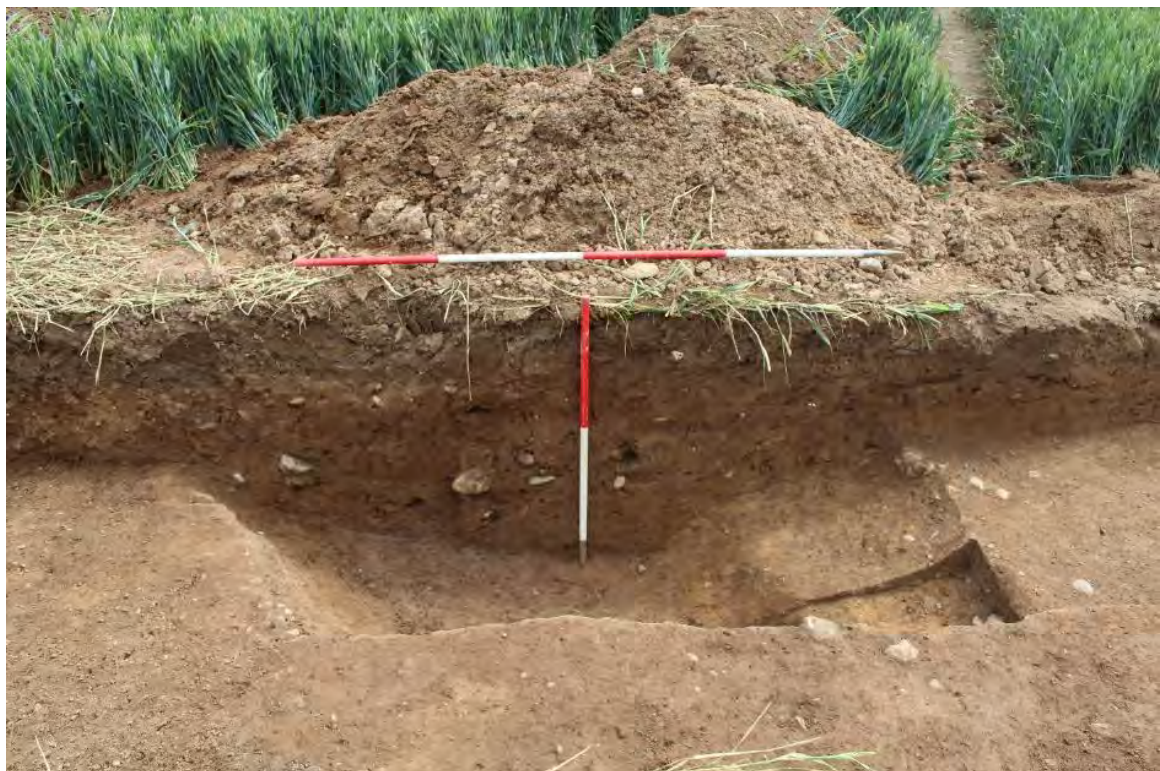
Plate 5.2 Trench 265. Ditch [26512] and recut [26506], looking northeast.