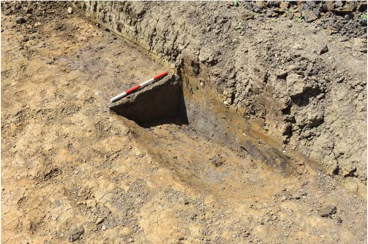
Plate 3.33: Trench 215. Pit [21509]. Looking west.