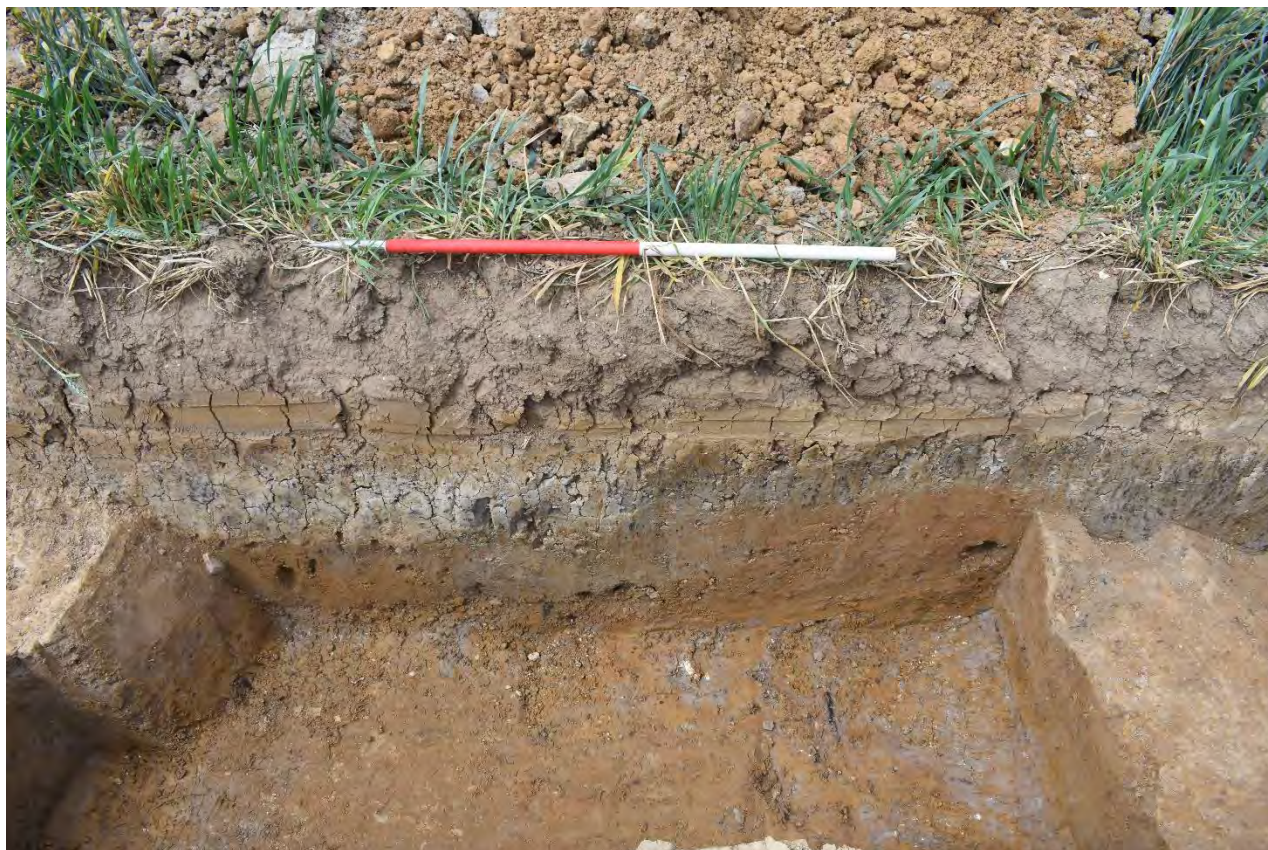
Plate 3.35: Trench 216. Possible ditch [21607] running through natural deposits. Looking north.