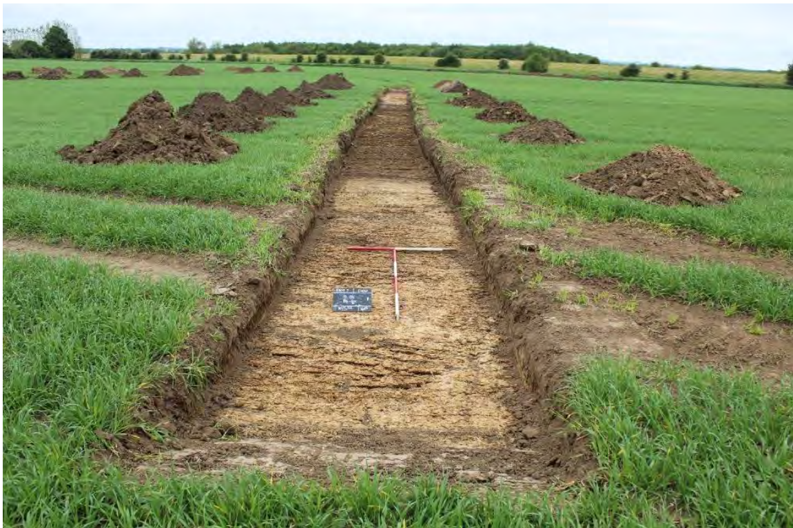
Plate 2.10 Trench 176. Overall shot showing stripped natural surface (17602) and dark silted up hollow, looking west.