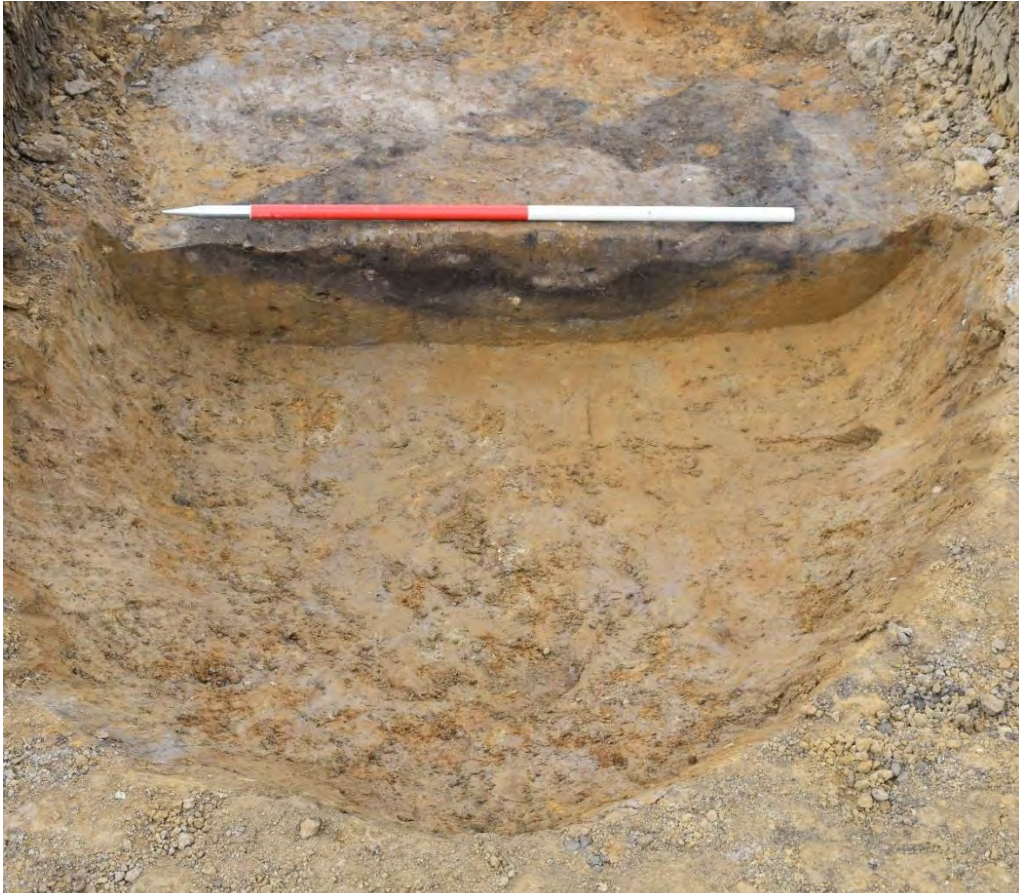
Plate 3.17: Trench 199. Pit [19907]. Looking northwest. Trench 199.