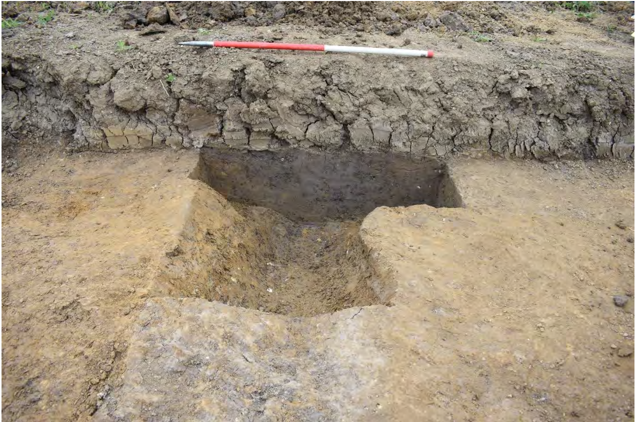
Plate 3.51: Trench 221. Group 3 cut by Ditch [22110]. Looking west.