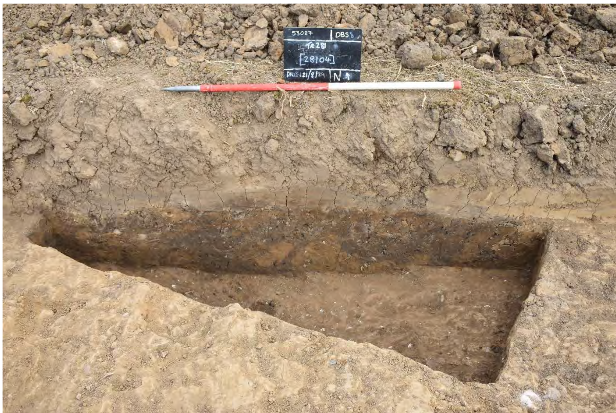
Plate 5.35 Trench 281. Former hedgerow feature [28104]. Facing north.