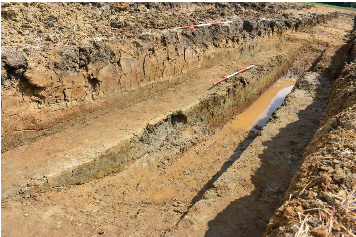
Plate 3.10: Trench 195. Sondage through pond. Looking southeast.