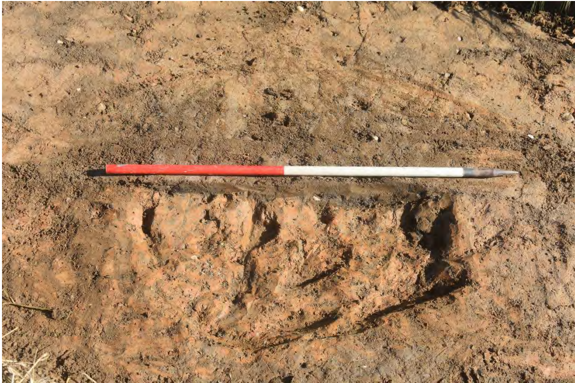
Plate 1.39 Trench 159. South-facing section of tree throw [15903], looking north.