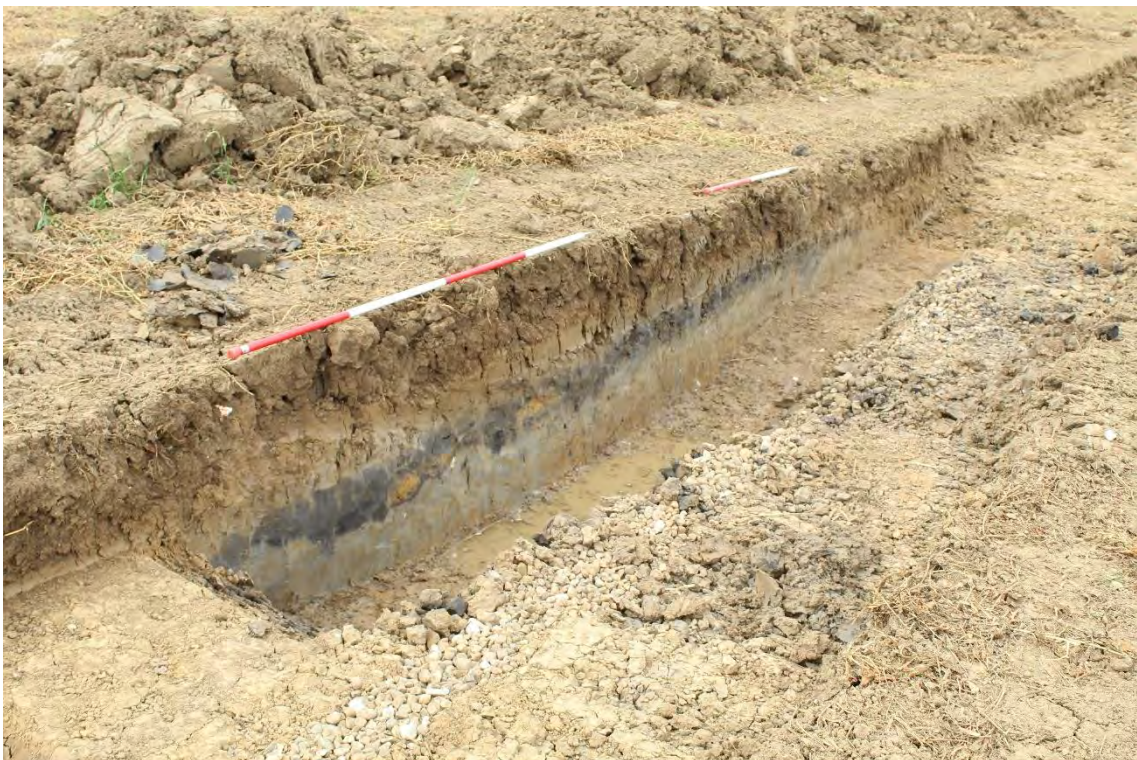
Plate 6.24: Trench 302. Pond [30224] infilled by natural alluvial deposits. Looking southwest.