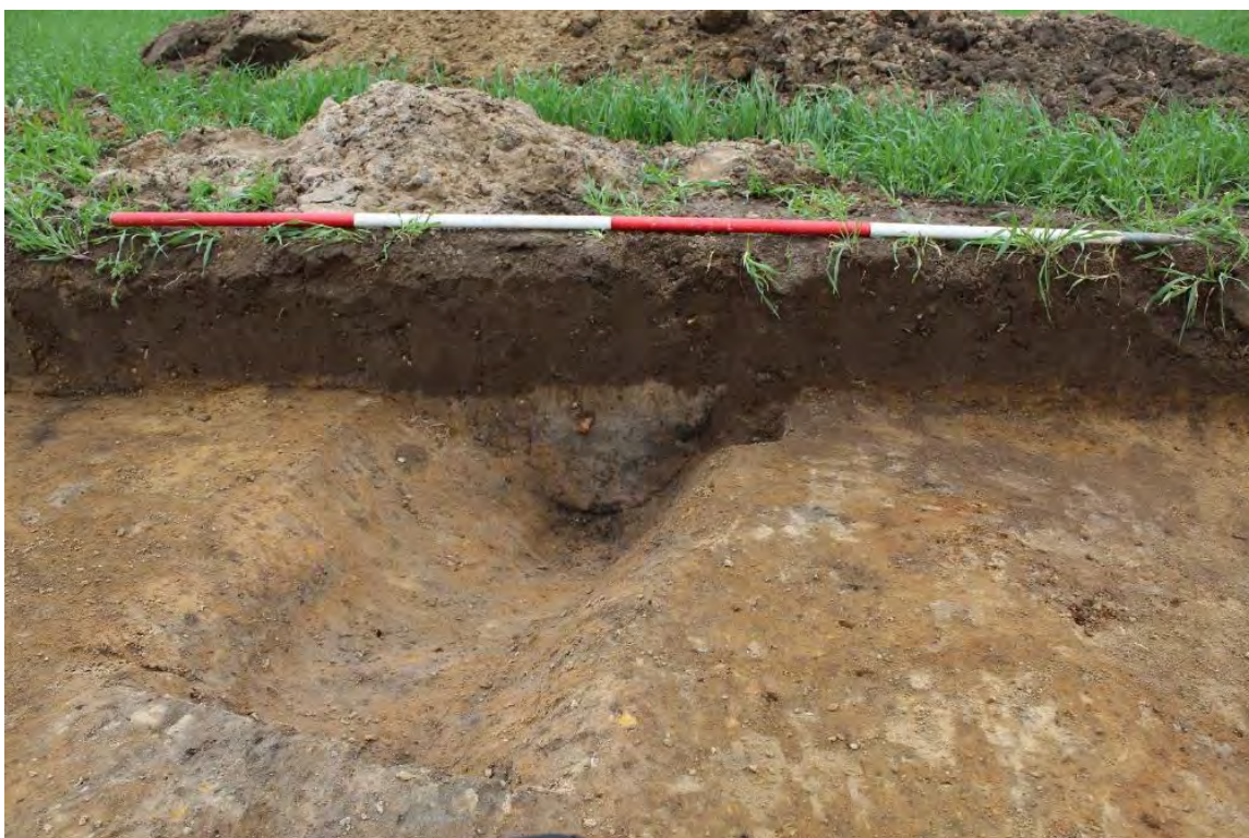
Plate 2.14 Trench 177. Ditch [17703], looking south-west.