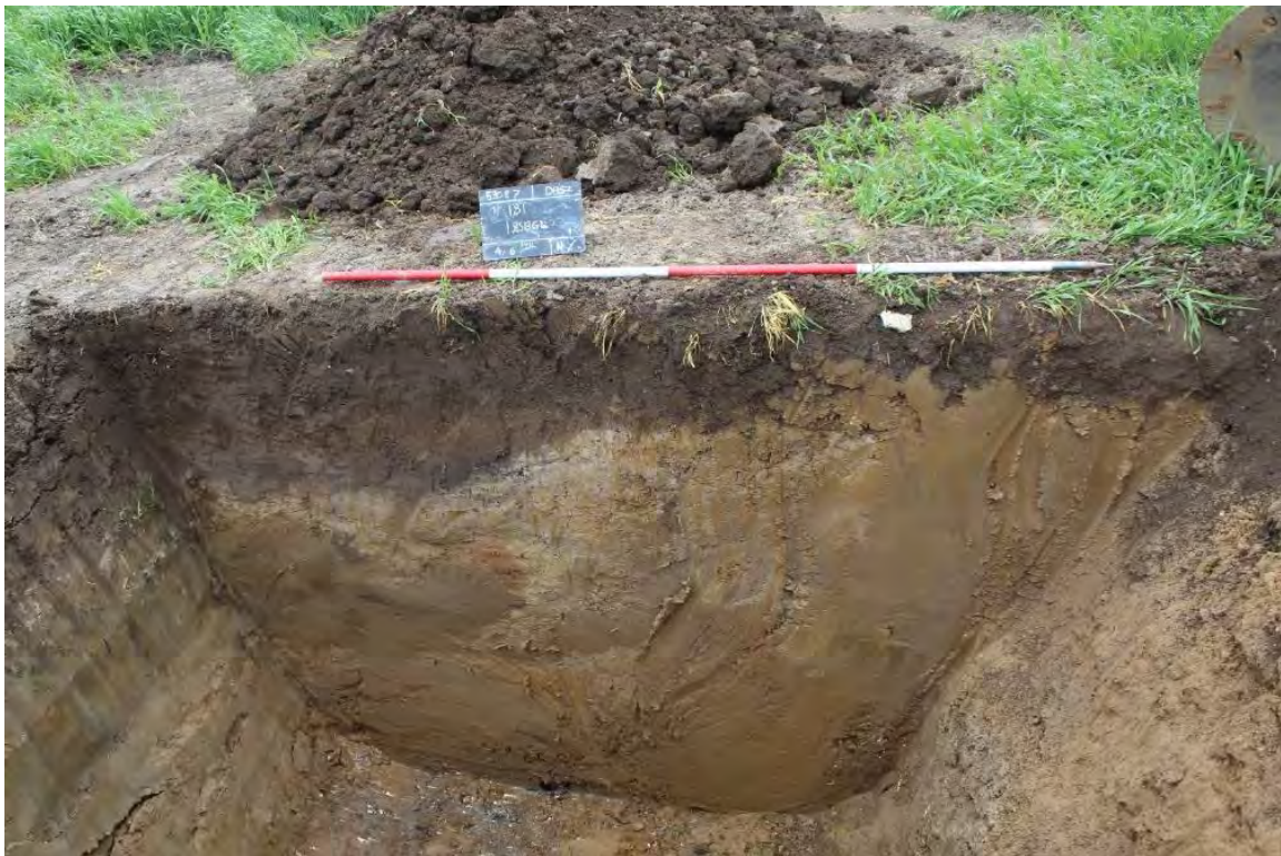
Plate 2.28 Trench 181. Test pit showing natural deposits (18102), (18106) – (18109), subsoil (18101) and topsoil (18100), looking south-east.