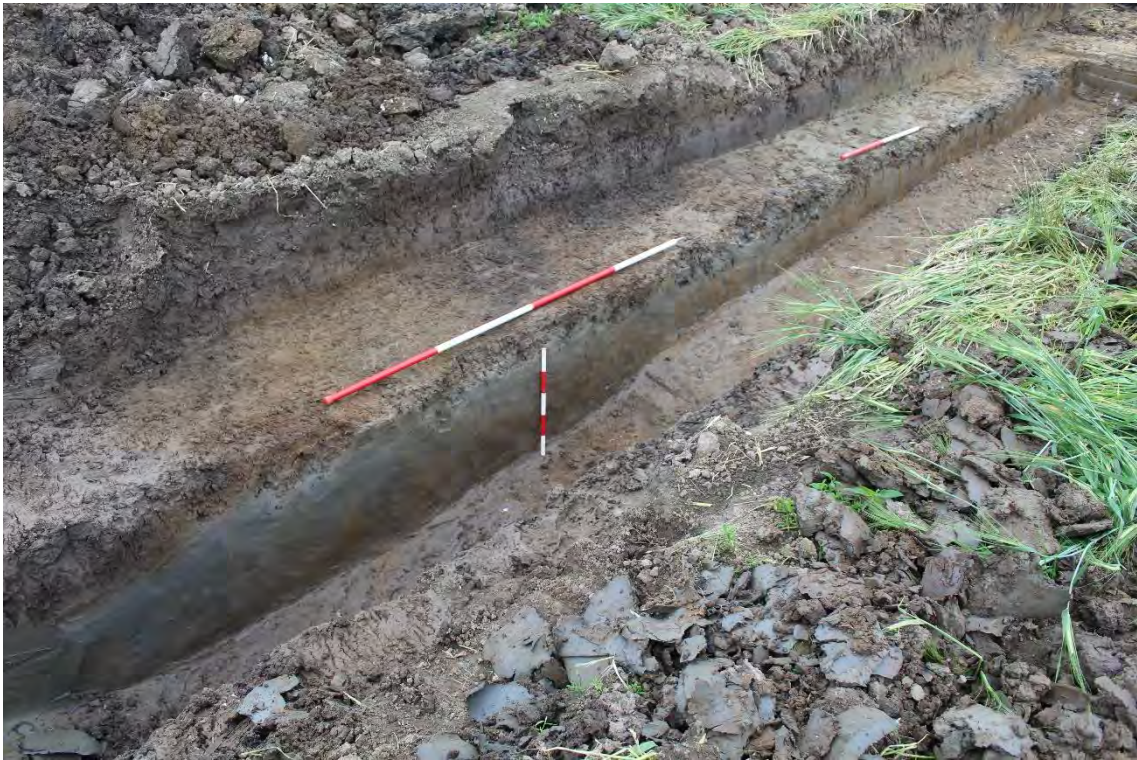
Plate 6.15: Trench 287. Pond feature in [28705] with sequence of blue-grey water lain clays and plant debris. Looking south.