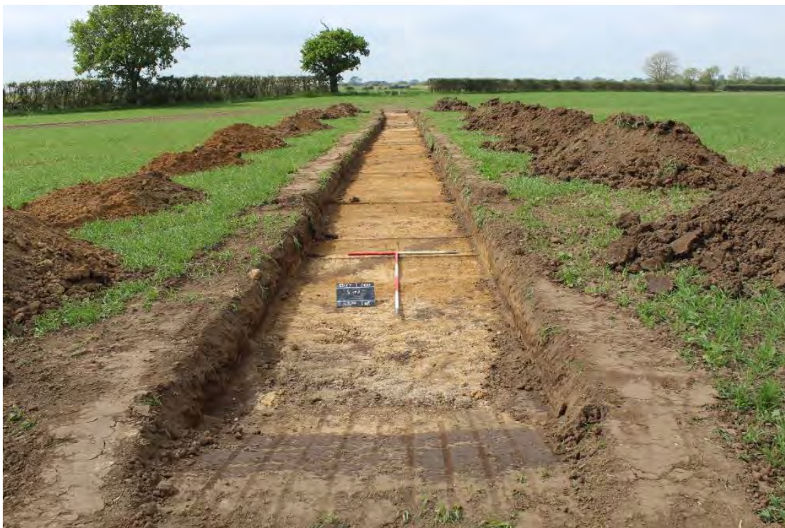
Plate 2.13 Trench 177. Overall shot showing stripped natural surface (17702), looking north-west.