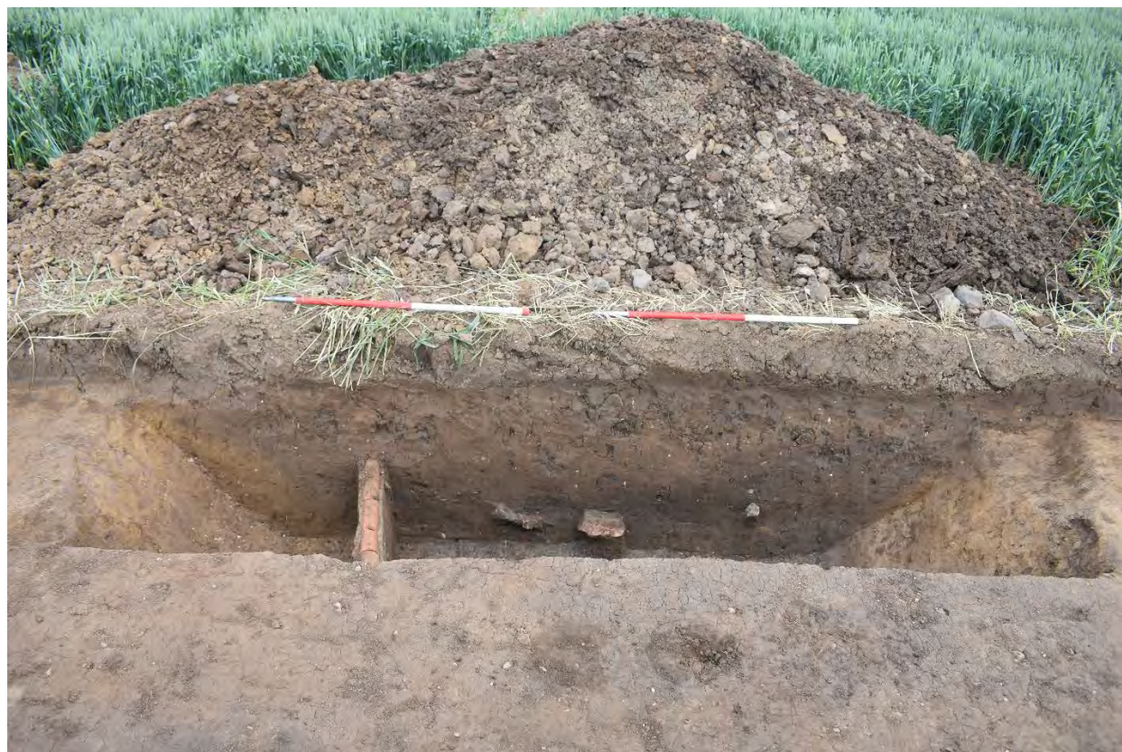
Plate 4.31: Trench 249. Ditch [24905] with recuts [24906] and [24907], looking east.