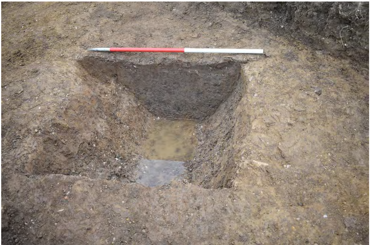
Plate 3.42: Trench 219. Ditch [21910]. Looking southeast