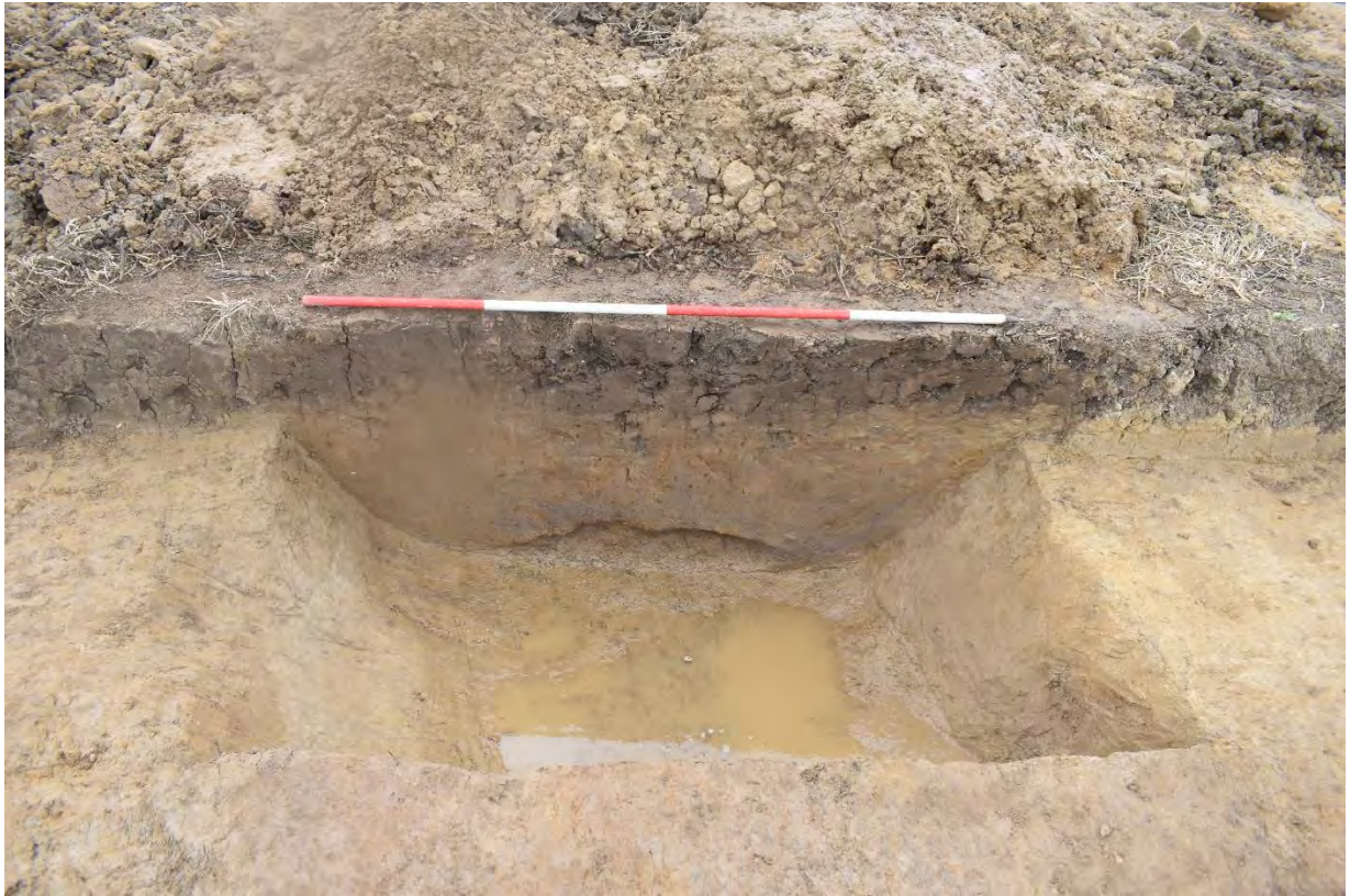
Plate 3.11: Trench 196. Possible trackway-ditch [19611]. Looking northwest.