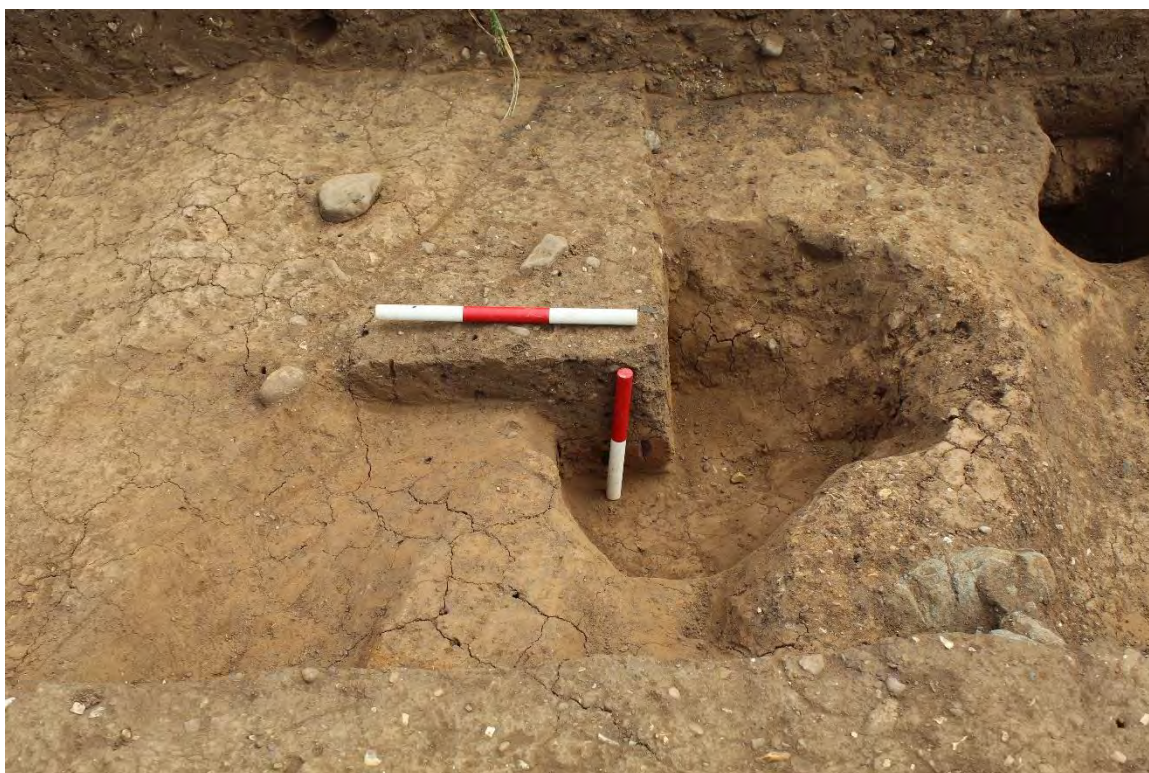
Plate 5.14 Trench 269. Posthole [26913] truncated along its northern edge by gully [26916].