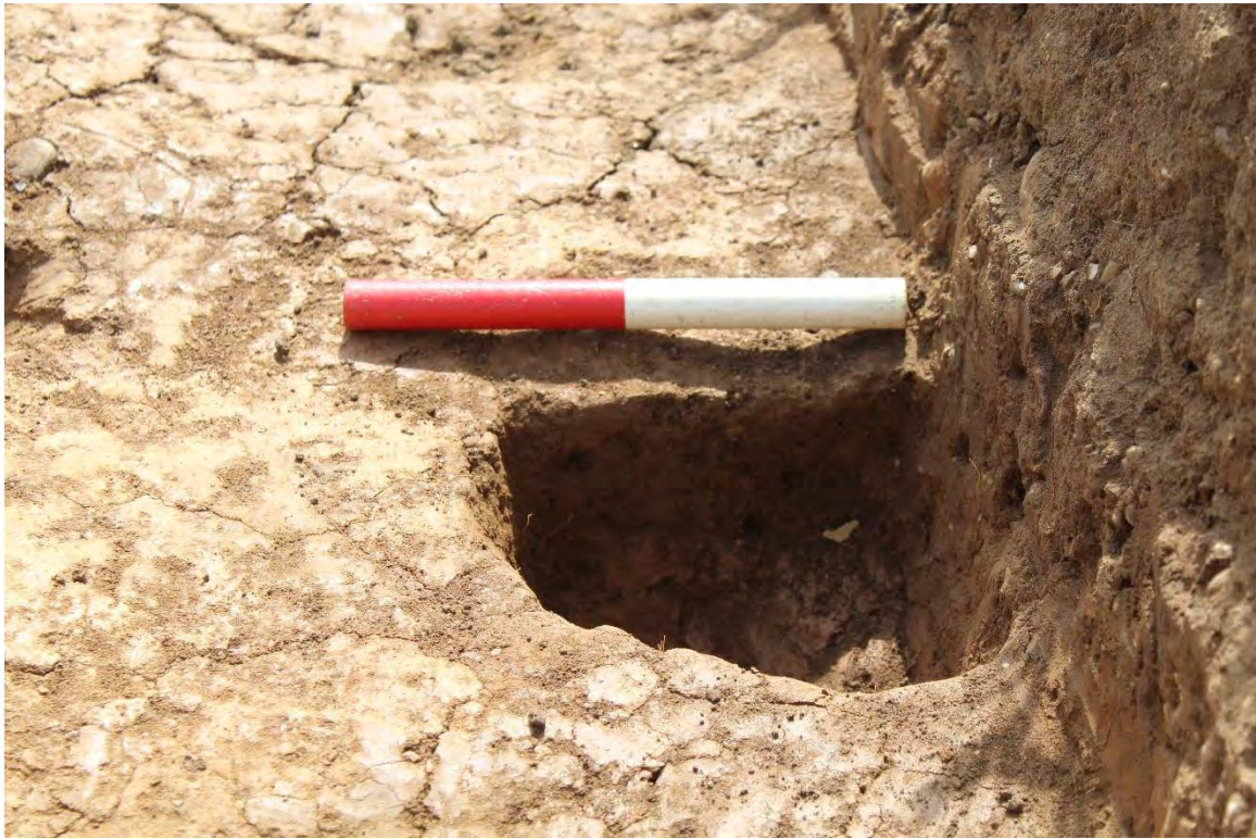
Plate 5.7 Trench 269. Northwest-facing section of stakehole [26934].