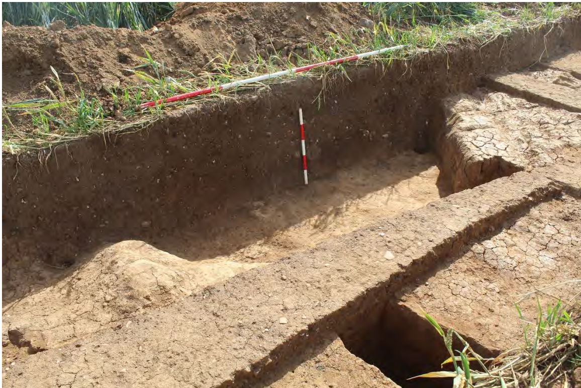
Plate 5.8 Trench 269. Southeast-facing section of extraction pits [26941] and [26942].