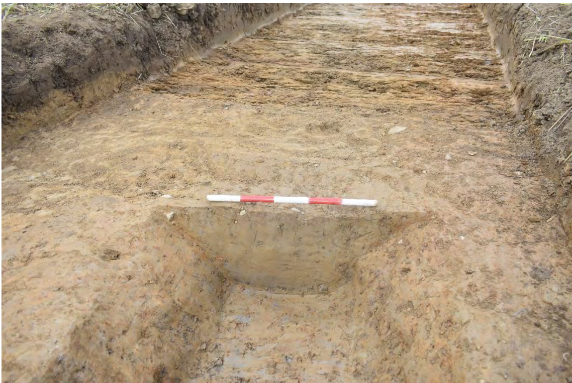
Plate 1.4 Trench 103. Northeast-facing section of gully [10303], looking southwest.