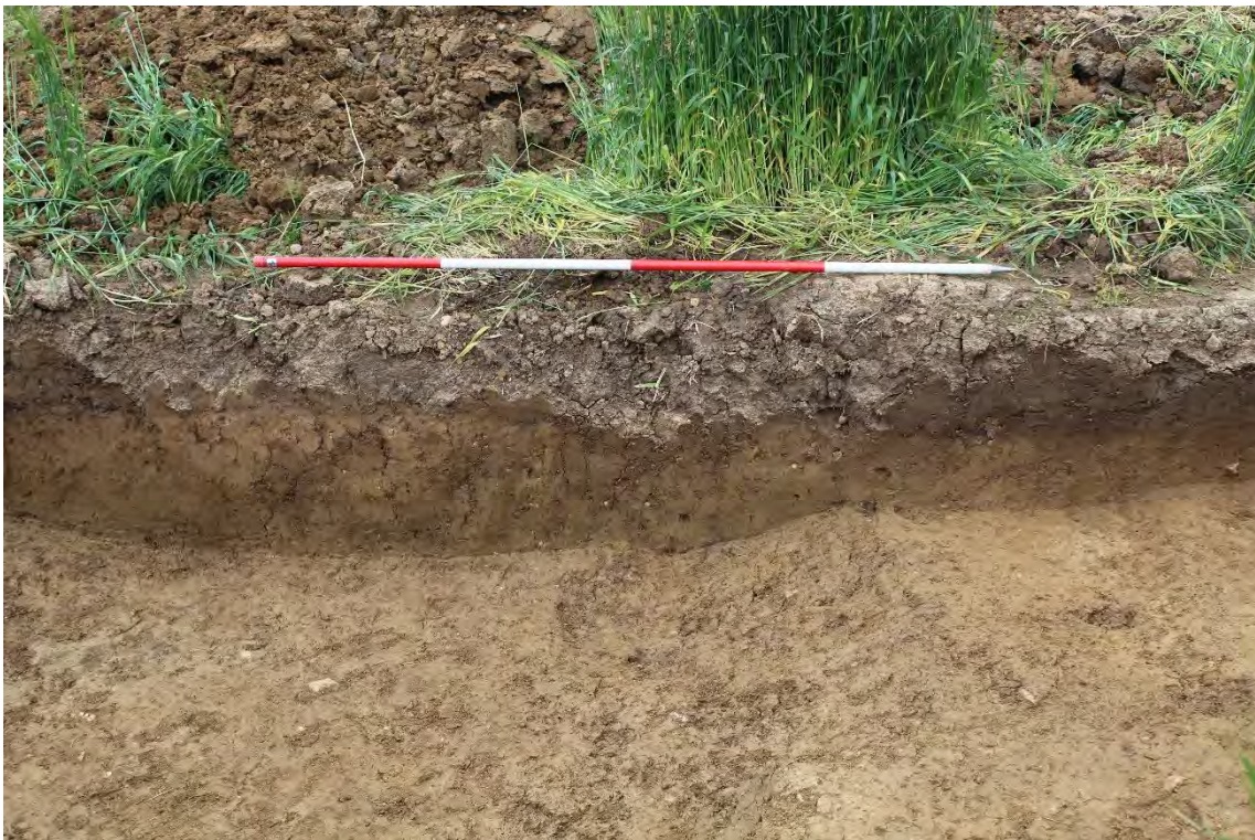
Plate 6.2: Trench 285. Deposit sequence at the southwest end of Trench 285. Looking northwest.