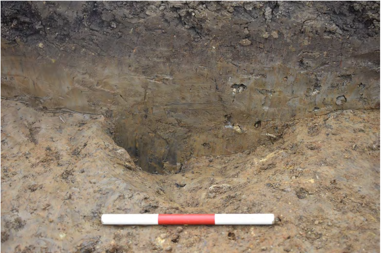
Plate 3.19: Trench 200. Probable natural pit [20005]. Looking southwest.