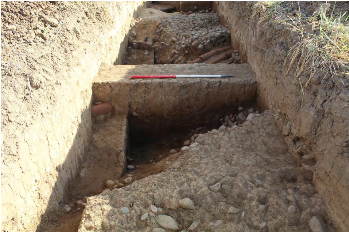
Plate 6.10: Trench 284. Detailed section of watering hole [28405]. Looking east.