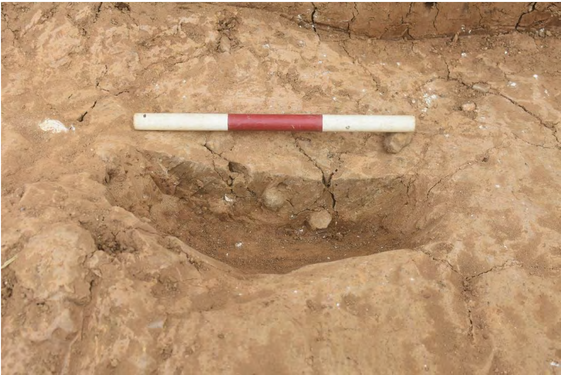
Plate 1.36 Trench 158. Southeast-facing section of posthole [15819], looking northwest.