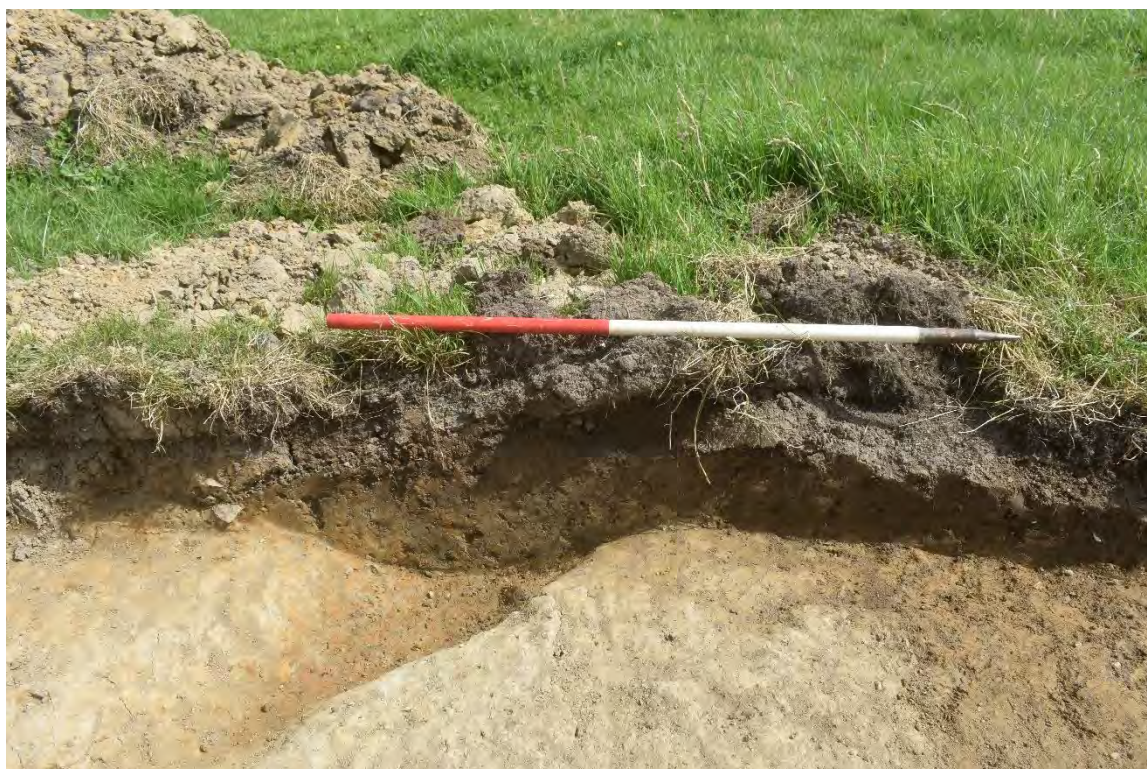
Plate 1.30 Trench 146. Northwest-facing section of gully [14602], looking southeast.