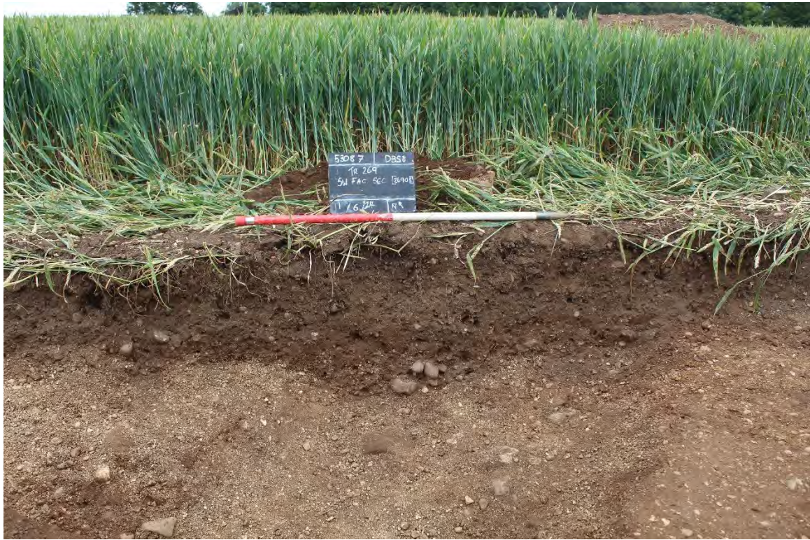
Plate 5.3 Trench 269. Ditch [26903], looking northeast.