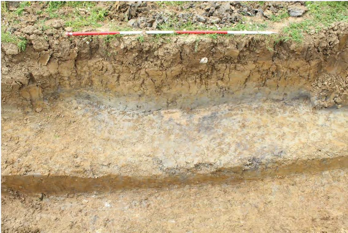
Plate 6.7: Trench 284. A sequence of water lain deposits in the southern half of Trench 284. Looking northwest.