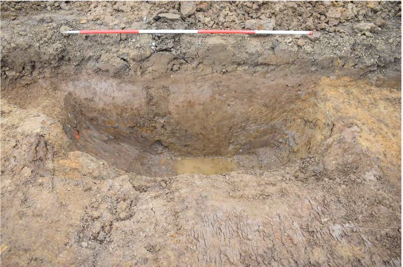
Plate 3.25: Trench 208. Ditch [20802]. Looking south.