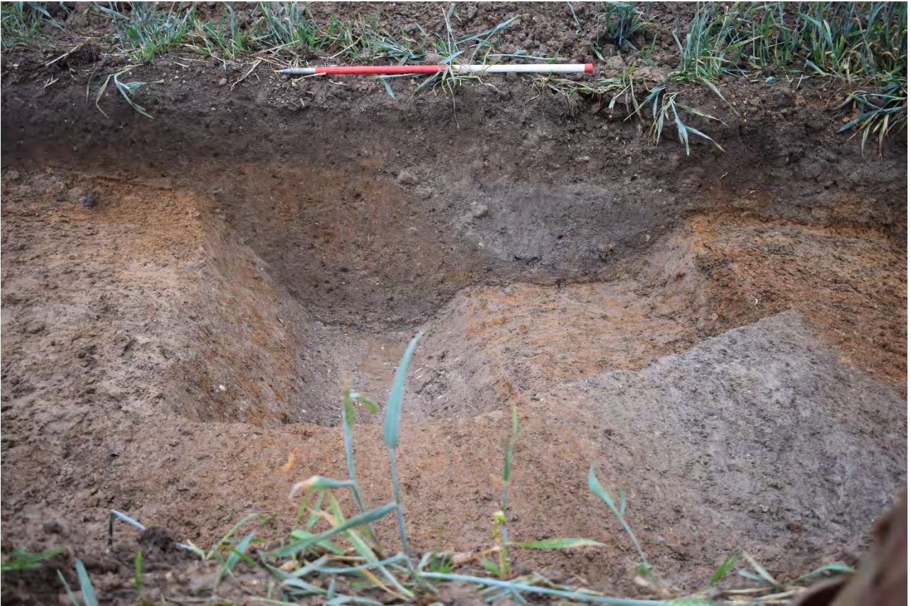
Plate 3.31: Trench 211. Ditches [21102] and [21103]. Looking east.