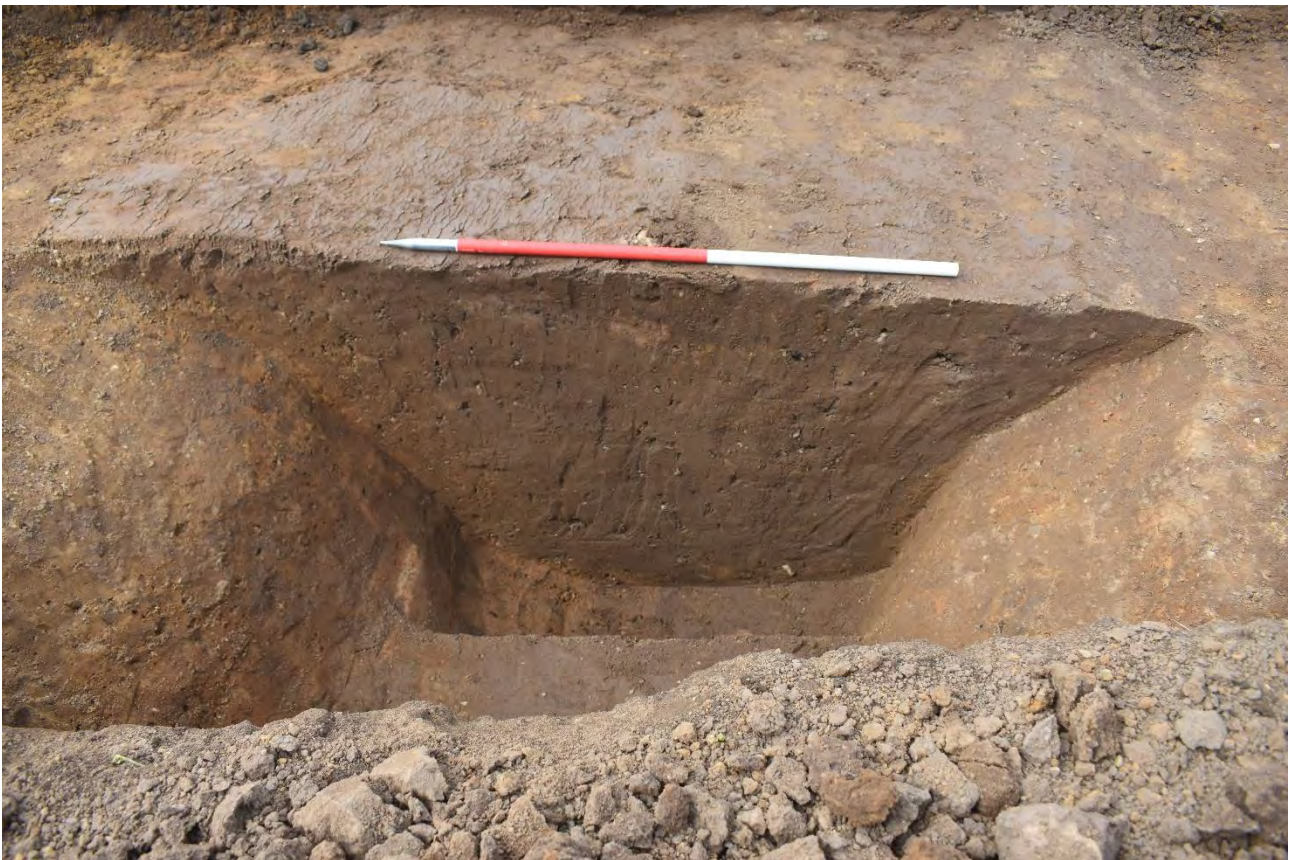
Plate 3.24: Trench 207. Ditch [20702]. Looking north.