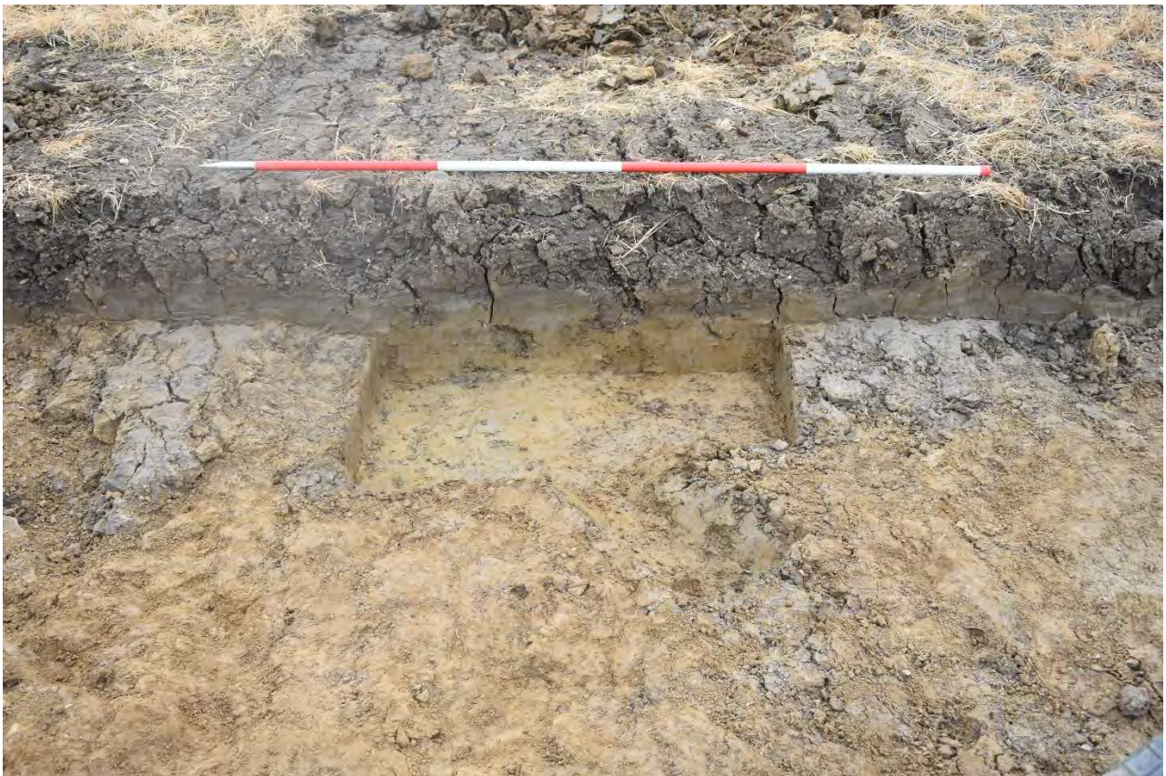
Plate 3.16: Trench 199. Natural gully [19908] and gully [19910]. Looking southwest.