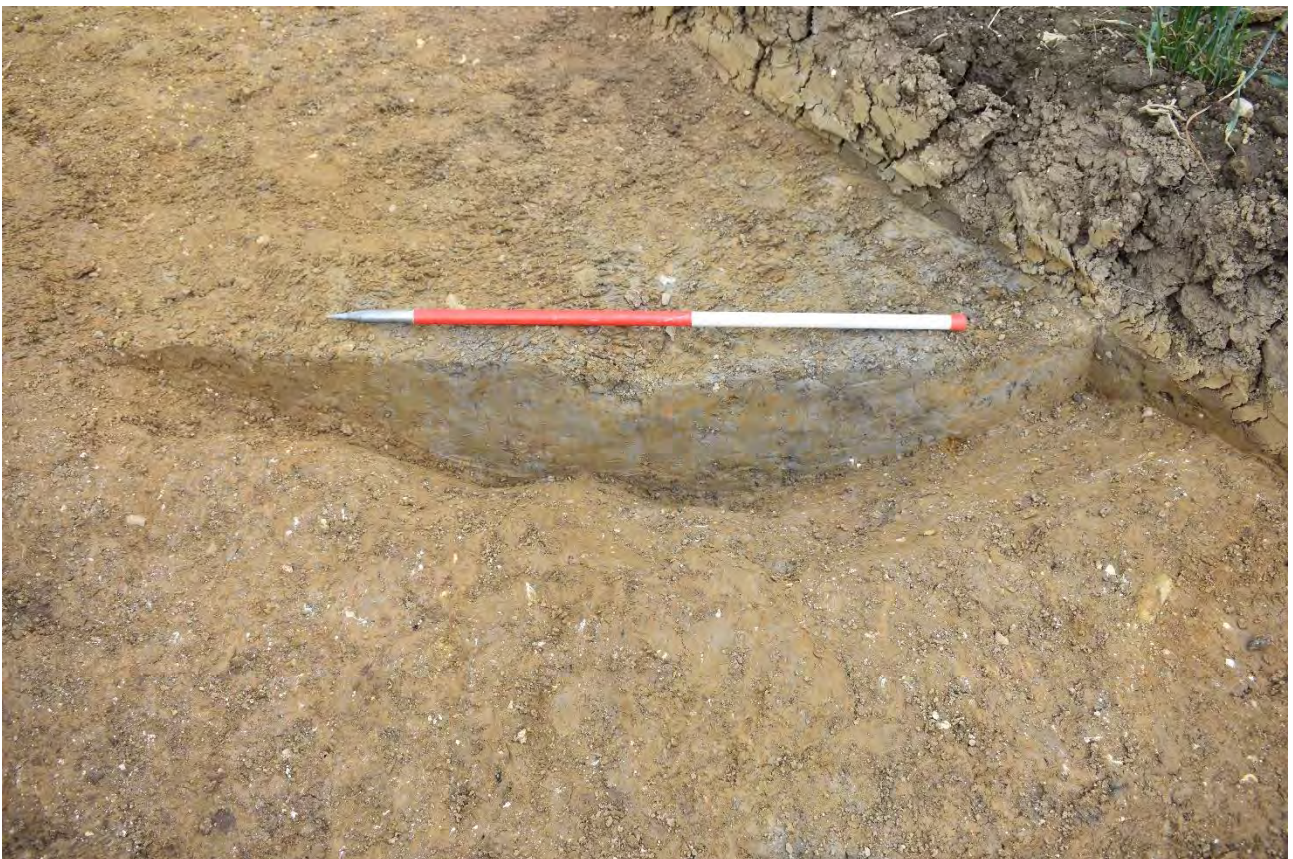
Plate 3.44: Trench 219. Possible terminus [21906]. Looking northwest.