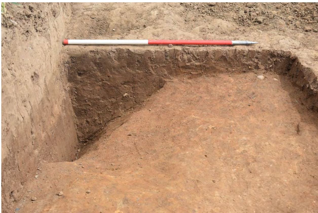
Plate 3.36: Trench 216. Ditch [21604]. Looking east.