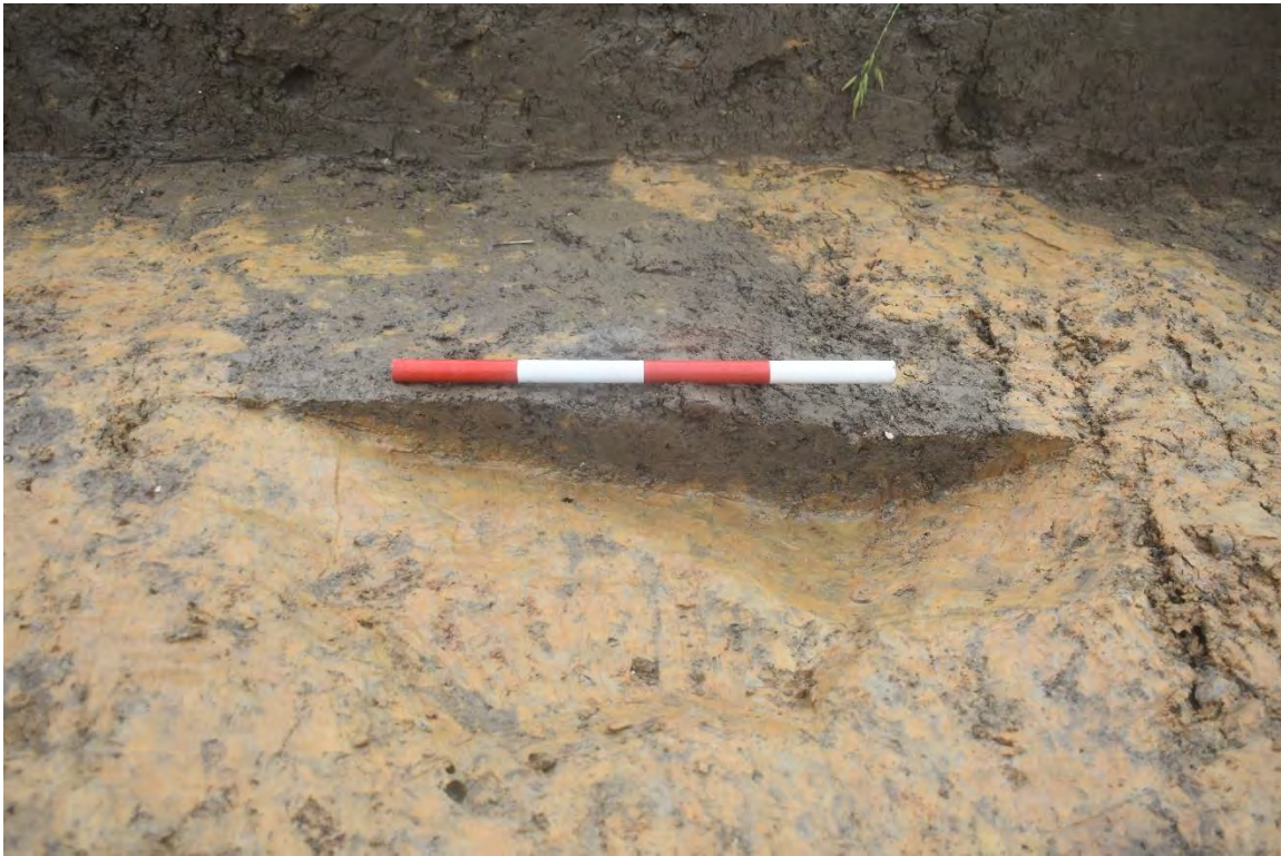
Plate 1.13 Trench 113. Southwest section of possible pit [11302], could be from a modern agricultural machine, looking northeast.