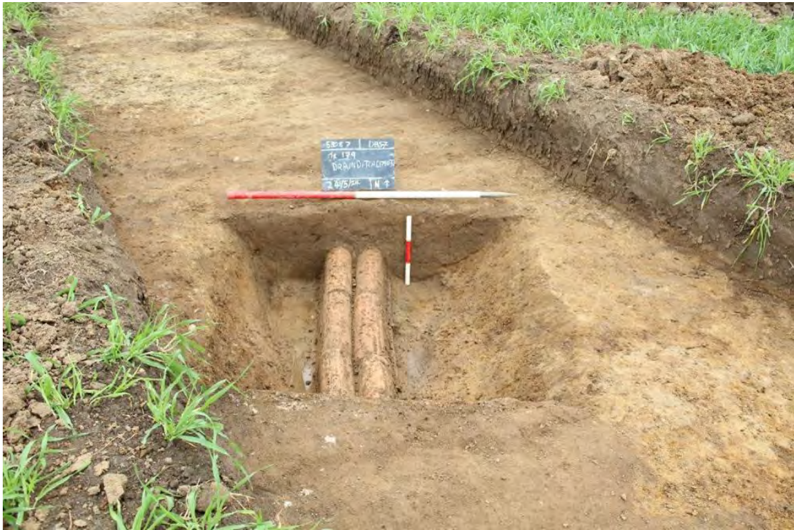
Plate 2.21 Trench 179. Drainage ditch [17903] cut into natural (17902), looking north.