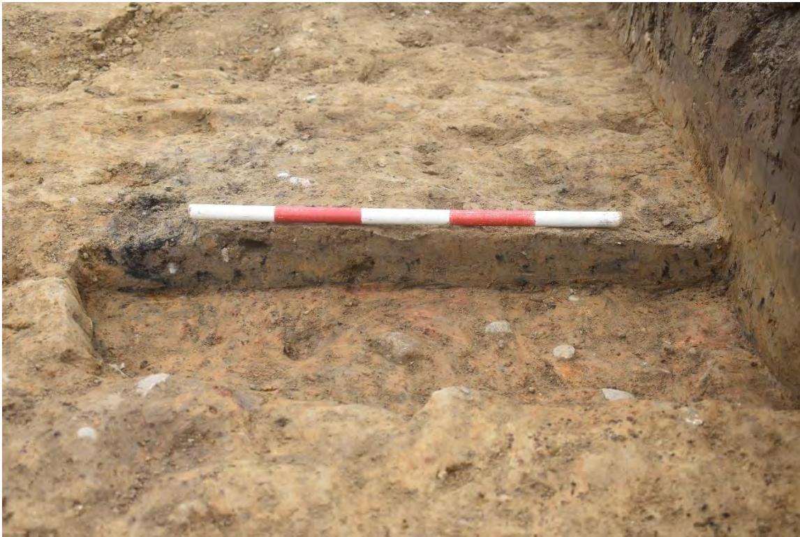
Plate 1.23 Trench 135. Southeast-facing section of pit [13502], looking northwest.