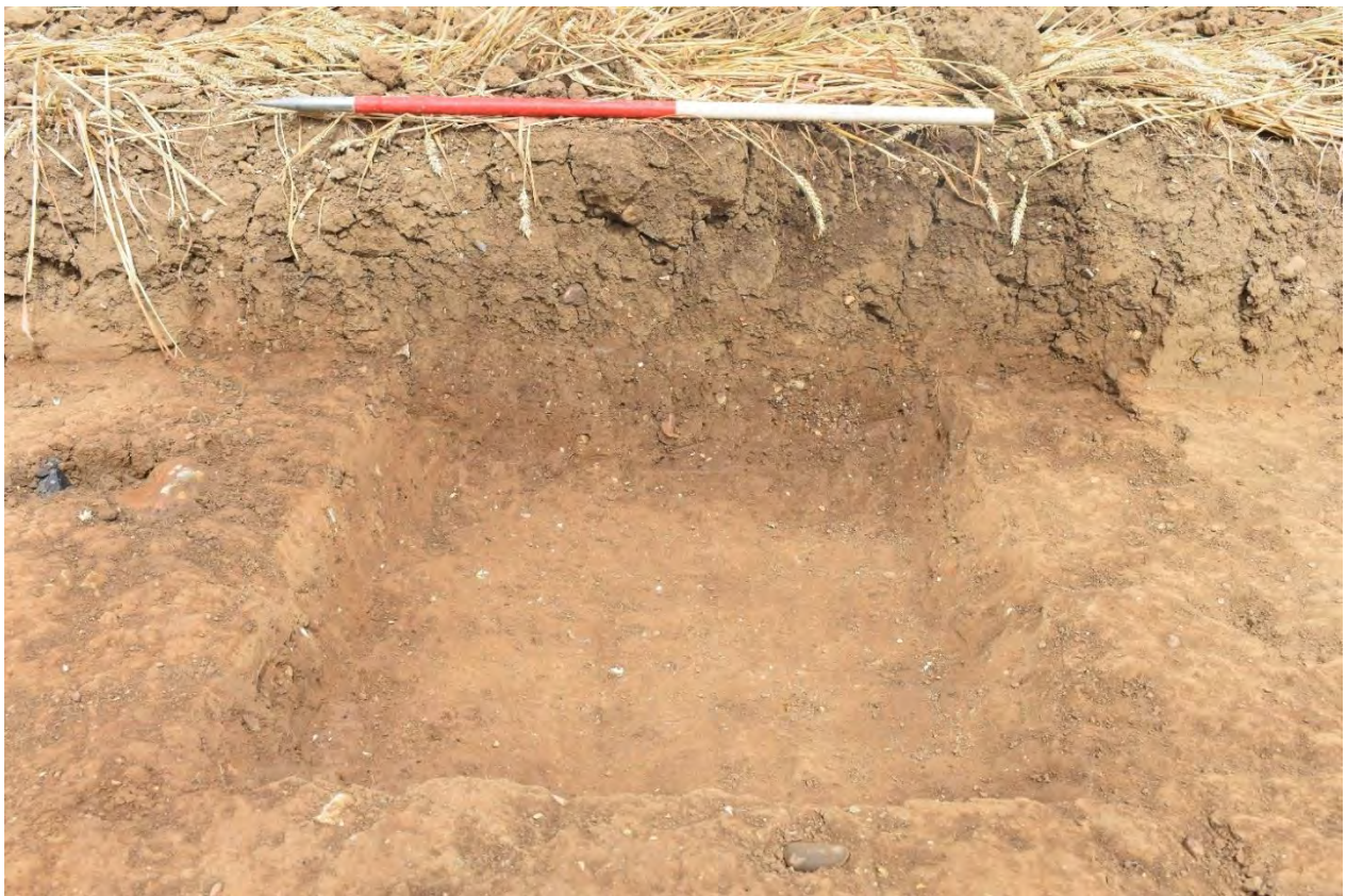
Plate 4.8: Trench 229. Gully [22903]. Looking southwest