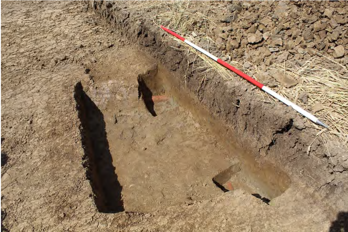
Plate 6.3: Trench 304. Furrow [30403] truncating earlier water lain deposits. Looking northeast.