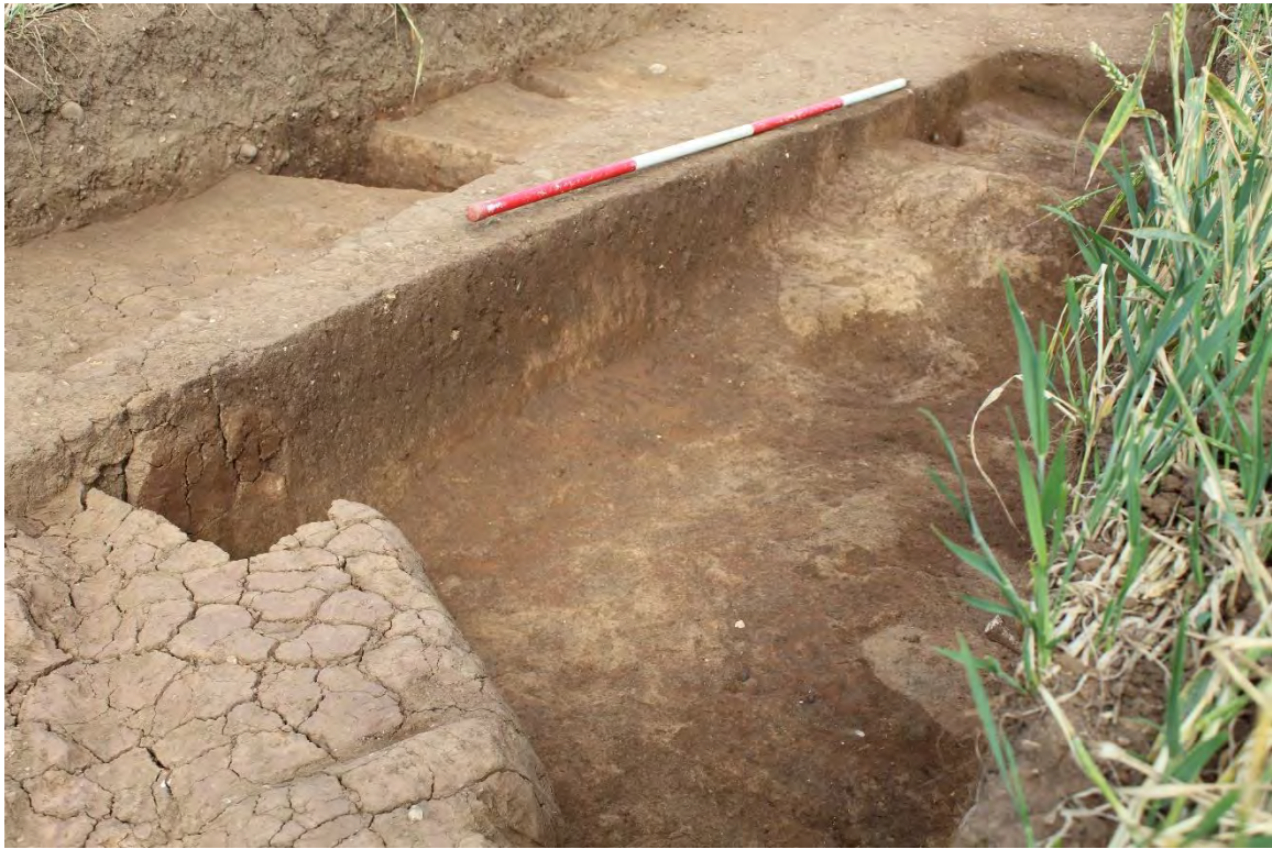
Plate 5.9 Trench 269. Section of extraction pits [26941] and [26942].