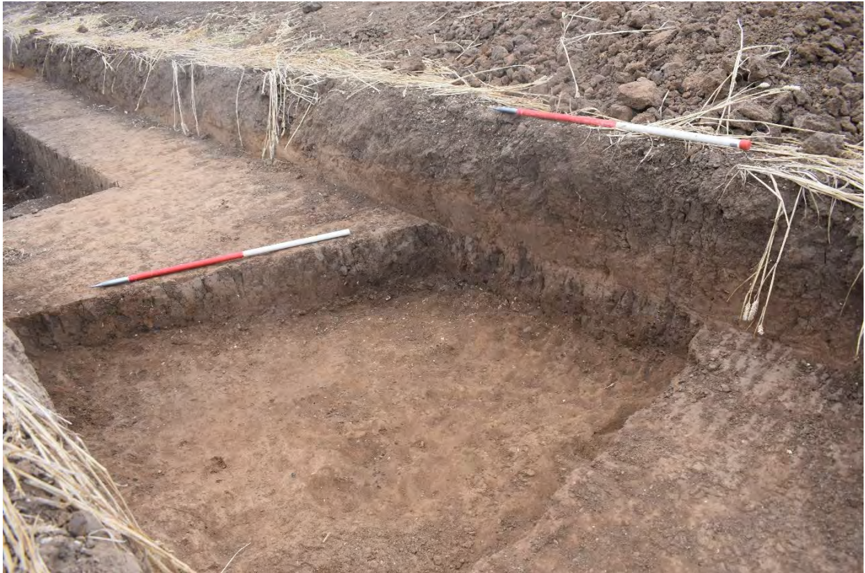
Plate 4.14: Trench 230. Group 9 and 10 cutting Group 8. Looking south.