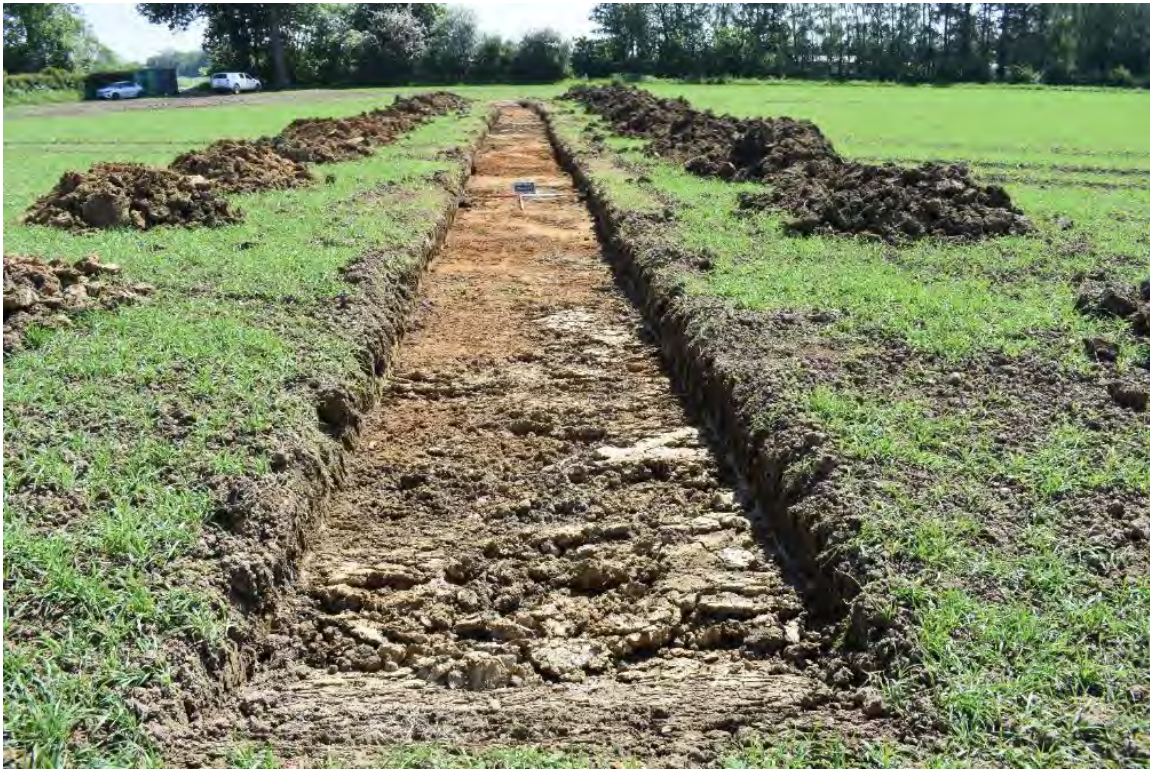
Plate 2.43 Trench 188. Overall shot showing stripped natural surface (18802). Looking south-east.