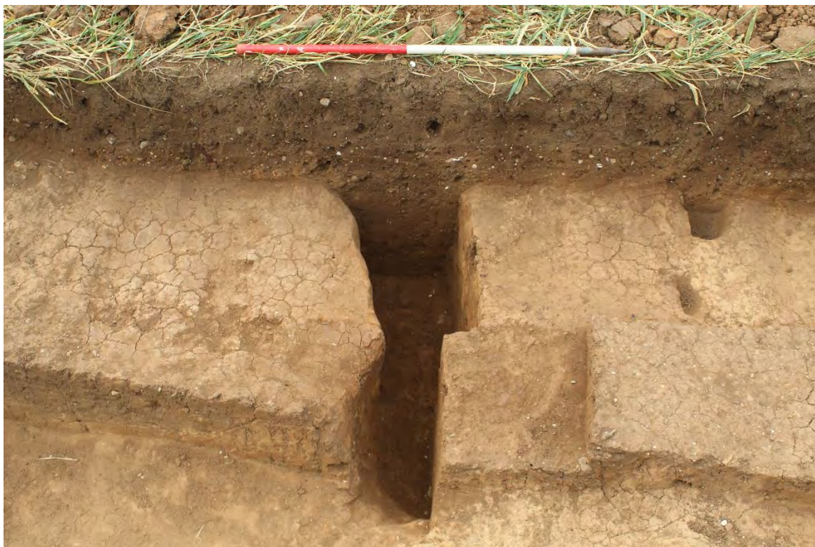
Plate 5.5 Trench 269. Terminal end of gully [29626] truncated by pit sequence [26941] and [26942].