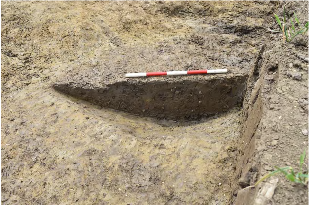
Plate 3.45: Trench 220. Terminus or pit [22009]. Looking west.