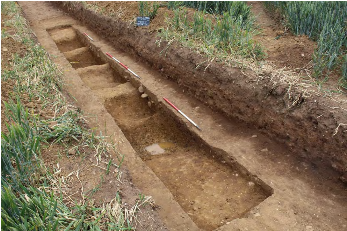
Plate 5.17 Trench 270. Overall view of parallel linear features [27015] to [27019], looking north.