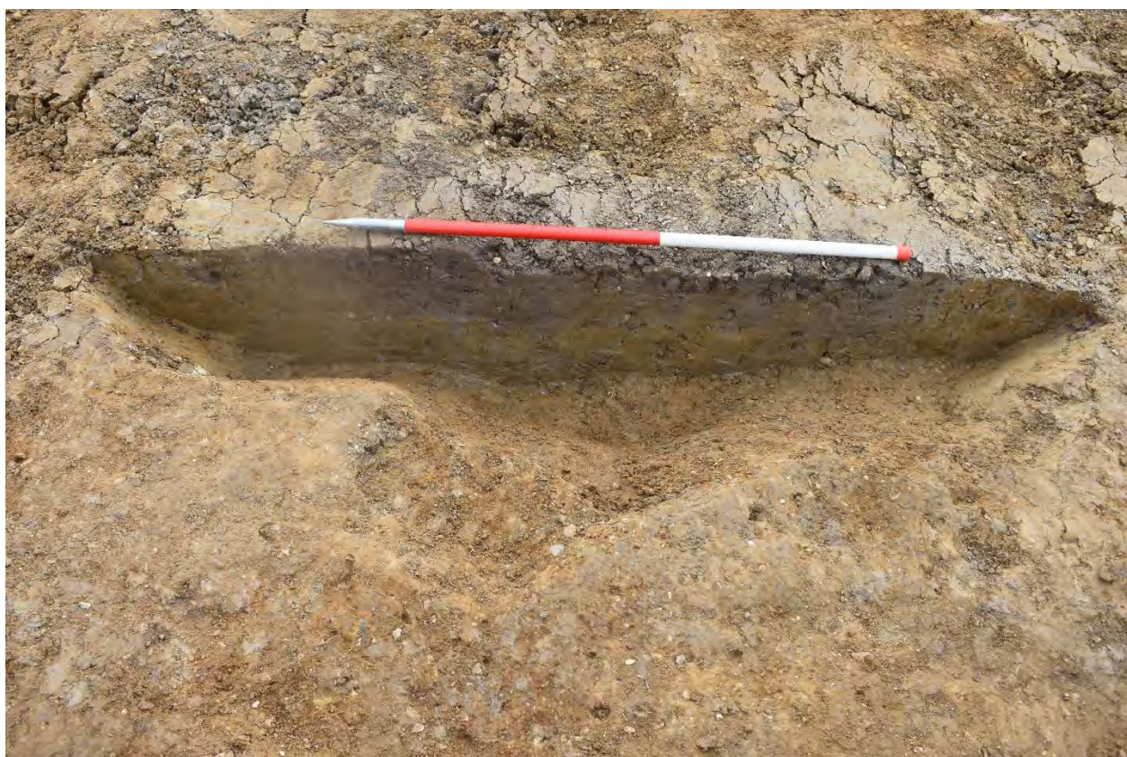
Plate 3.6: Trench 192. Pit [19218]; looking southwest.