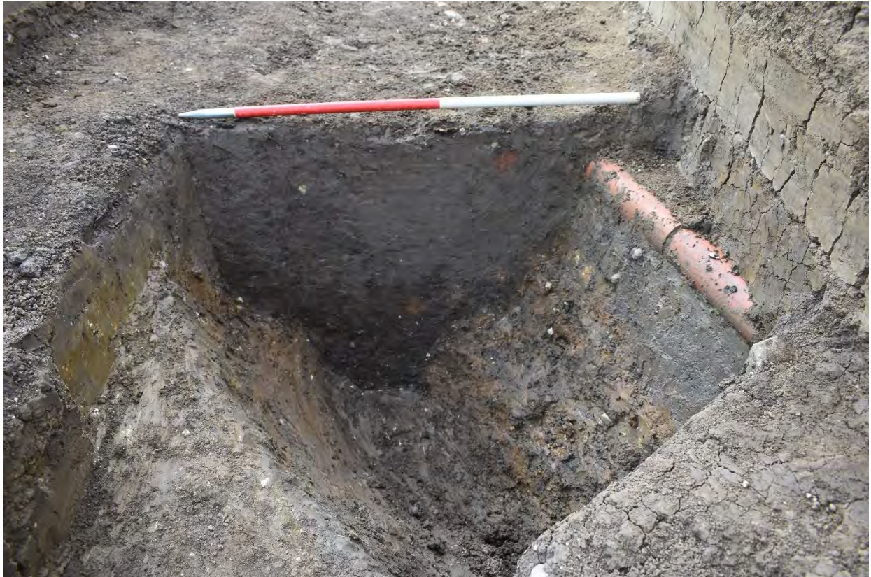
Plate 4.5: Trench 227. Ditch [22704] with later cut of drain. Looking southwest.