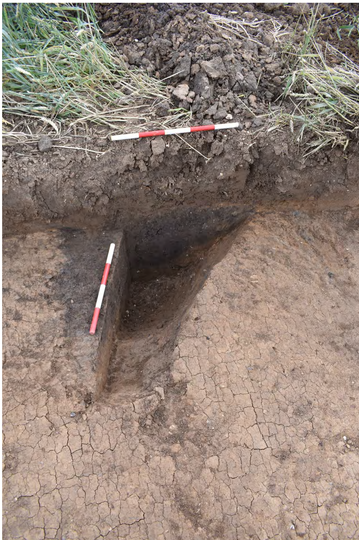
Plate 4.32: Trench 249. Pit or ditch terminus [24902], looking east.