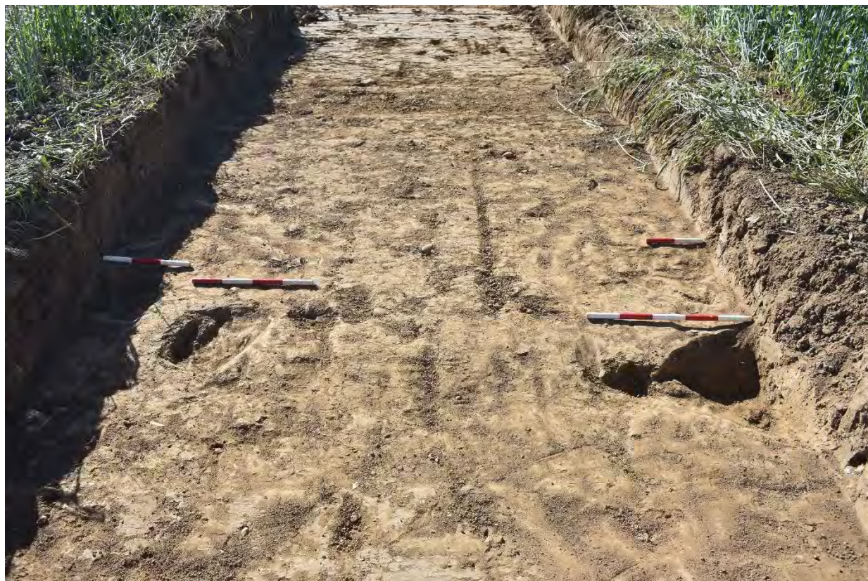
Plate 4.33: Trench 250. Plan shot of pits [25002], [25004], [25006] and [25008]. Looking west.