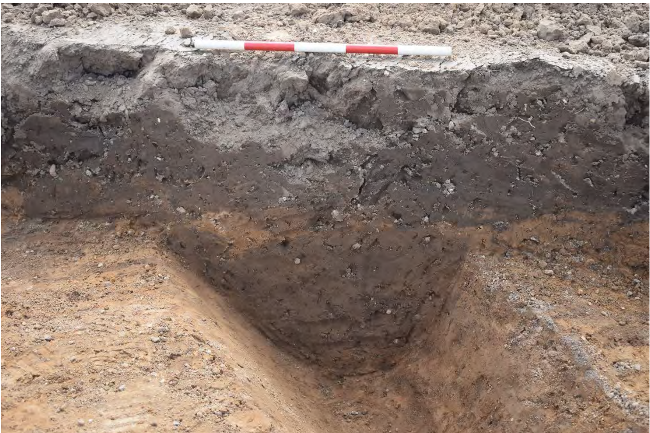
Plate 3.22: Trench 202. Gully [20202]. Looking southwest.