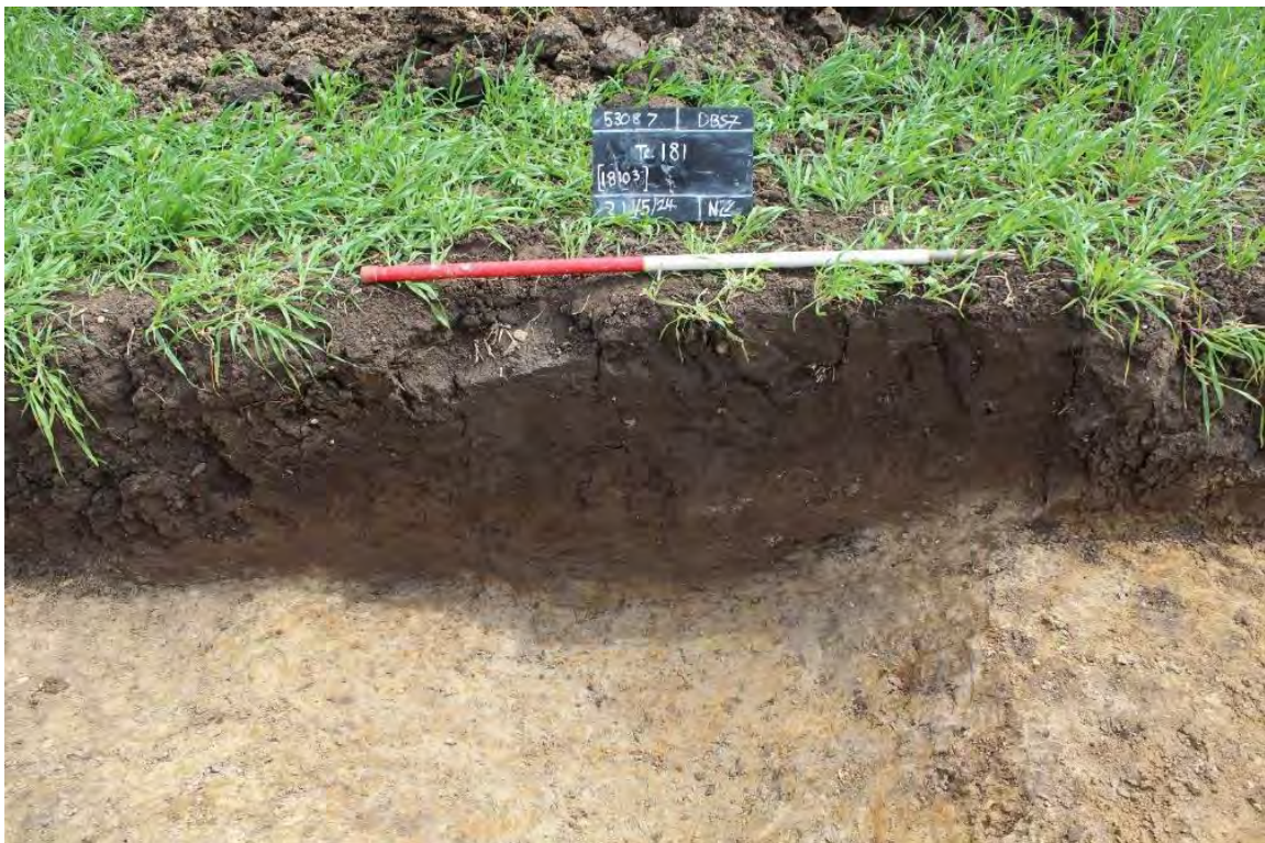
Plate 2.26 Trench 181. Shallow ditch [18103], looking south-east.