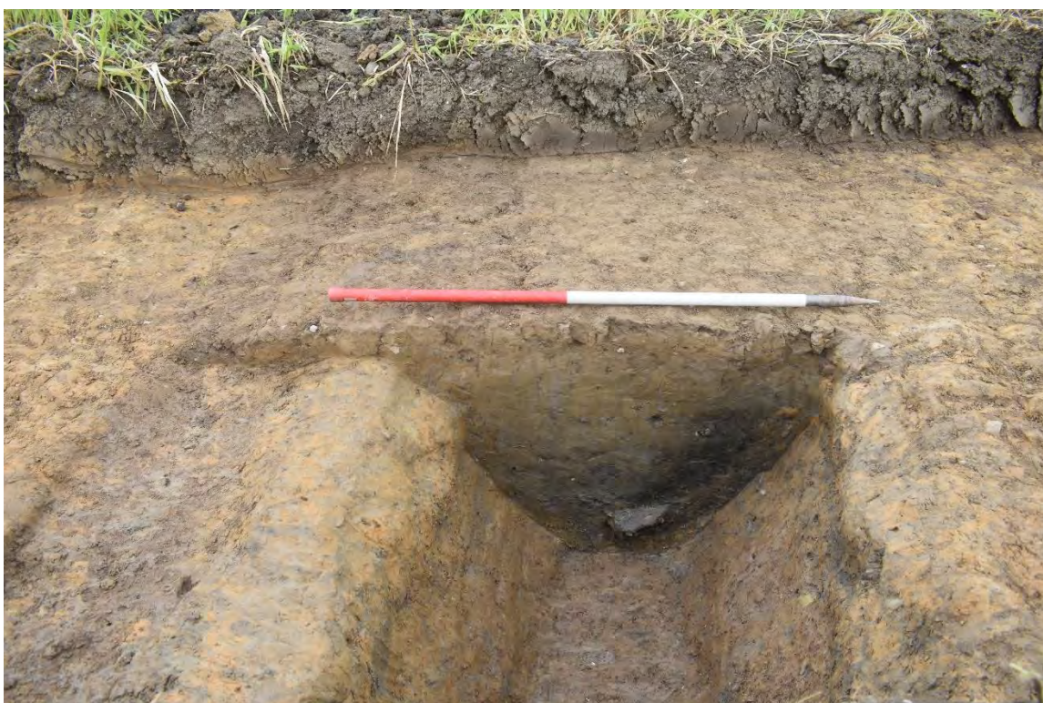
Plate 1.6 Trench 106. West-facing section of ditch [10603] and recuts [10605] and [10609], looking east.