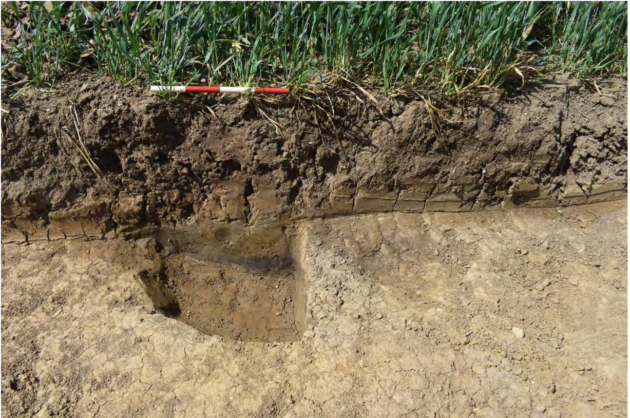
Plate 3.39: Trench 218. Pit [21802]. Looking northwest.