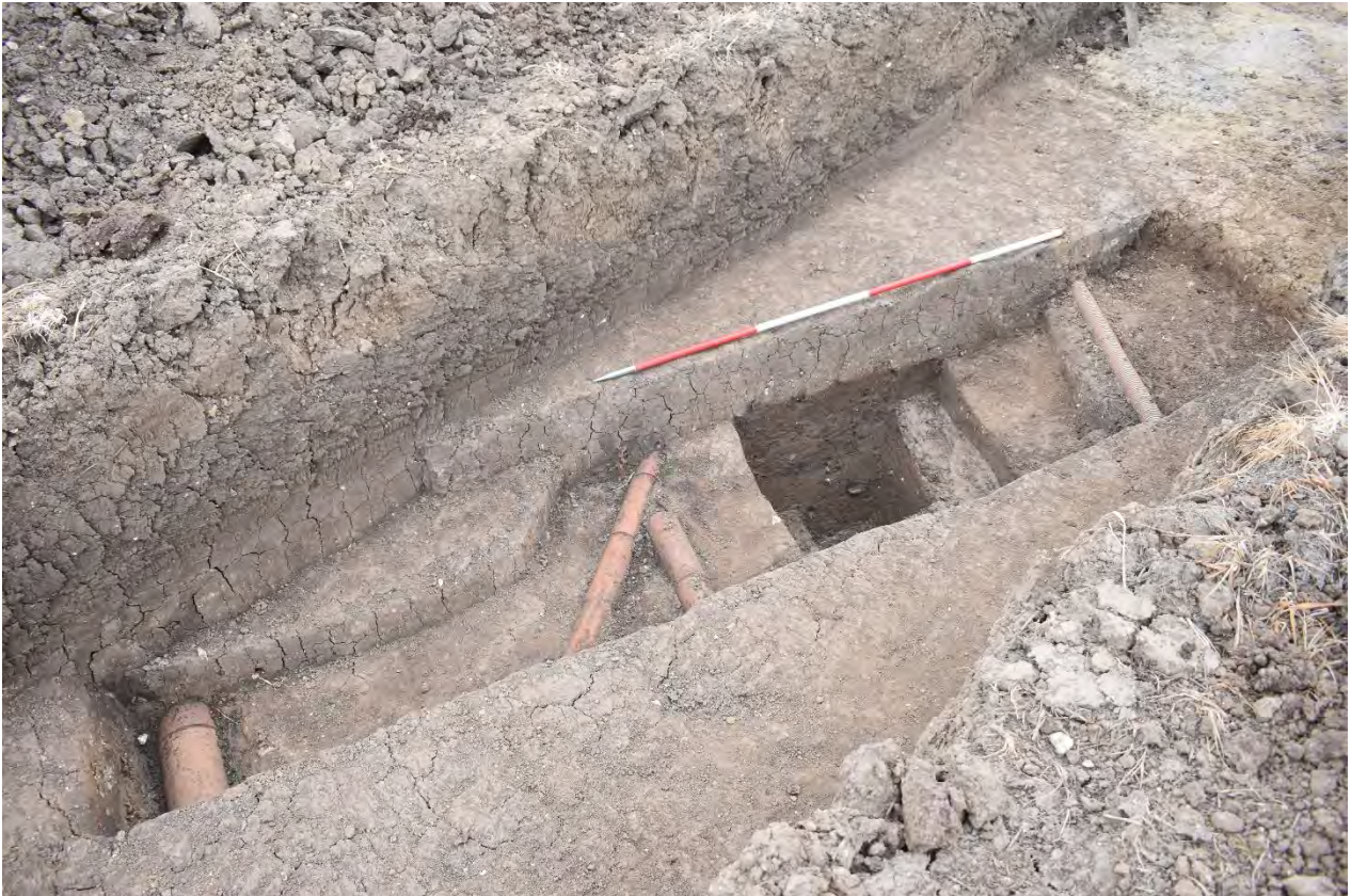
Plate 3.21: Trench 201. Ditch [20103] with later truncation from field drains. Looking north.