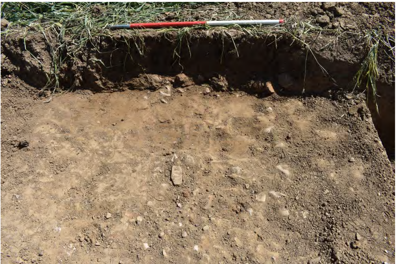
Plate 4.29: Trench 247. Trackway [24711], looking east.