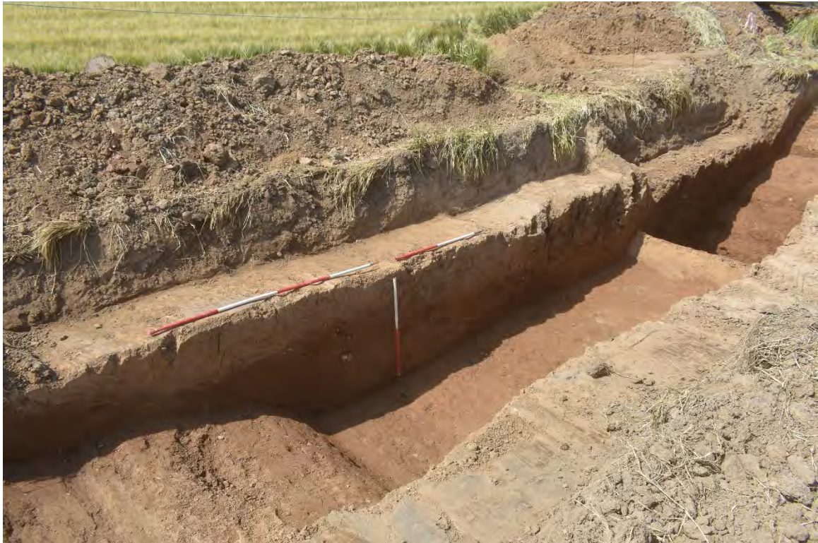
Plate 1.41 Trench 160. Northeast-facing section of natural hollow [16003], looking southwest.