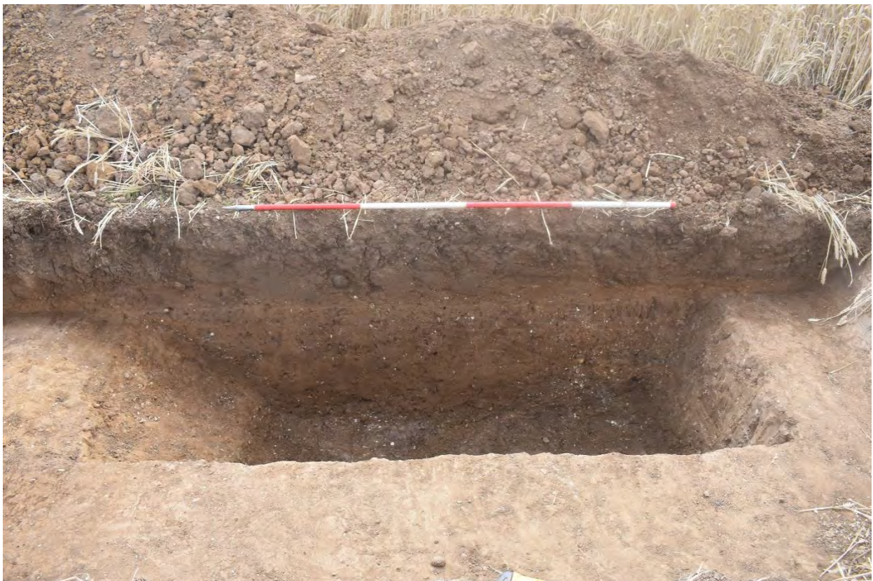
Plate 4.15: Trench 230. Ditch [23042], looking southwest.