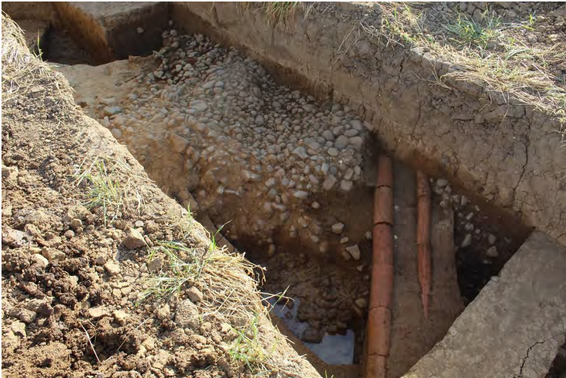
Plate 6.11: Trench 284. Detailed view of stone revetment {28407} at the edge of watering hole [28405]. Looking southeast.