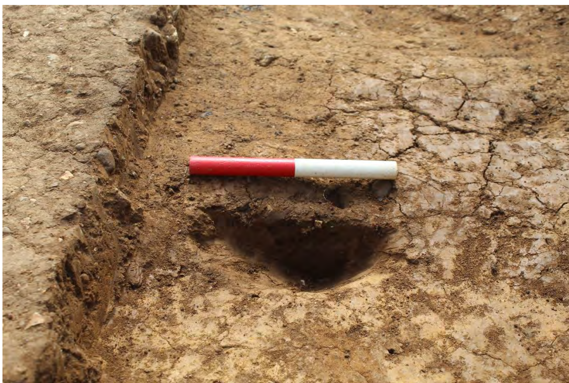
Plate 5.6 Trench 269. Northwest-facing section of stakehole [26936].