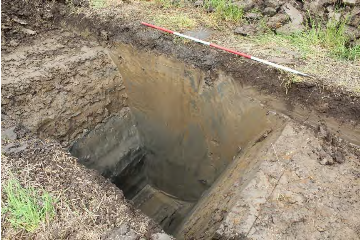
Plate 2.5 Trench 173. Test pit at south-western end of trench showing sequence of deposits (17306) – (17311), looking north.