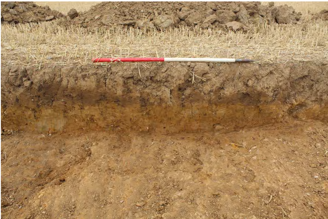
Plate 6.4: Trench 306. A sterile blue-grey clay deposit (30604) and an orange-brown clay deposit (30603) in the southern half of Trench 306. Looking west.