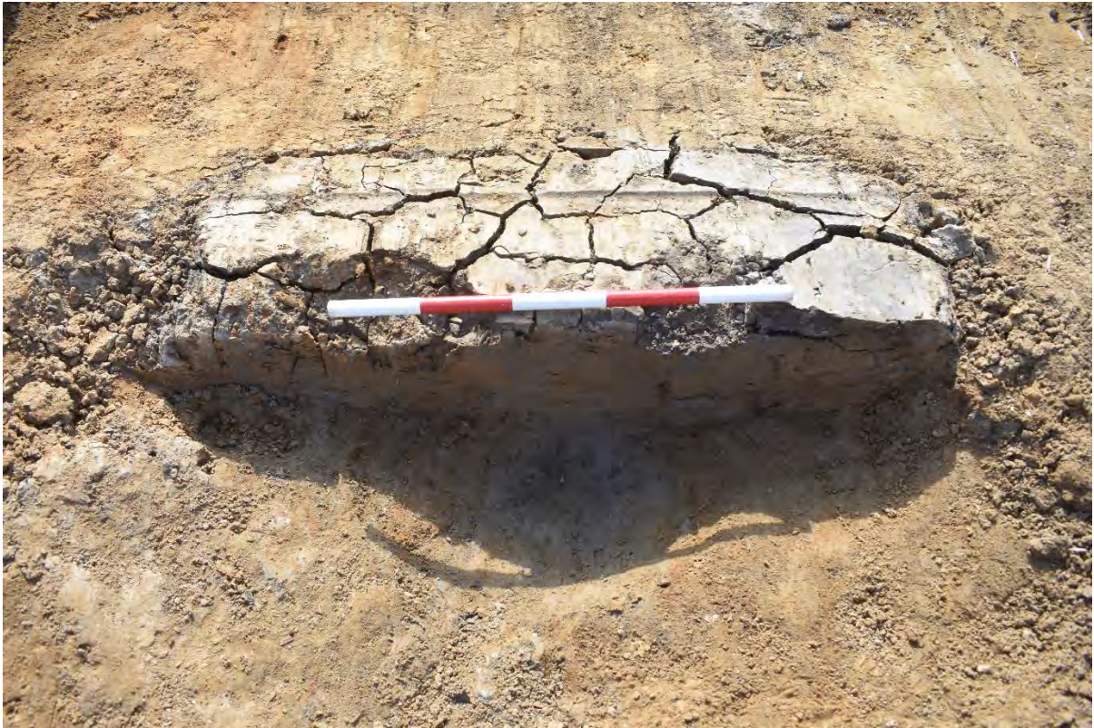
Plate 3.9: Trench 194. Possible natural pit [19407]. Looking southwest.