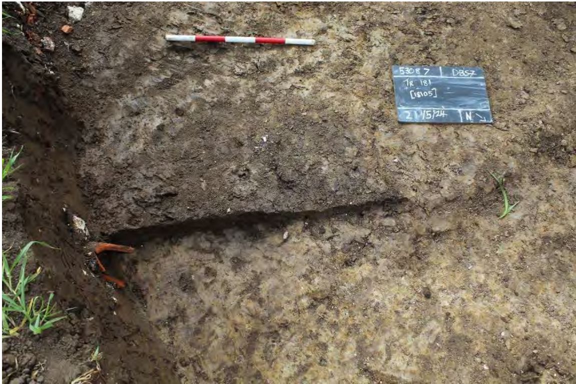
Plate 2.27 Trench 181. Shallow pit [18105], looking south-west.