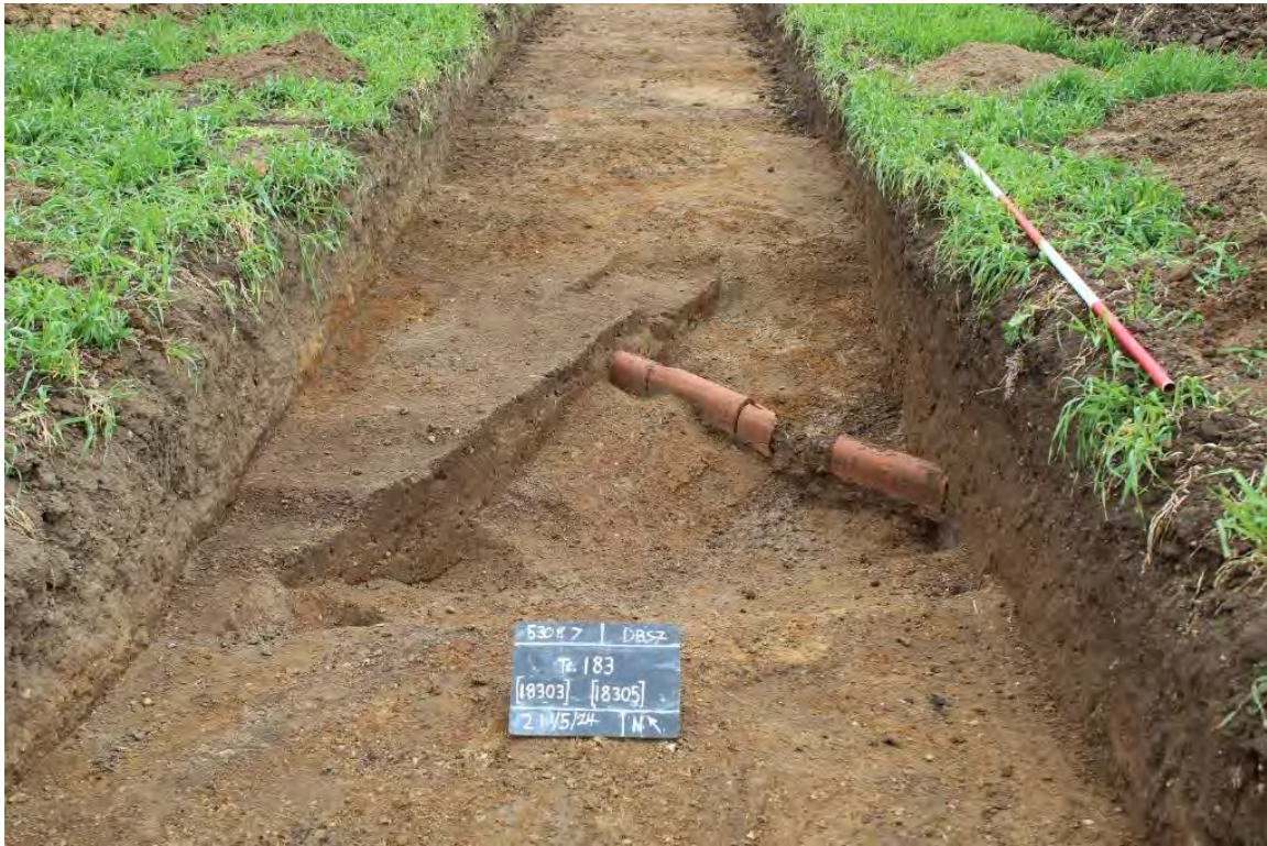
Plate 2.33 Trench 183. Ditch [18303] and field drain [18305] cutting natural (18202), looking north-east.