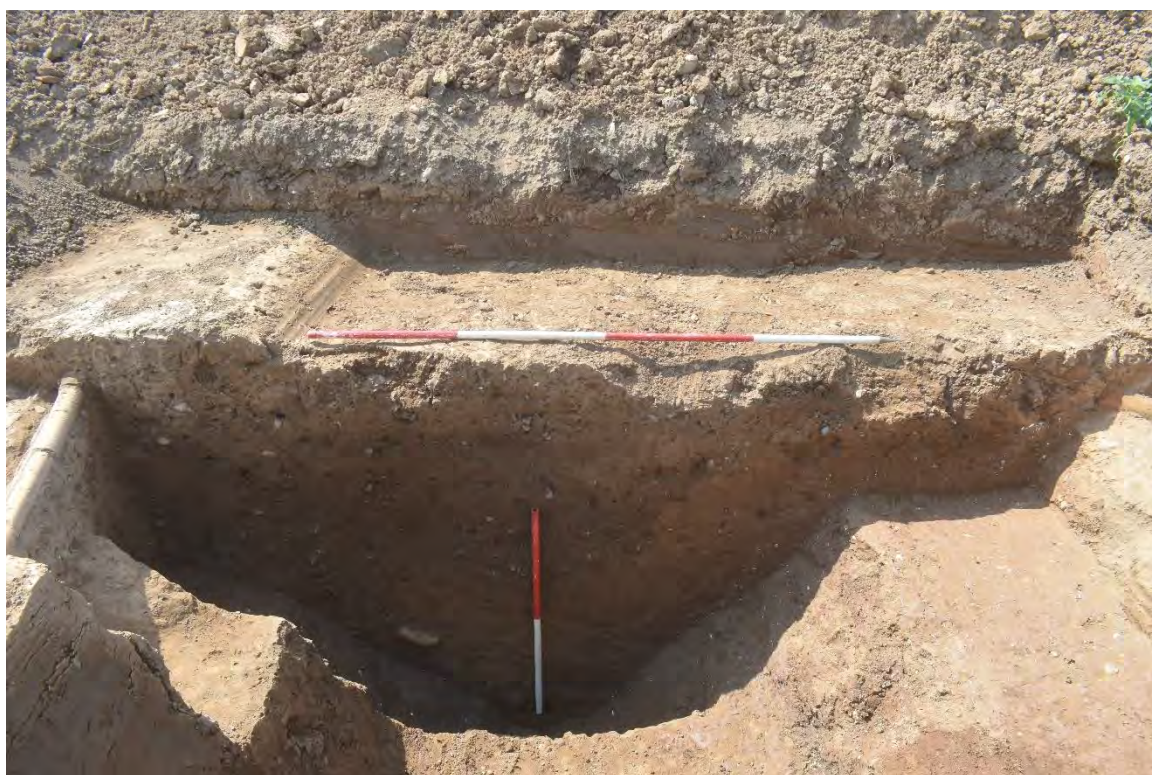
Plate 1.34 Trench 155. Northeast-facing section of ditch [15518] with recuts [15506], [15509] and [15516], looking southwest.