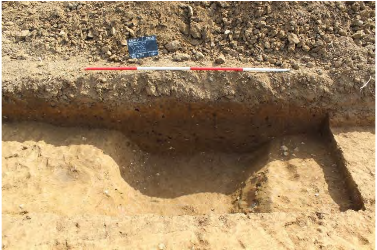
Plate 5.25 Trench 275. Ditches [27504] and [27509]. Facing east.