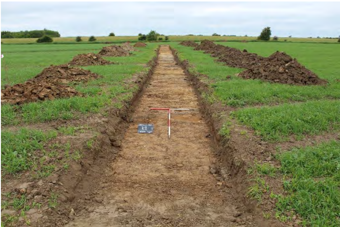
Plate 2.8 Trench 175. Overall shot showing natural stripped surface (17501), looking west.