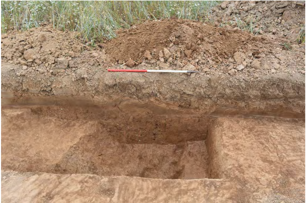
Plate 1.49 Trench 168. North-facing section of ditch [16804], looking south.