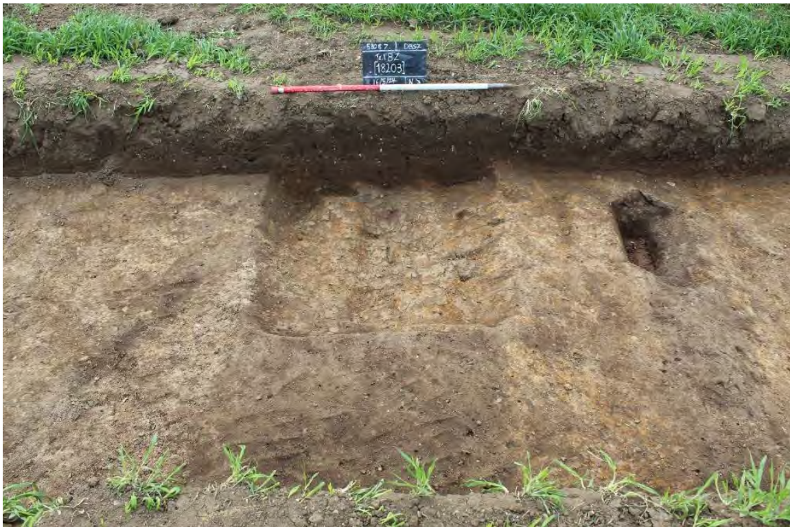
Plate 2.32 Trench 182. Ditch [18203] cutting natural deposit (18202), looking south-west.