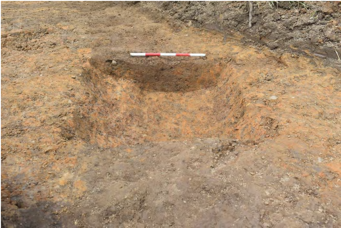
Plate 1.19 Trench 131. South-facing section of gully [13103], looking north.