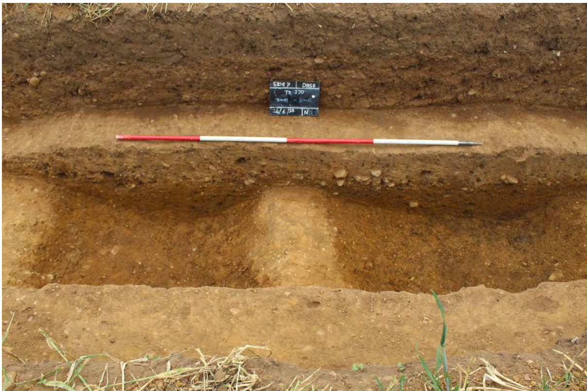
Plate 5.18 Trench 270. Ditches [27015] and [27016], looking northeast.