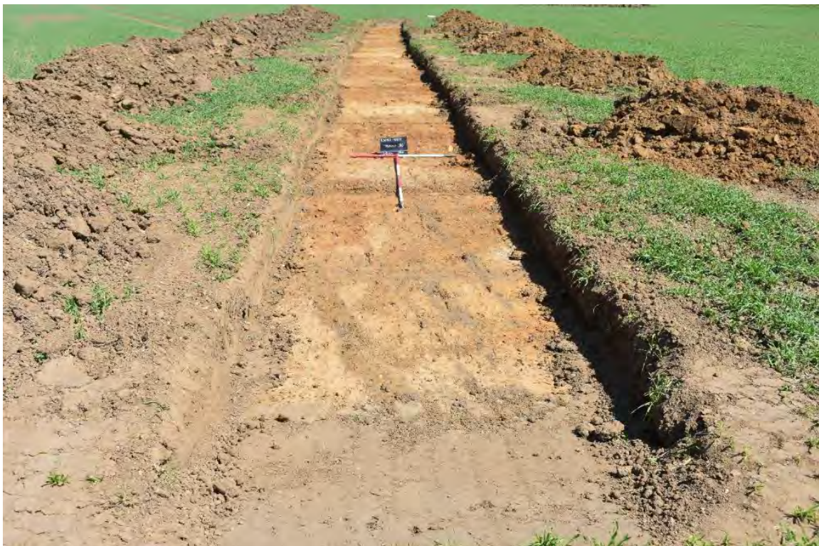
Plate 2.40 Trench 186. Overall shot showing striped natural surface (18602), looking east.