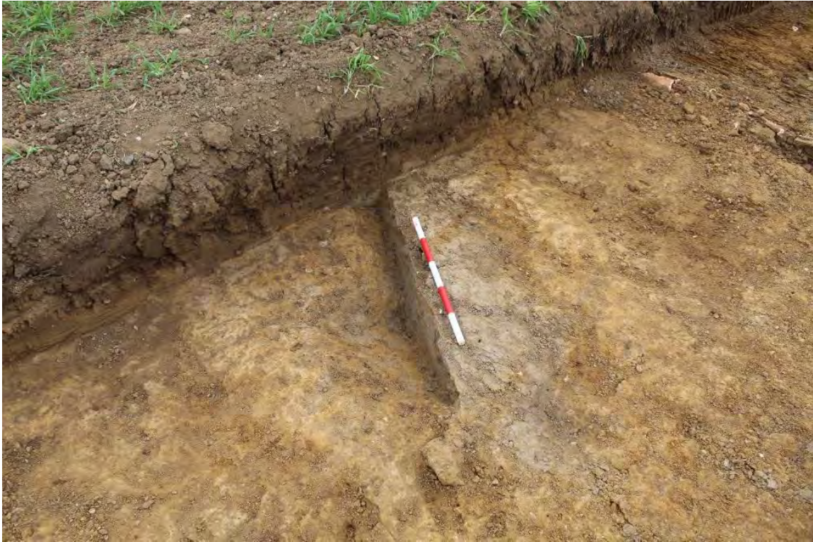
Plate 2.41 Trench 186. Natural hollow [18603], looking south-west.