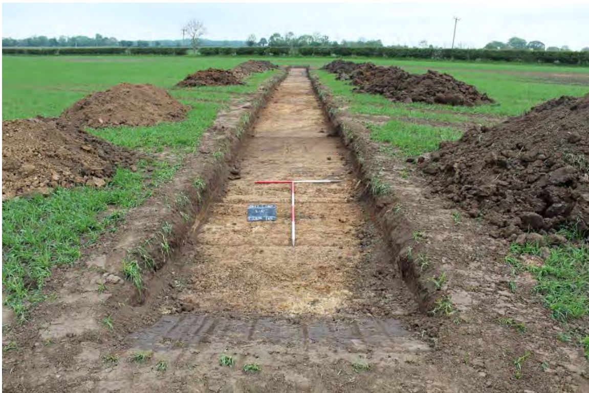
Plate 2.22 Trench 180. Overall shot showing stripped natural surface (18002), looking north-east.