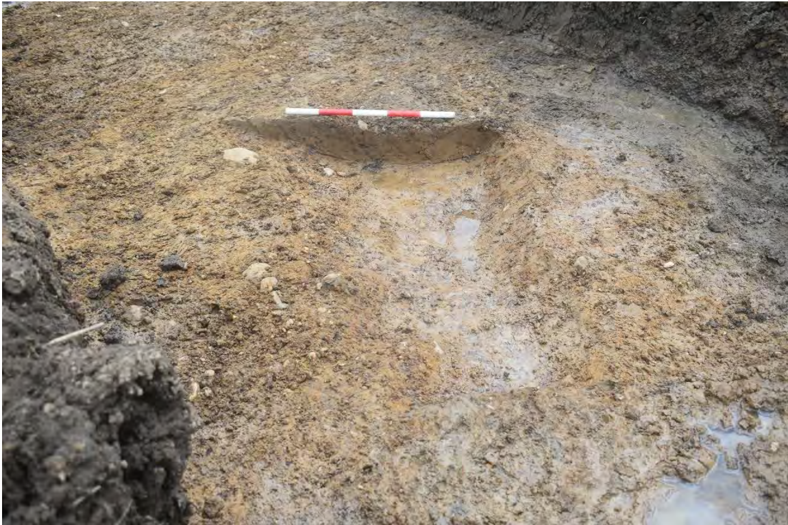
Plate 1.15 Trench 121. Northwest-facing section of gully [12102], looking southeast.