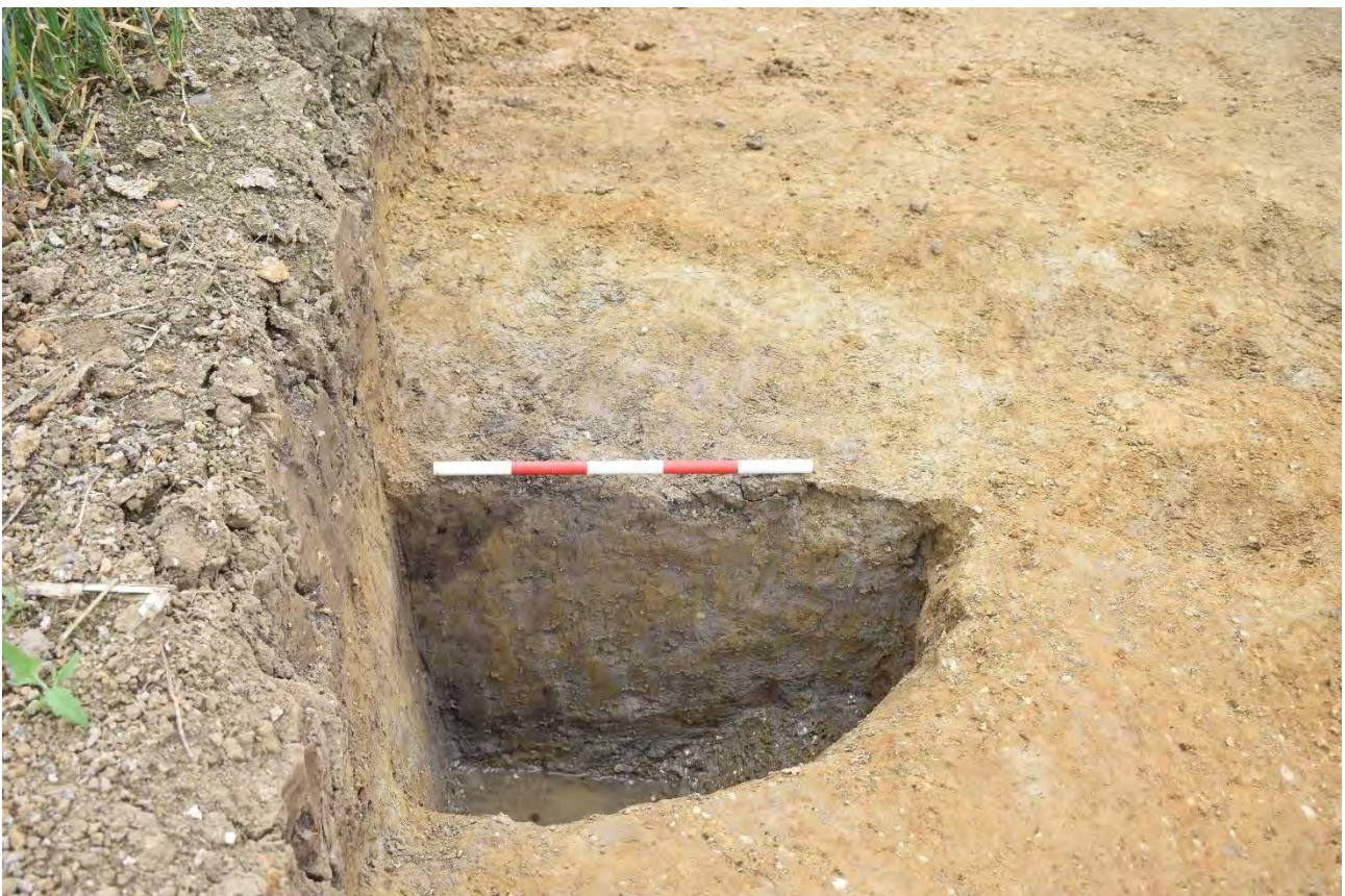
Plate 3.52: Trench 221. Pit [22105]. Looking south.