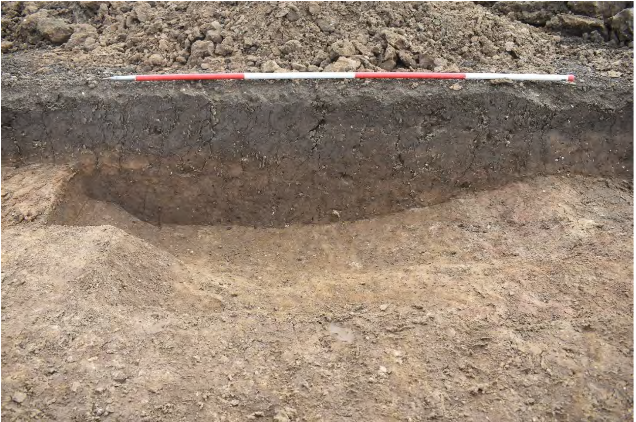
Plate 3.23: Trench 204. Ditch [20402]. Looking southwest.