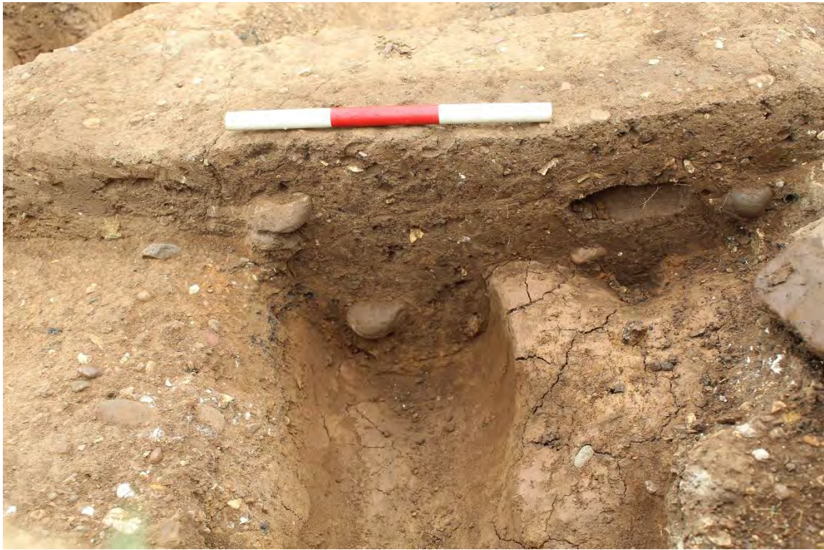
Plate 5.15 Trench 269. Southwest-facing section of gully [26930].