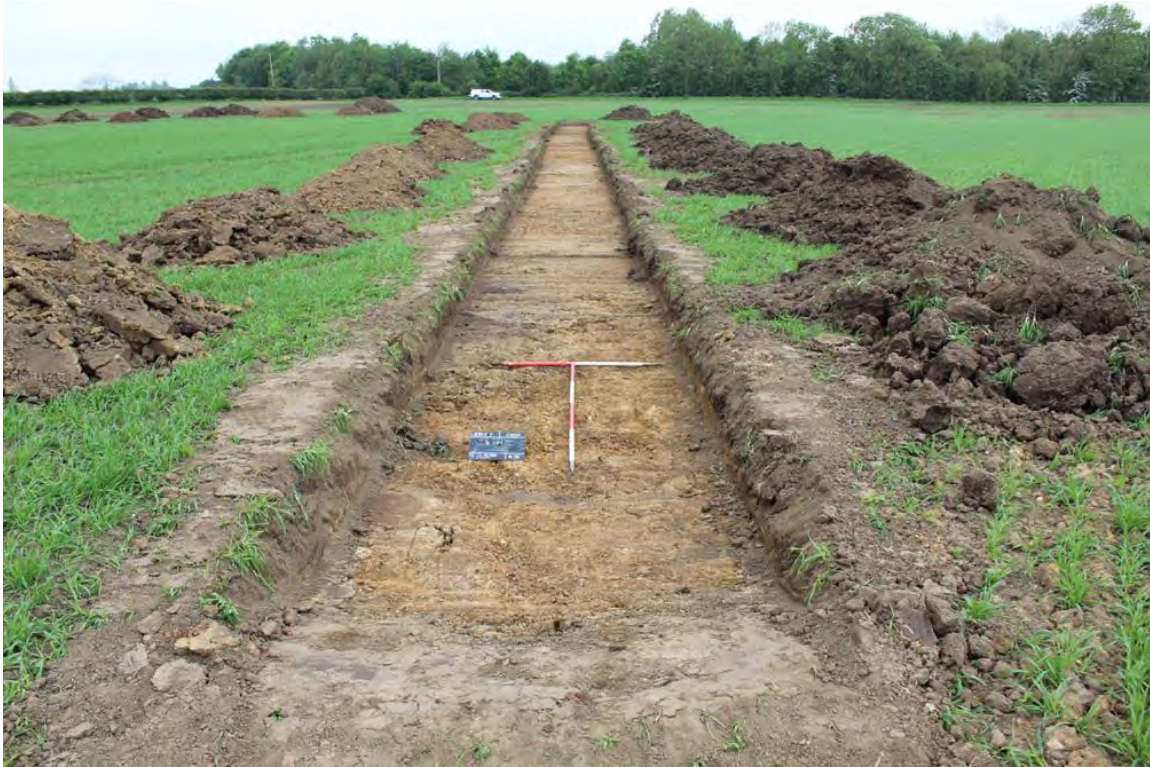
Plate 2.19 Trench 179. Overall shot showing stripped natural surface (17902), looking south-east.