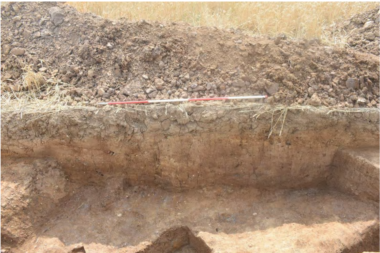
Plate 4.11: Trench 230. Ditch [23039] (left) with ditch [23052] in plan and ditch [23003] in section above. Looking southwest.