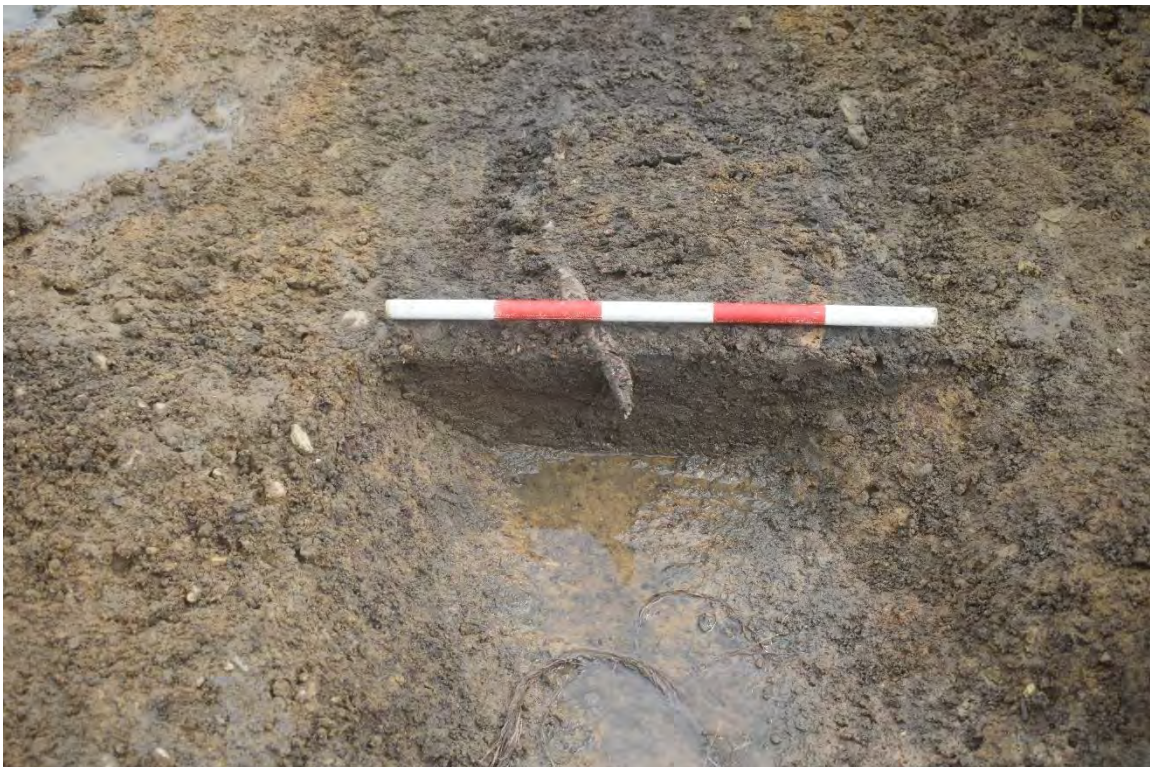
Plate 1.14 Trench 121. Northwest-facing section of ditch [12106], complete with modern rope, looking southeast.