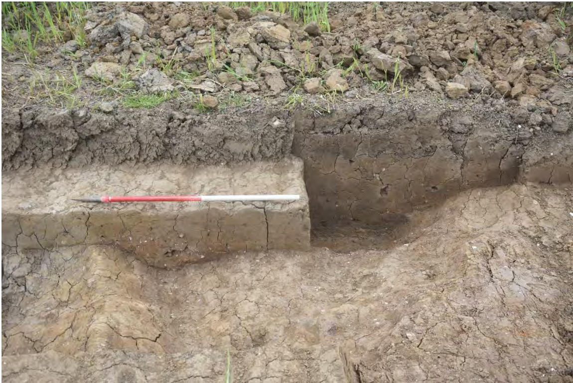
Plate 1.9 Trench 107. South-facing section of pit [10705], looking north.