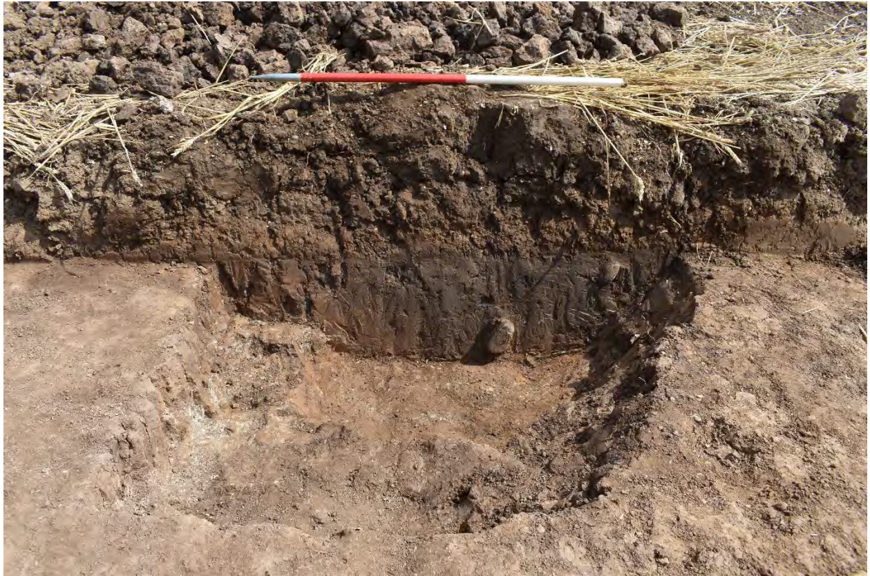
Plate 4.20: Trench 233. Pit or ditch terminus [23322] with deposit (23324). Looking southeast.