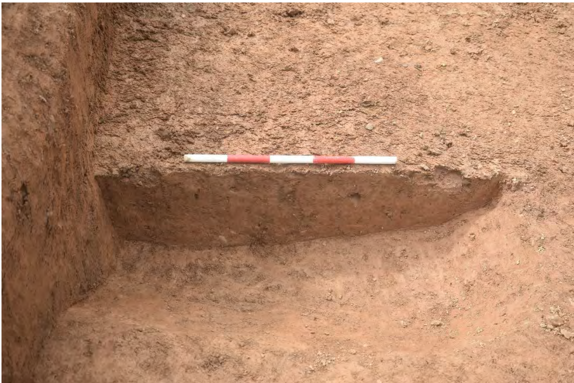
Plate 1.44 Trench 163. Southeast-facing section of pit [16303], looking northwest.