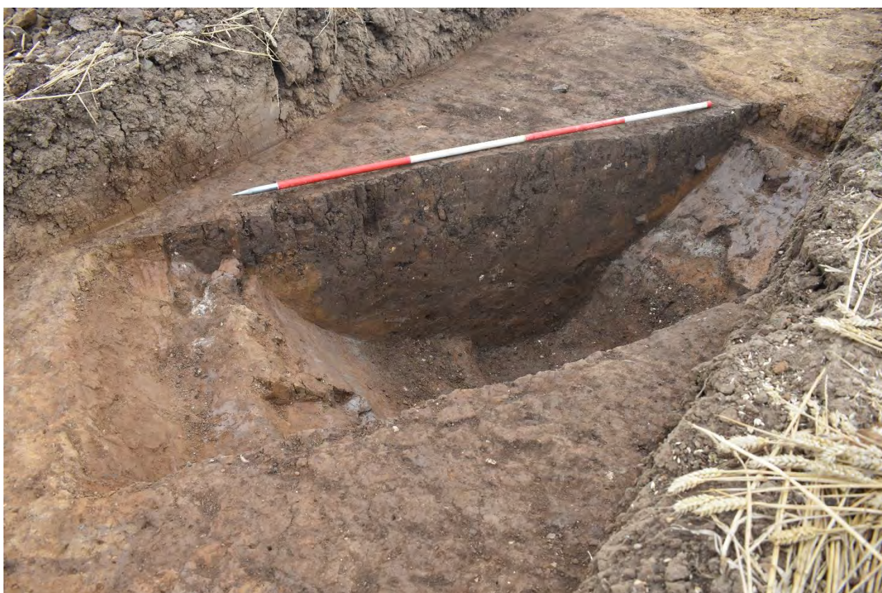
Plate 4.19: Trench 233. Ditch [23329] and posthole [23330]. Looking southeast.