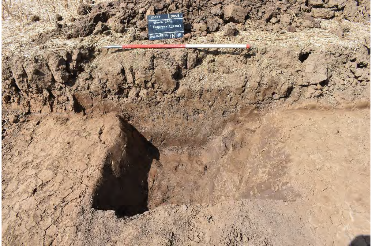
Plate 5.33 Trench 279. Ditch and hedge line [27904]. Facing south-east.