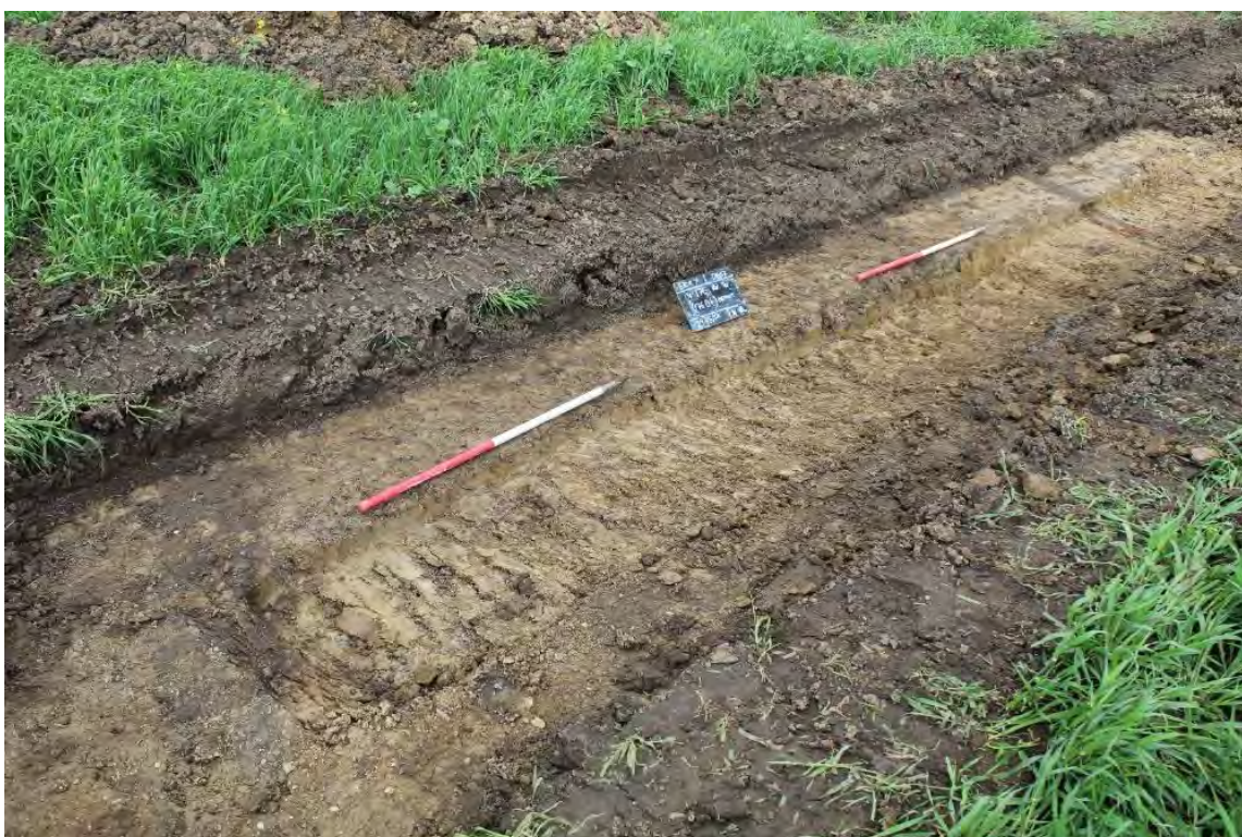
Plate 2.12 Trench 176. Sondage through natural deposit (17606), looking north.