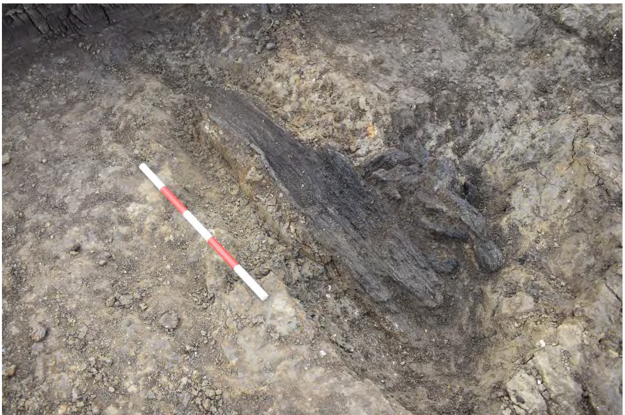
Plate 3.20: Trench 201. Terminus [20112], pit [20107] and wood (20108). Looking southeast.