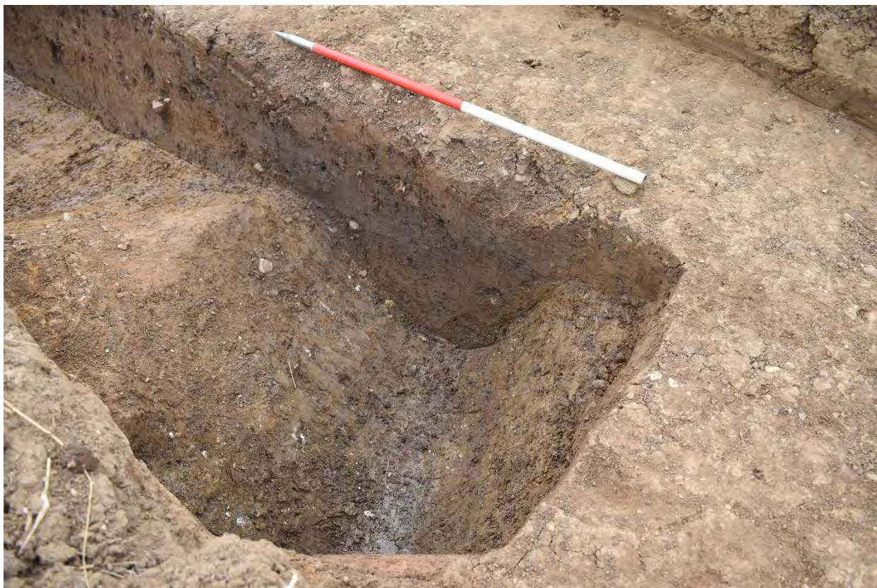
Plate 4.24: Trench 234. Ditch [23415] truncating [23409]. Looking south.