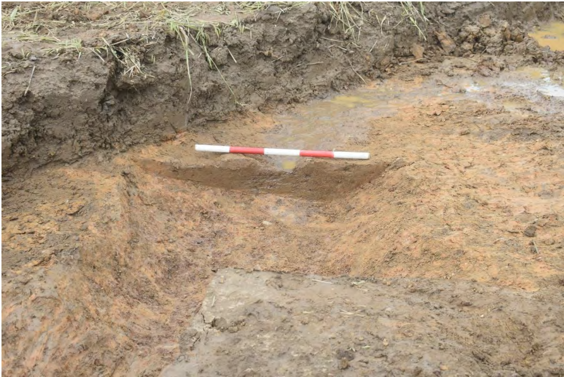
Plate 1.11 Trench 113. Southeast-facing section of ditch [11304], looking northwest.