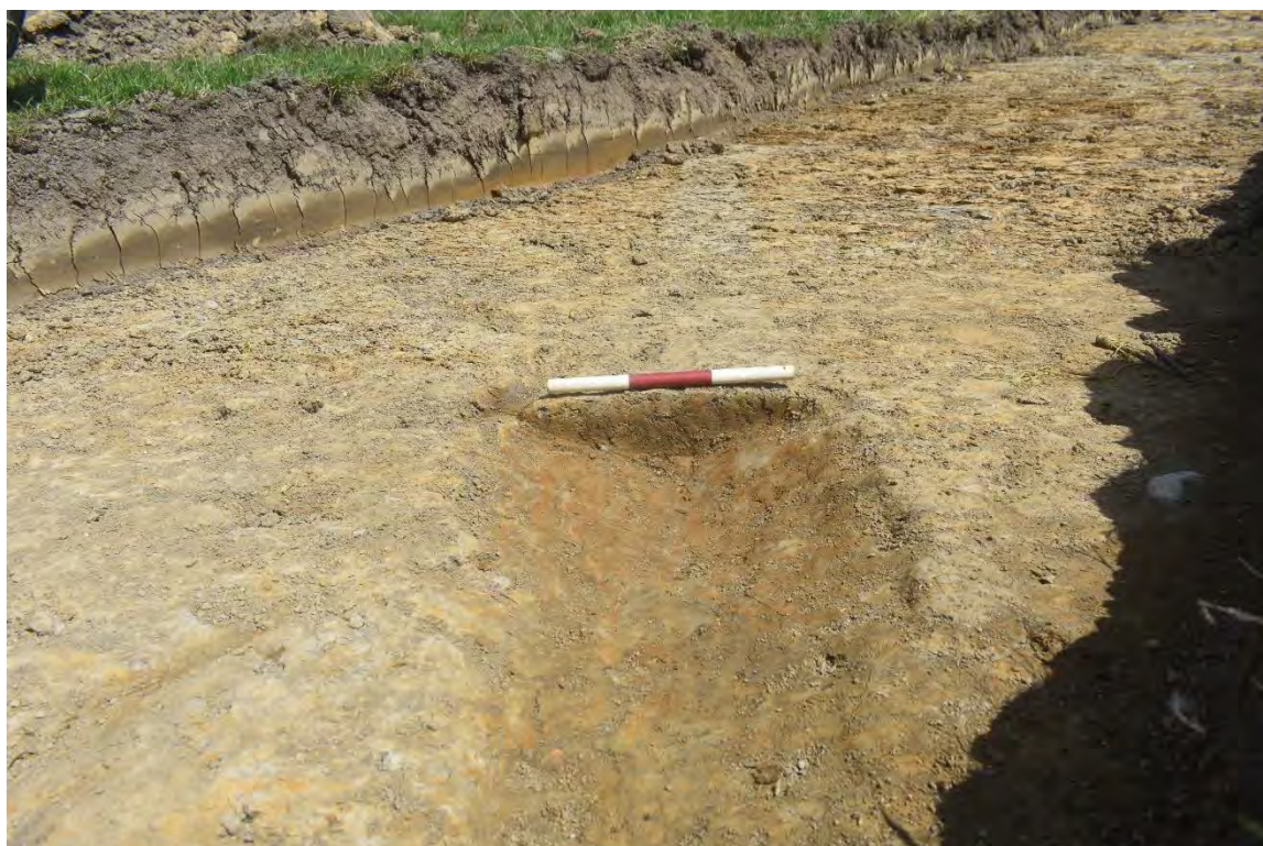
Plate 1.28 Trench 145. West-facing section of gully [14504], looking east.