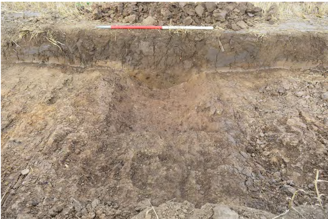
Plate 6.26: Trench 313. Gully [31302], looking west.