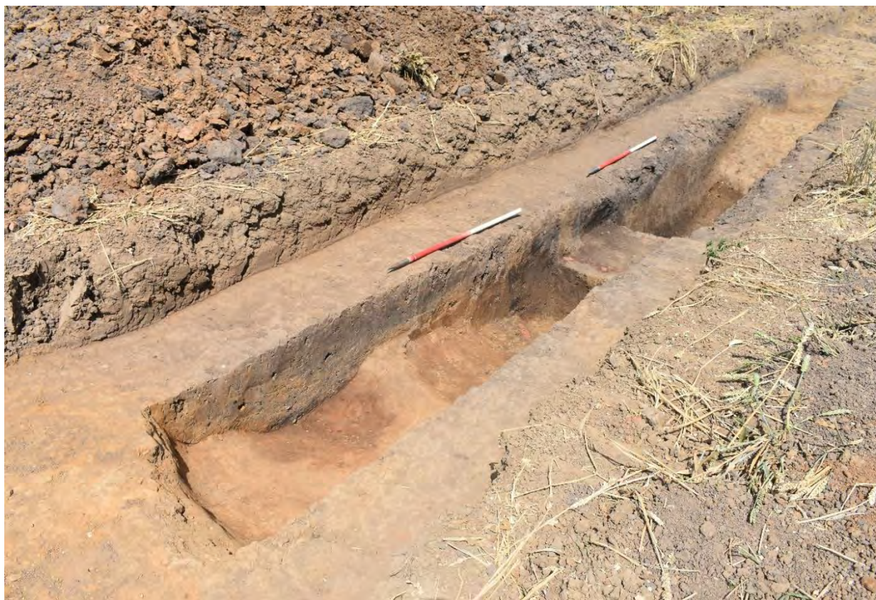
Plate 4.17: Trench 233. Ditches [23305] and [23308] truncated by broad, shallow ditch cut [23342], with ditches [23354], [23353], [23355] and [23352]. Looking north.