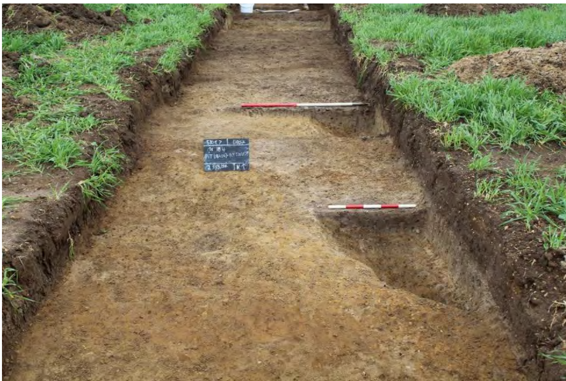
Plate 2.35 Trench 184. Cut of probable natural gully [18004] = [18017] cutting natural (18402), looking north-east.