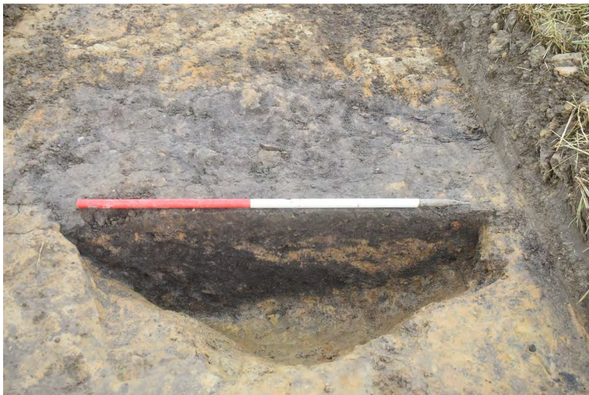
Plate 1.21 Trench 132. southwest-facing section of tree throw, typical for this once-wooded part of site, looking northeast.