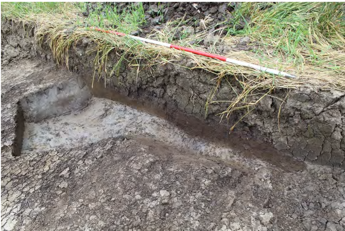
Plate 6.18: Trench 290. Gully [29004], aligned north-south, truncated by later gully [29006]. Looking southeast.