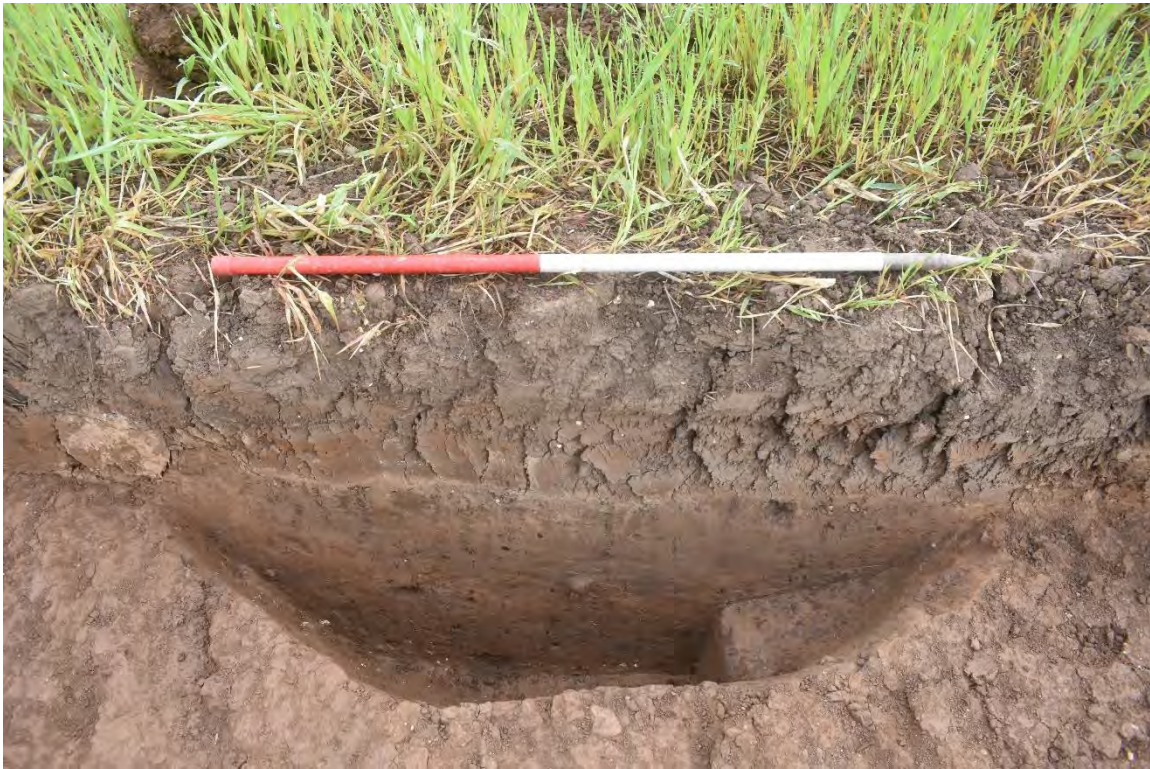
Plate 1.3 Trench 100. Southwest-facing section of pit [10003], looking northeast.