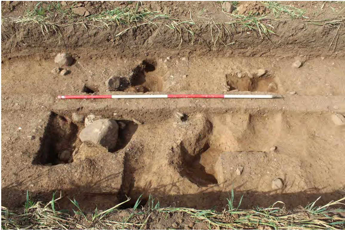
Plate 5.11 Trench 269. Plan view of pit sequence [26941] and gully [26926] as well as several postholes, stakeholes, gullies and overlying deposit (26940).