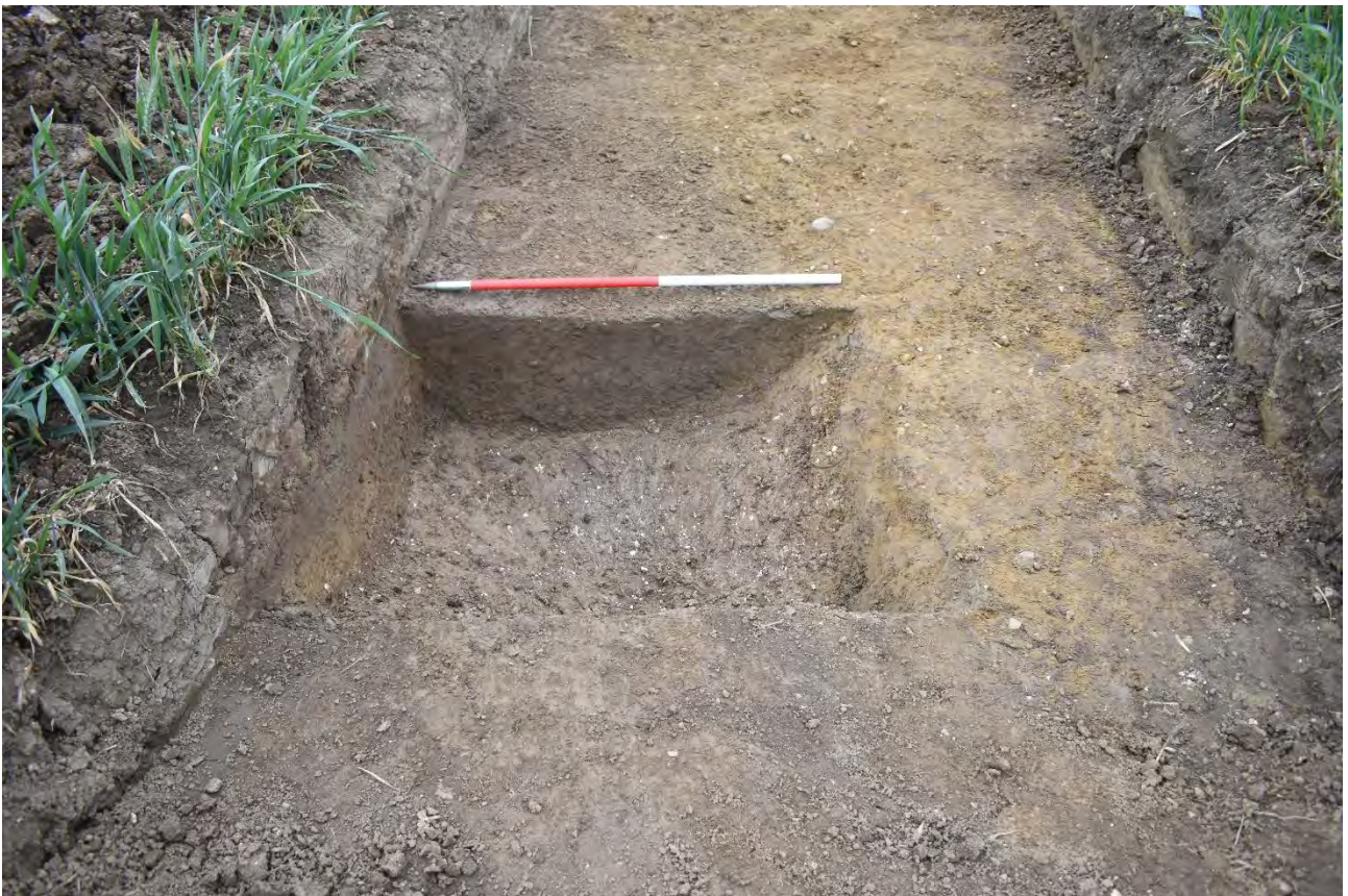
Plate 3.40: Trench 219. Ditch [21913]. Looking east.