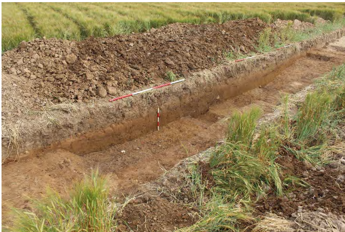
Plate 6.21: Trench 294. Natural hollow [29405] truncated by possible field boundary or drainage ditch [29404]. Looking southeast.