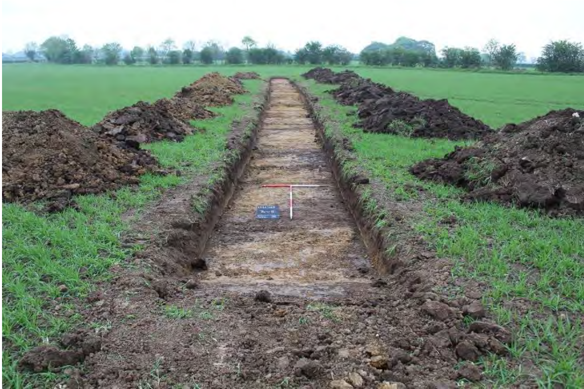
Plate 2.25 Trench 181. Overall shot of Trench 181 showing stripped natural surface (18102) and pre-excitation shot of ditch [18103]. Facing north-east.