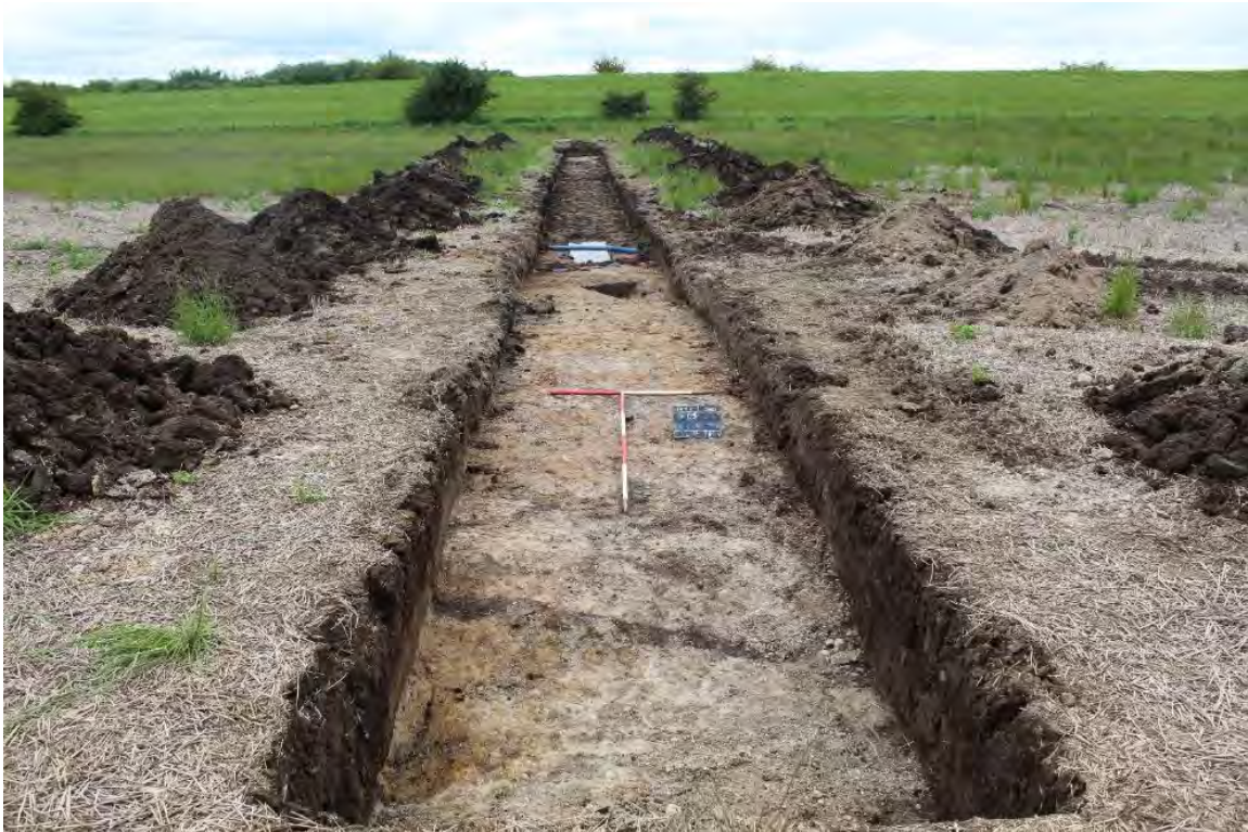
Plate 2.3 Trench 173. Overall shot showing stripped natural surface (17302), looking west.