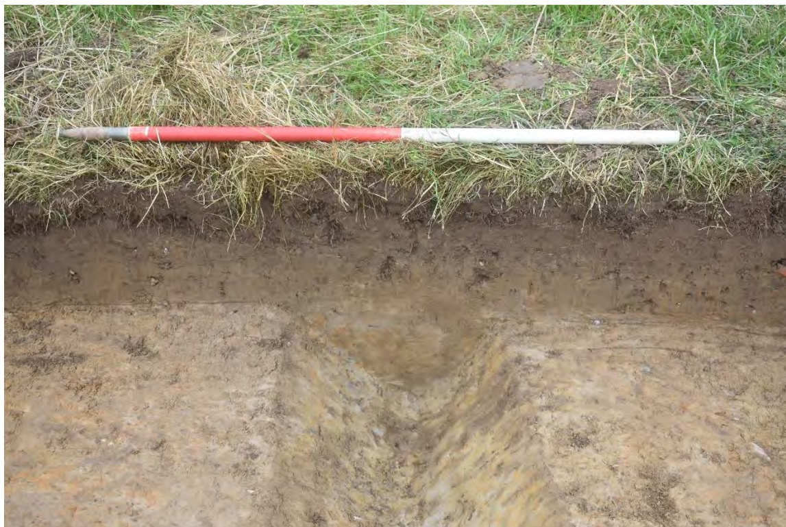
Plate 1.27 Trench 144. North-facing section of gully [14402] and field drain [14404], looking south.