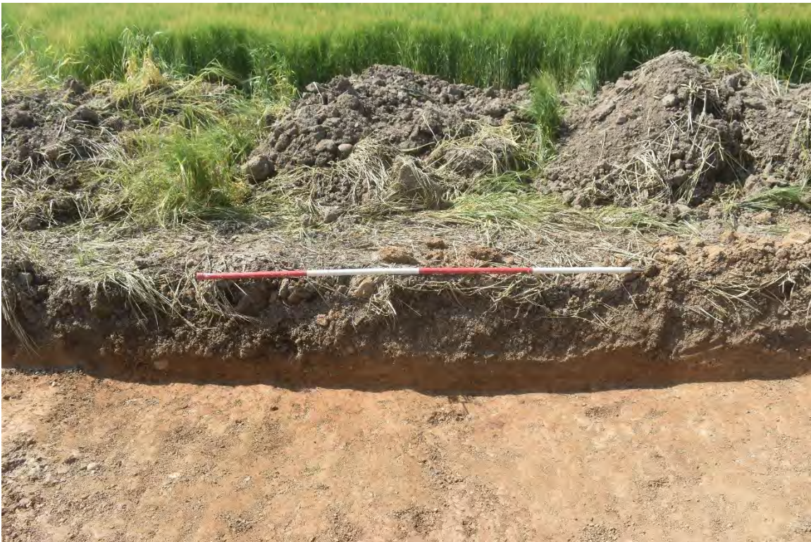
Plate 1.40 Trench 159. Northeast-facing section of modern haul road [15905], looking southwest.