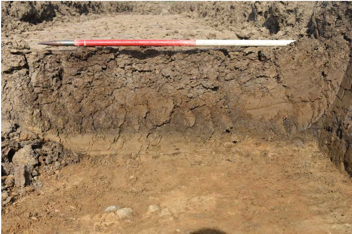
Plate 4.1: Trench 240. Sondage through gleyed deposits. Looking west.