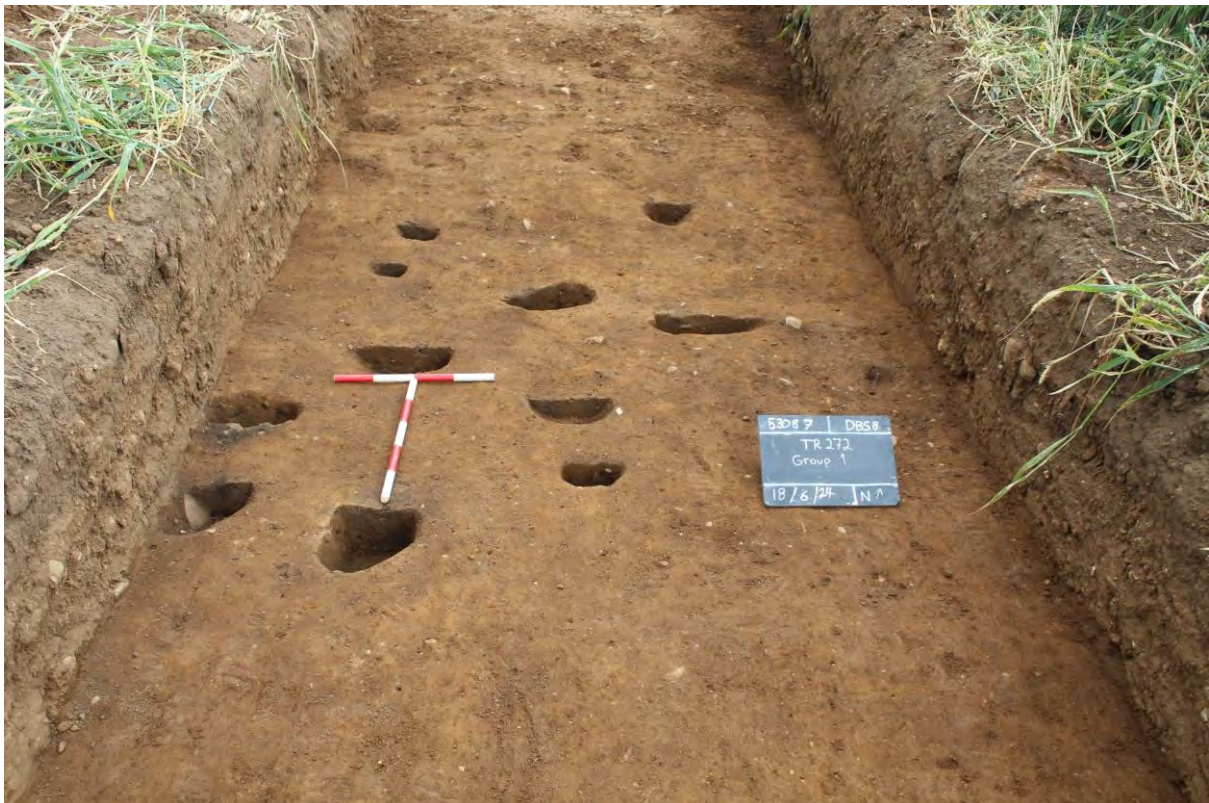
Plate 5.20 Trench 272. Plan view of Group 1 stakeholes, looking northwest.