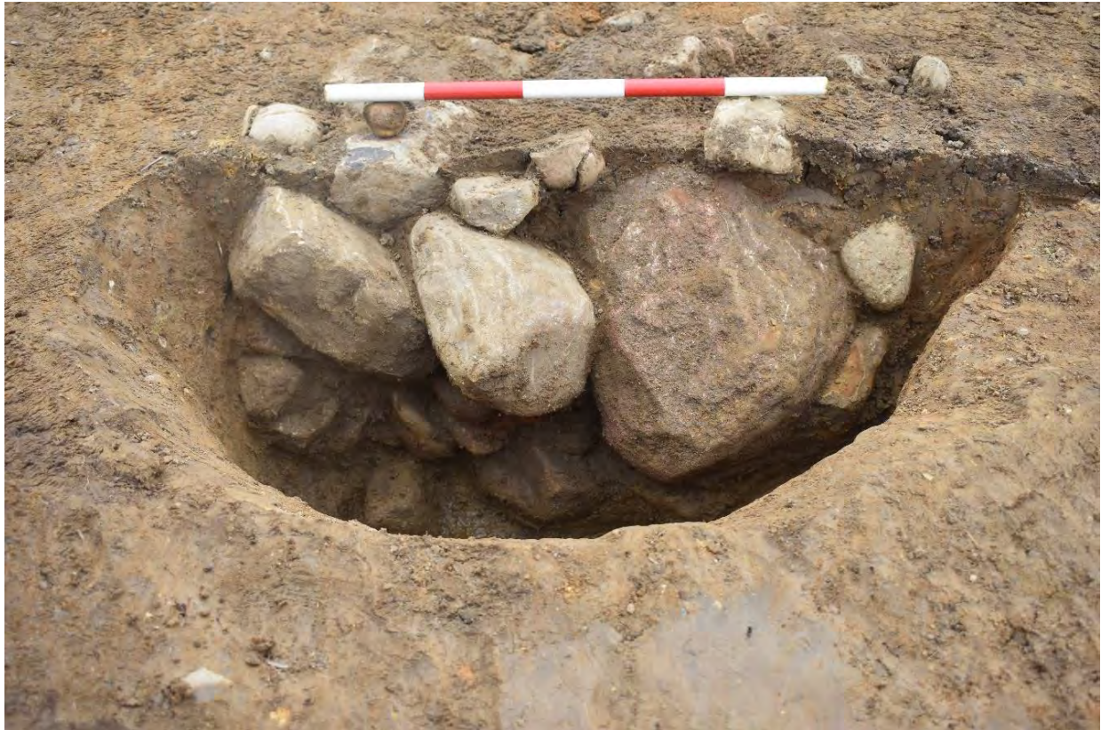
Plate 3.15: Trench 197. Pit [19706]. Looking north.