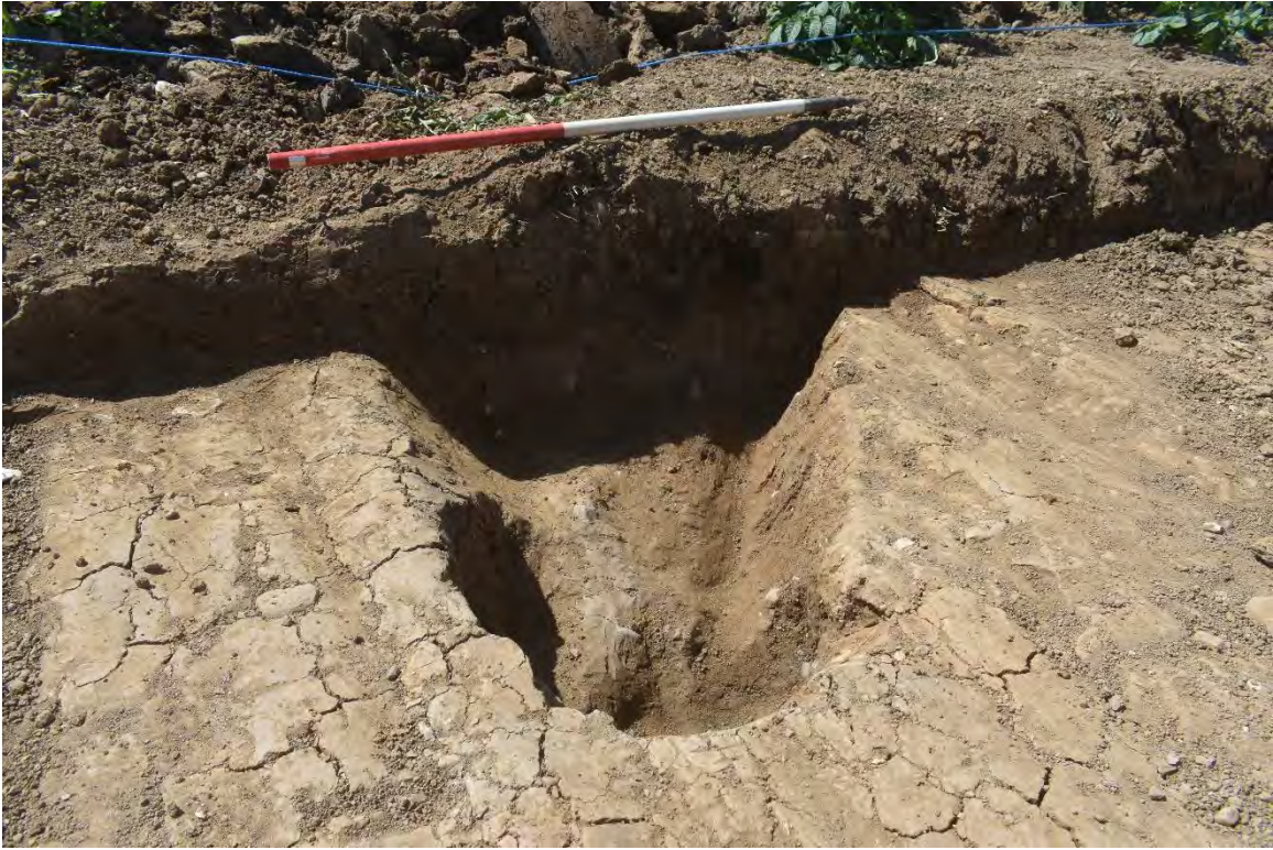
Plate 1.35 Trench 155. Northeast-facing section of gully terminus [15503], looking southwest.