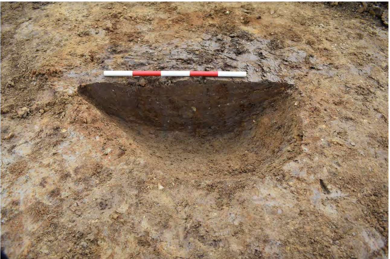
Plate 3.26: Trench 208. Pit [20803]. Looking north.