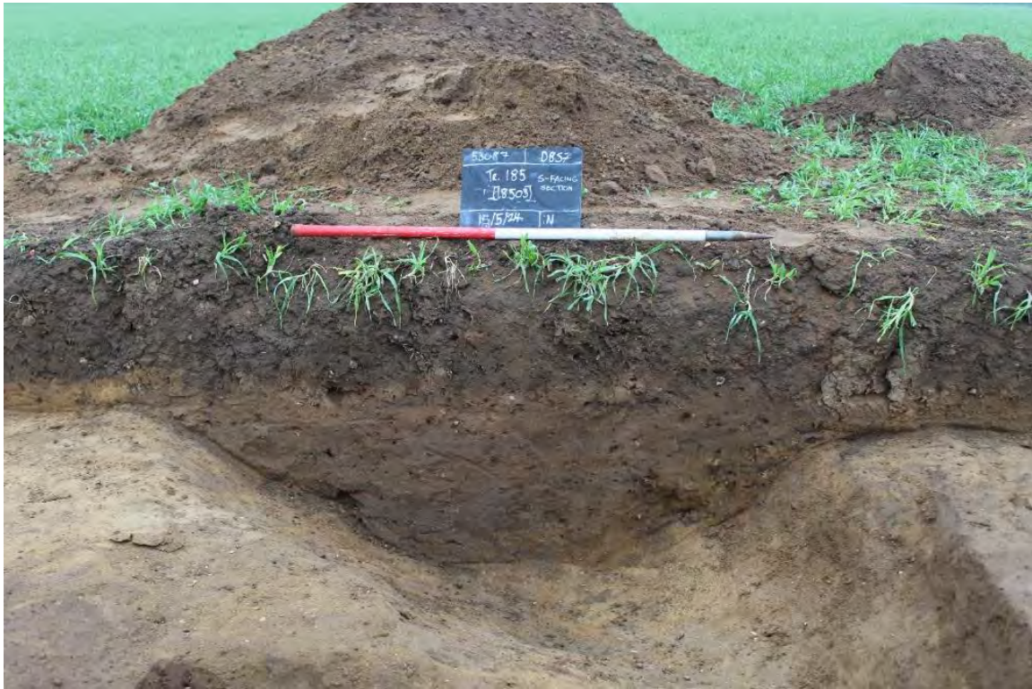
Plate 2.39 Trench 185. Ditch [18503] cutting stripped natural surface (18502), looking south-west.