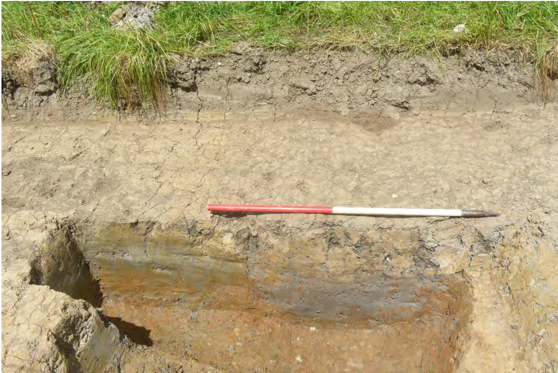
Plate 1.31 Trench 147. South-facing section of ditch [14702] with natural layers (14706), (14705) and (14701), looking north.