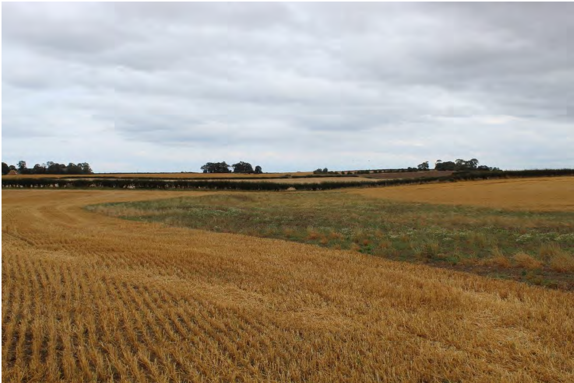
Plate 6.1: Section 3. Overall view of fields in Section 3. Looking northeast.