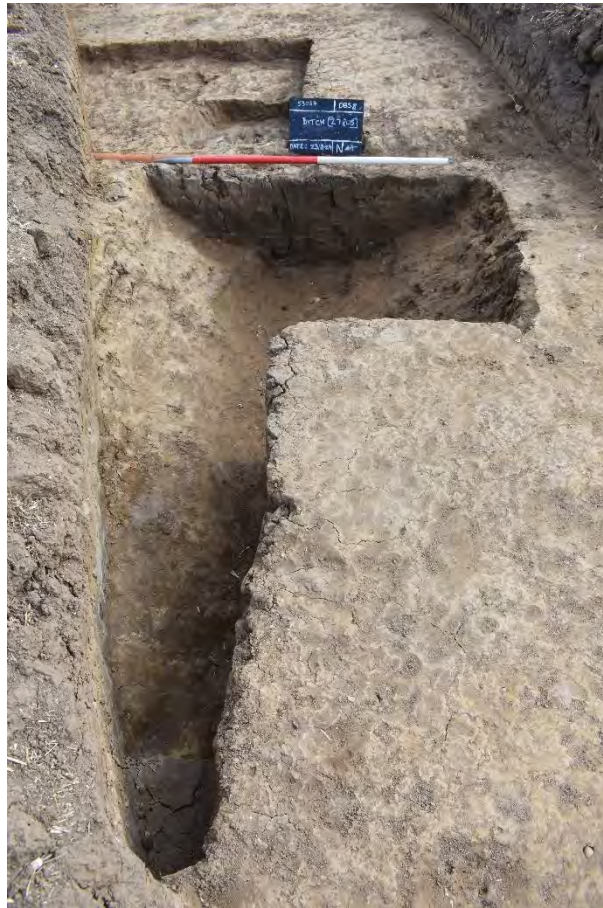
Plate 5.31 Trench 278. Ditch [27805], facing east