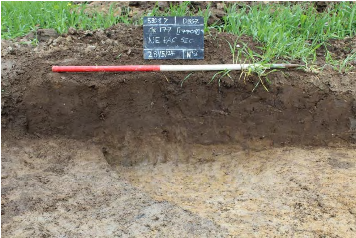
Plate 2.15 Trench 177. Natural feature [17708], looking south-west.